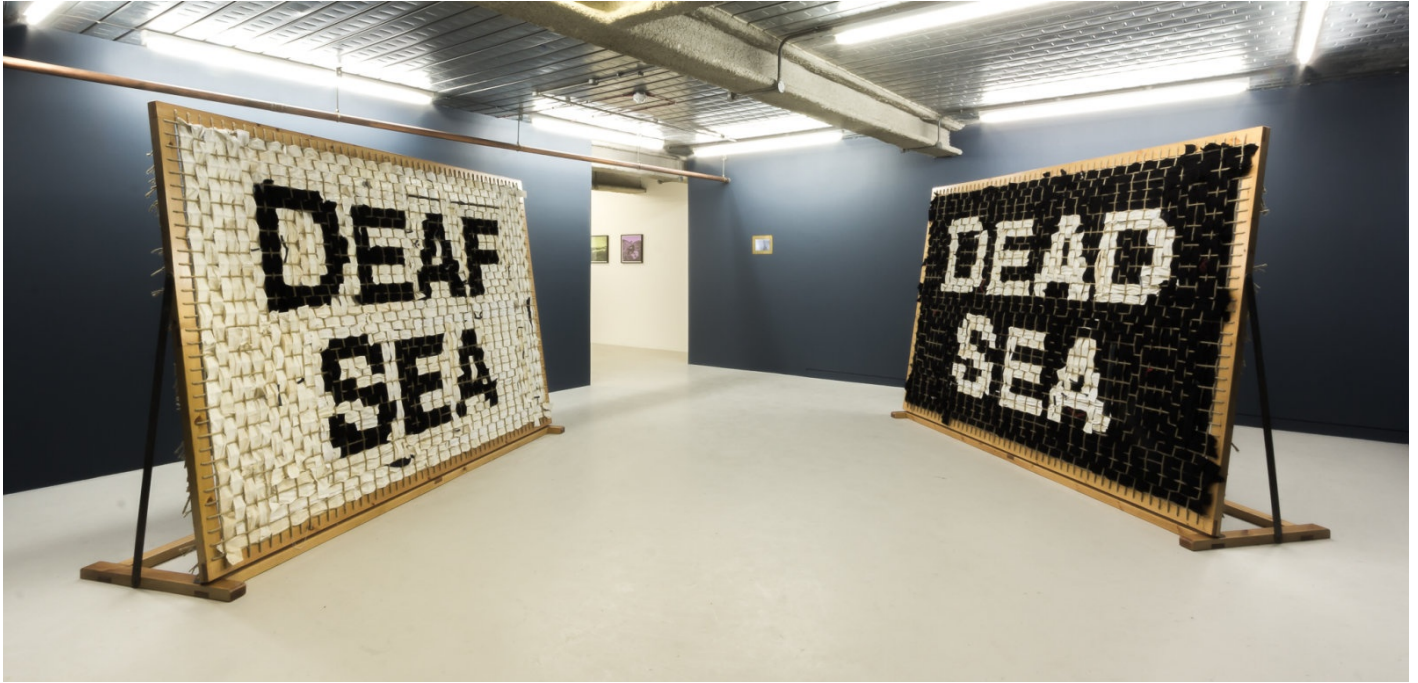
17 February - 31 March Workplace London (Exhibition)