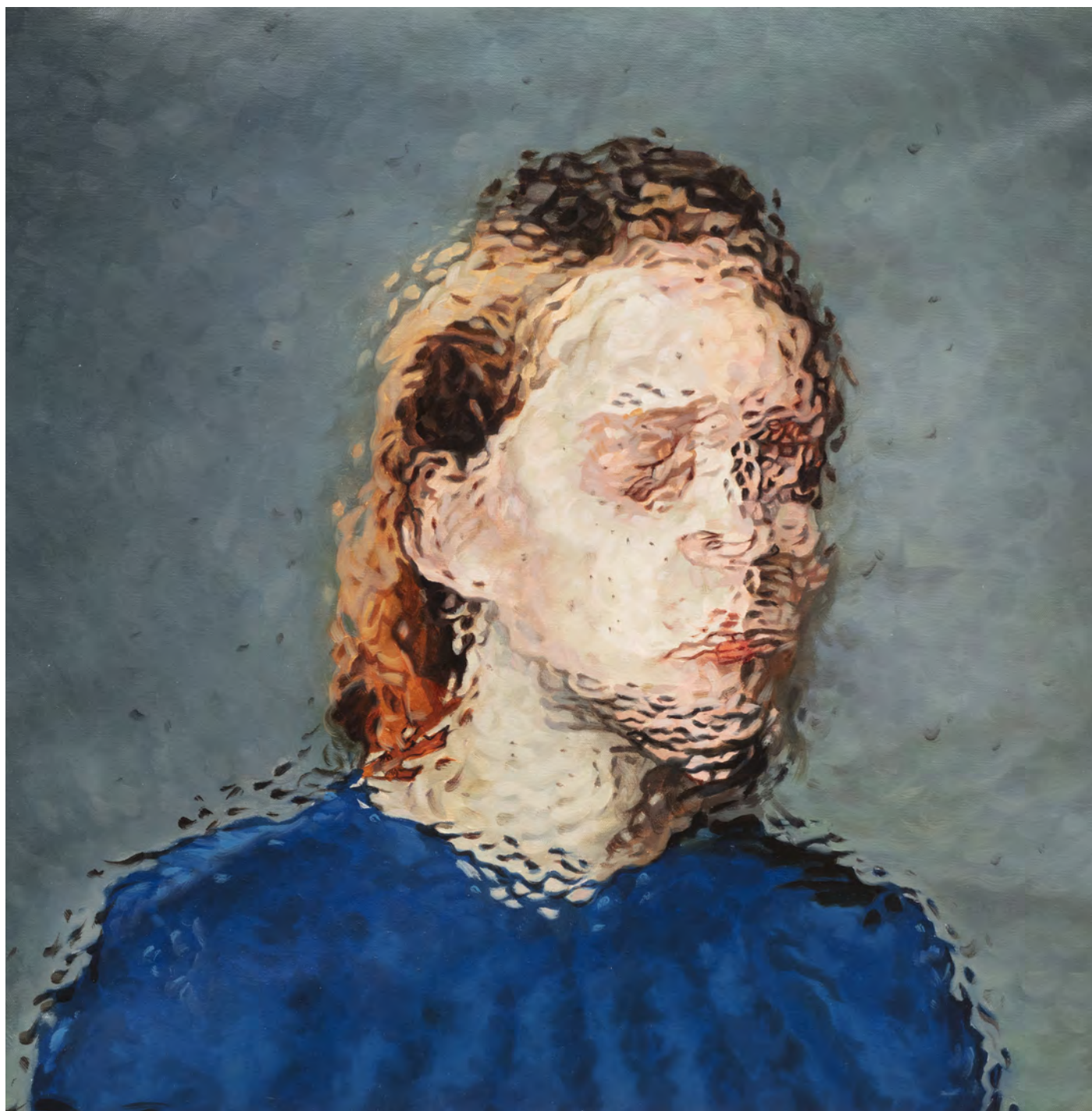
Diango Hernández Silencio, 2021 Oil on canvas 50 x 50 cm