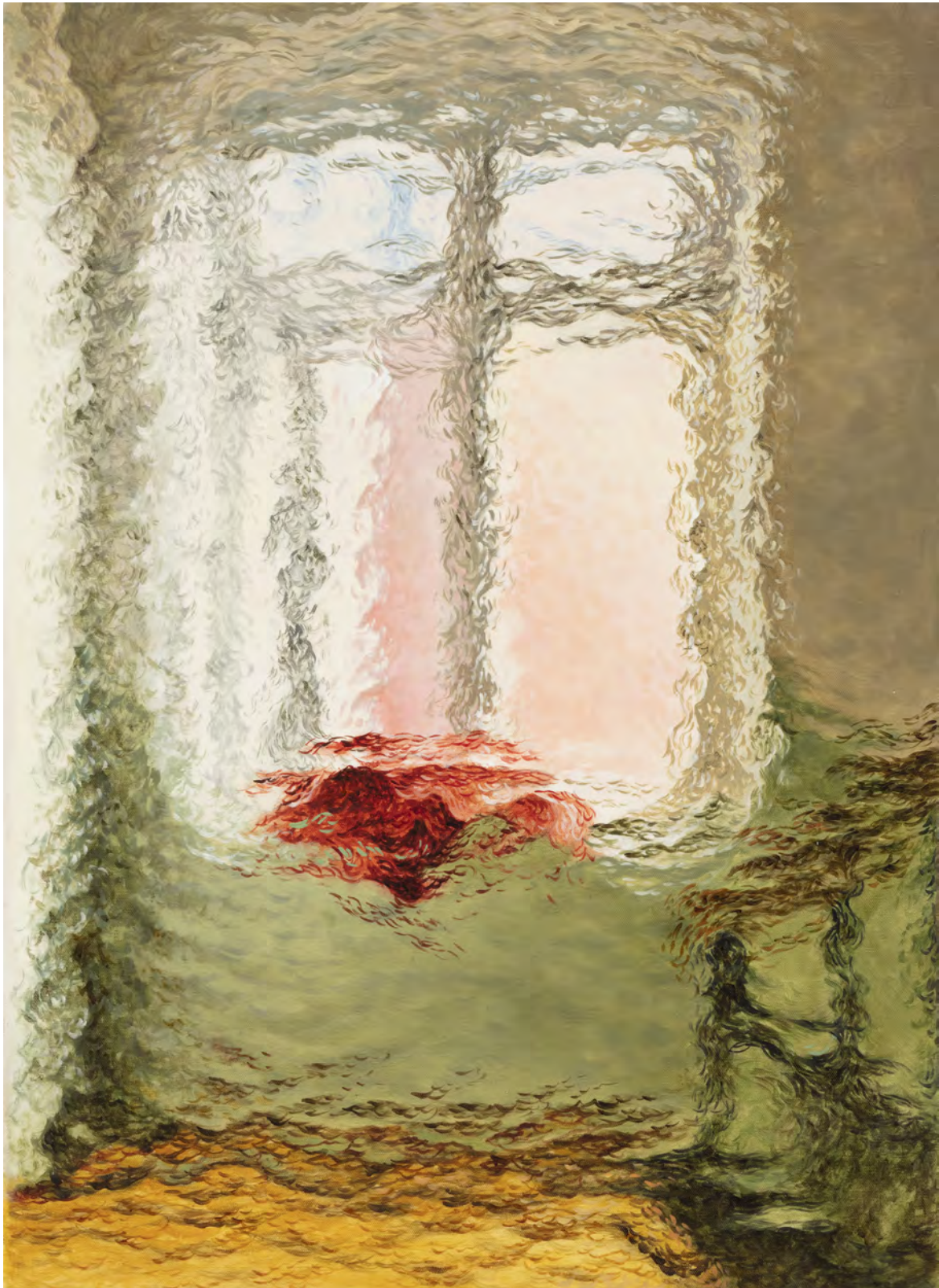
Diango Hernández Premonicion, 2021 Oil on canvas 55 x 40 cm