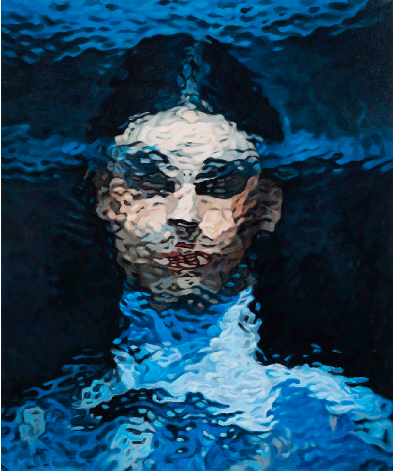
Diango Hernández Celia, 2022 Oil on canvas 60 x 50 cm