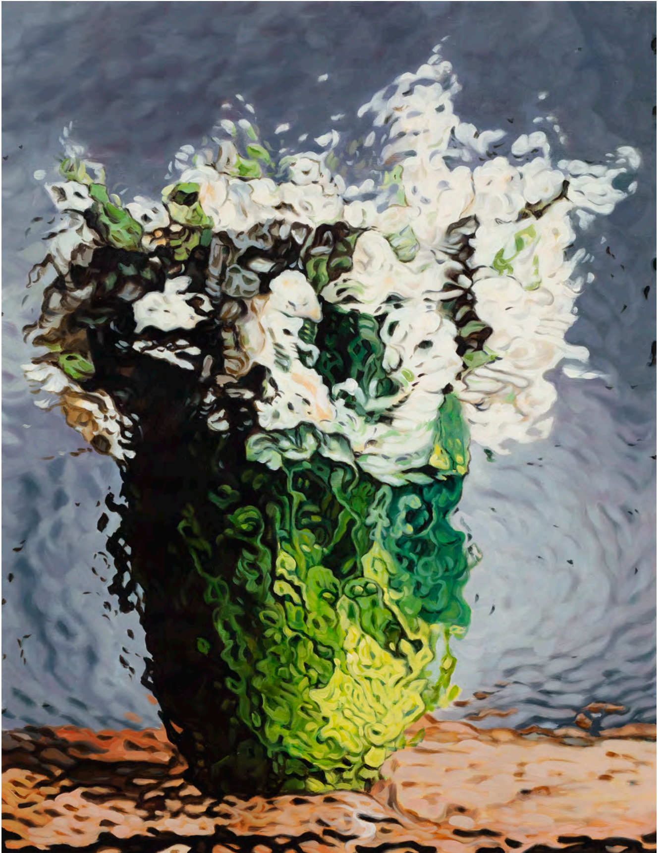
Diango Hernández Flores, 2022 65 x 50 cm Oil on canvas