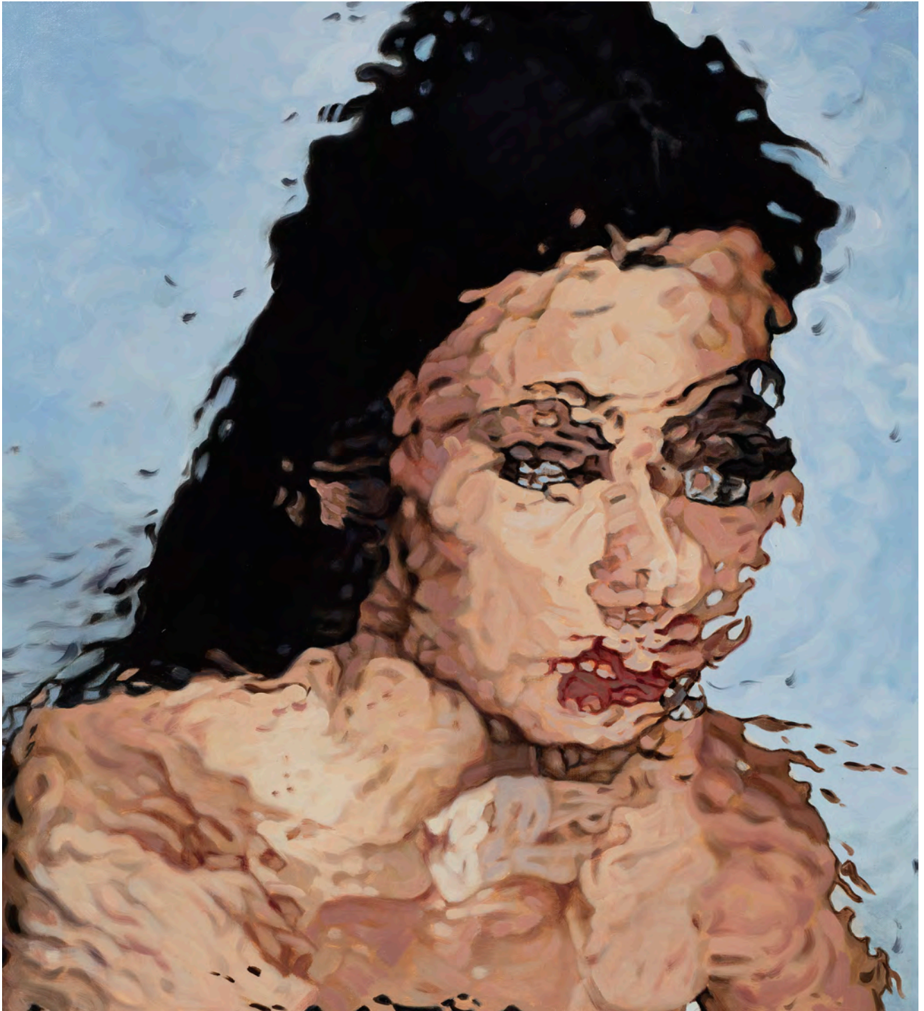
Diango Hernández Vilma, 2022 Oil on canvas 55 x 50 cm