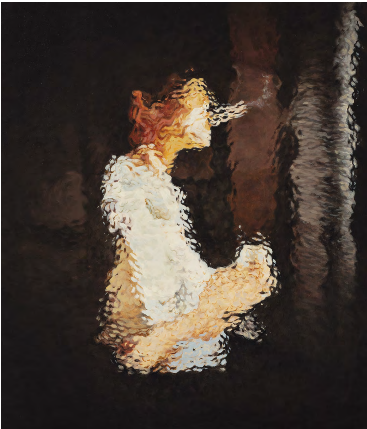
Diango Hernández Contemplacion, 2022 Oil on canvas 60 x 50 cm