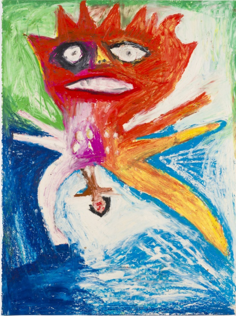
RAMESH MARIO NITHIYENDRAN Red Figure Birthing , 2020