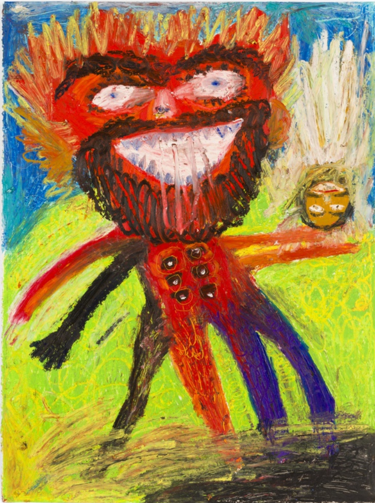
RAMESH MARIO NITHIYENDRAN Red Figure with Human, 2020