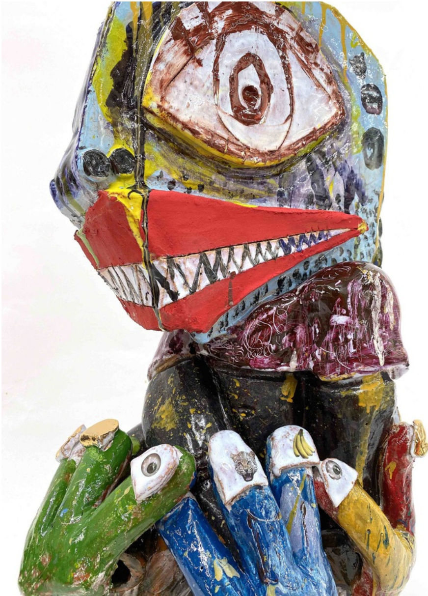
earthenware 64 x 34 x 32 cm (RMN2021-24)