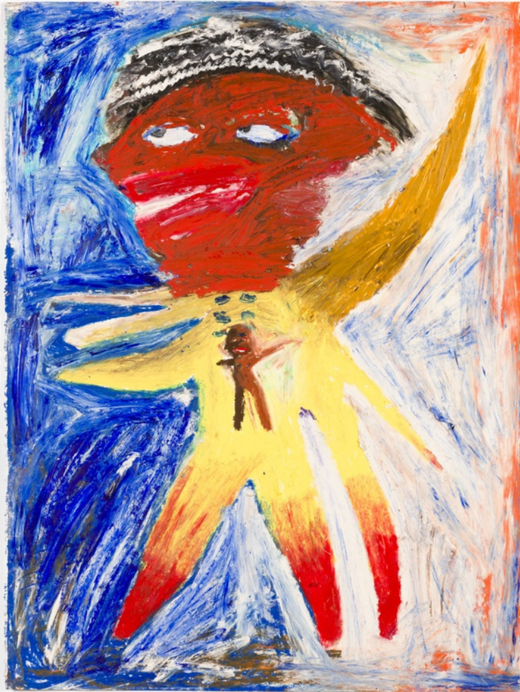
oil pastel on paper 84 x 59 cm (RMN2020-52)