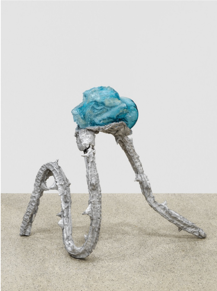
Handblown glass, aluminium 90 x 60 x 74 cm 35 3/8 x 23 5/8 x 29 1/8 in Weight: 15 kg (00399)