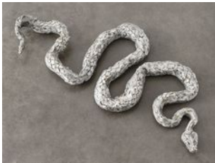
Jean Marie Appriou Stalagmite , 2018 cast aluminium 33 x 181 x 125 cm 13 x 71 1/4 x 49 1/4 in Edition 3/5 Weight: 90 kg (00400)