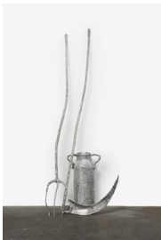
Jean Marie Appriou Harvest No. 1 , 2017 Aluminium 210 x 140 x 60 cm 82 5/8 x 55 1/8 x 23 5/8 in (00393)