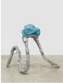
Jean Marie Appriou Ronce , 2019 Handblown glass, aluminium 90 x 60 x 74 cm 35 3/8 x 23 5/8 x 29 1/8 in Weight: 15 kg (00399)