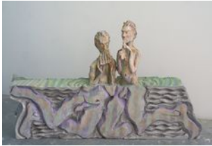
Jean Marie Appriou Reeds , 2019 Aluminium Paint 194 x 30 x 123 cm 76 3/8 x 11 3/4 x 48 3/8 in Weight: 120 kg

For full details and larger images, please see the end of this document.