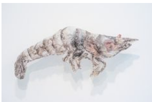
Jean Marie Appriou Shrimp , 2018 Blown glass 50 x 30 x 15 cm 19 3/4 x 11 3/4 x 5 7/8 in Weight: 13kg (00395)