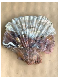
Jean Marie Appriou Coquille St Jacques , 2019 Aluminium and glass 50 x 50 x 15 cm 19 3/4 x 19 3/4 x 5 7/8 in Weight: 30 kg