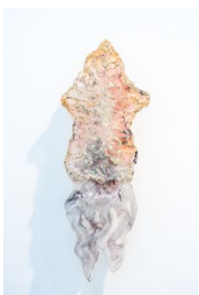
Jean Marie Appriou Cuttlefish , 2018 Brown glass 50 x 30 x 15 cm 19 3/4 x 11 3/4 x 5 7/8 in Weight: 13 kg (00398)