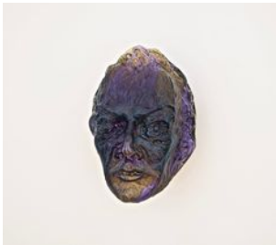
Jean Marie Appriou Blake , 2019 Aluminium and glass 42 x 40 x 30 cm 16 1/2 x 15 3/4 x 11 3/4 in Weight: 10 kg (00402)