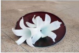
Jean Marie Appriou Jasmine No. 2 , 2017 Glass 50 x 50 x 40 cm 19 3/4 x 19 3/4 x 15 3/4 in Weight: 10 kg (00394)