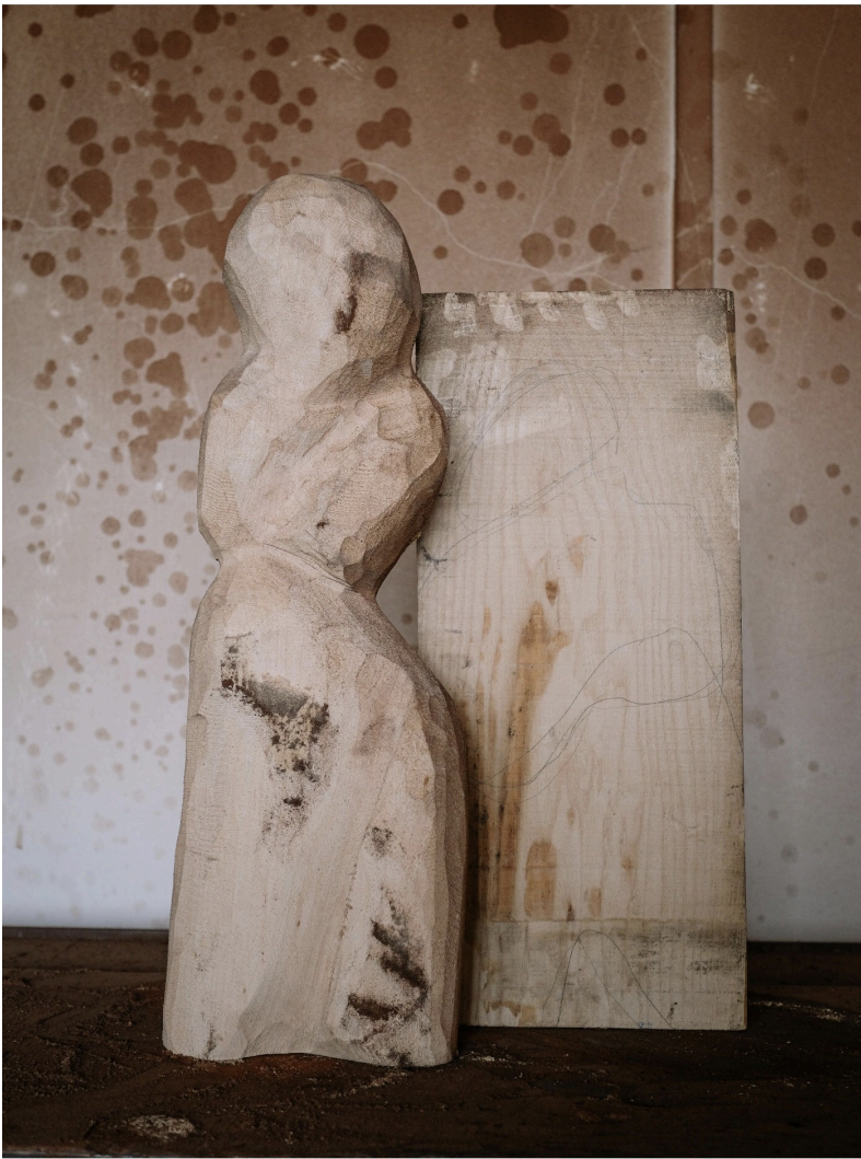
The early stages of a sculpture.

While Gill-Hille's sculptures appear fluid, creating them is a highly laborious and time-consuming process. Carving the wood, she's constantly moving her body and switching angles, using an array of tools — from chainsaws, to wood-carving bits on angle grinders, gouges and chisels.