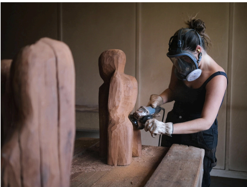
Working in a free-carving style, body-like forms emerge from a piece of sheoak.