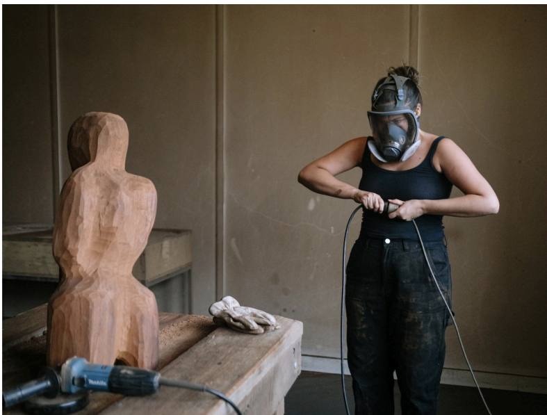
Tools of the trade.

"I think it's like driving a car, or like people that surf, if you lose caution completely, it's when accidents happen ... the truth is the tools are dangerous," she says. "Being cautious and confident at the same time is important, but being arrogant or thinking that they're just there to serve you is not. Bad things can happen ... I had almost all my lecturers at furniture design school missing digits!" But, for Gill-Hille, the most insidious risk of this work is that fine red wood dust that moves through the air and coats the space. "Because of the type of work I do, where it's free carving, it's actually really hard to have any sort of extraction of the dust ... that's why I use the safety equipment like respirators," says Gill-Hille. "As much as I want my fingers and eyes, protecting my lungs is definitely the bit I care about the most."