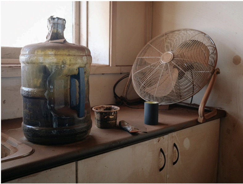
Wood dust coats surfaces in the studio.