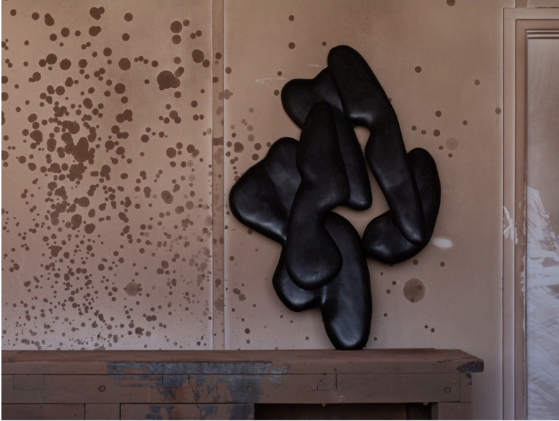
The interlinked curved shapes of a piece from the artist's series Asymptote — a word describing a line that a curve approaches as it moves towards infinity.