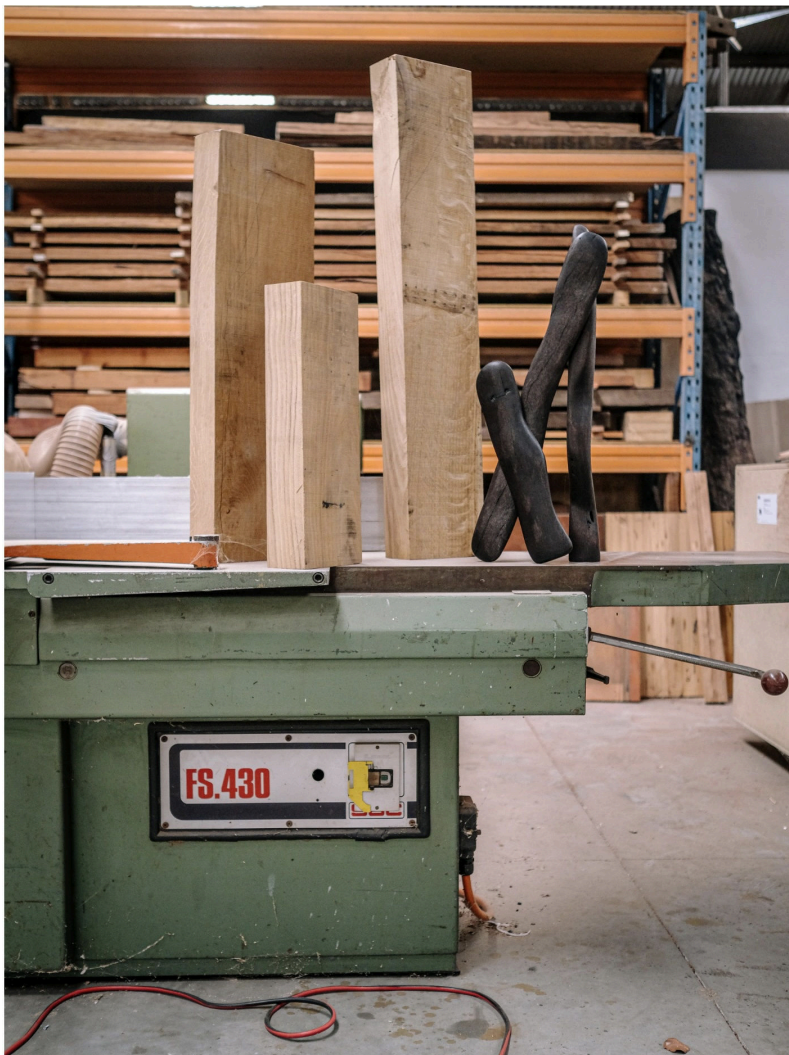
Pieces of salvaged timber, alongside a completed work, made from ebonised jarrah.