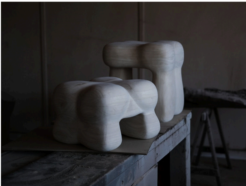
Sculptures titled Figure 1 & 2 . "Compared to metal work or something, wood is a really natural material. It's almost like an extension of our own sort of matter," says Gill-Hille.

Gill-Hille has long felt connected to wood as a material. "I think there's something really warm about it. I feel like it's a texture we all can recognise," she says. "A big part of timber for me as well is that it feels quite connected to humans."