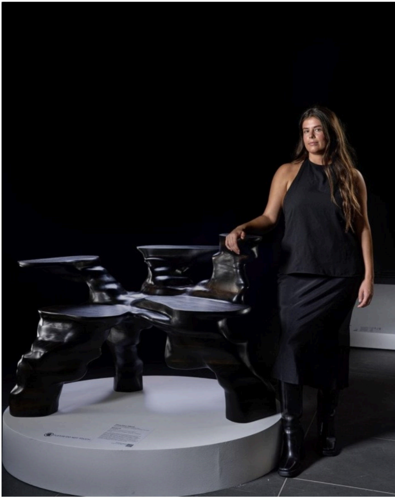
This piece, Nocturne, an ebonised table made up of limb-like shapes, featured in the Art Gallery of South Australia's 2023 Ramsay Art Prize.