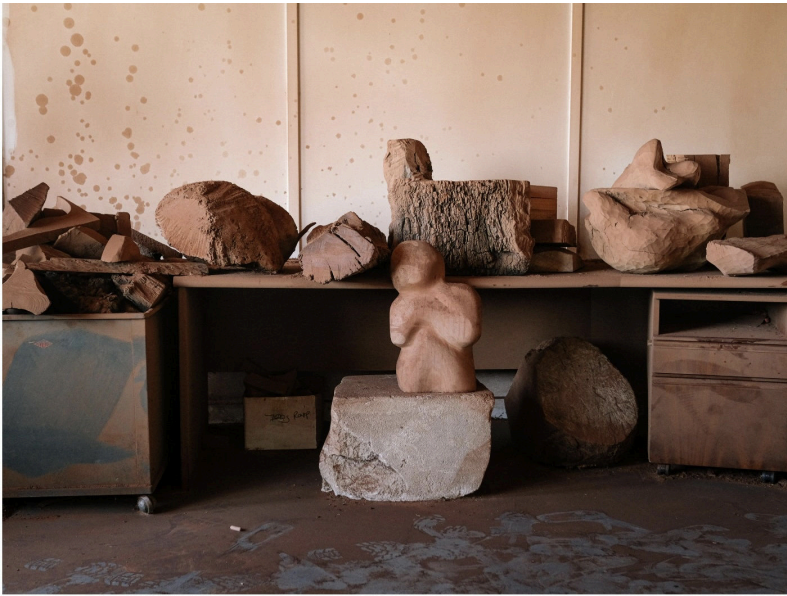
The rich tones of WA timbers, in various stages of development.

"I think it's like driving a car, or like people that surf, if you lose caution completely, it's when accidents happen ... the truth is the tools are dangerous," she says. "Being cautious and confident at the same time is important, but being arrogant or thinking that they're just there to serve you is not. Bad things can happen ... I had almost all my lecturers at furniture design school missing digits!" But, for Gill-Hille, the most insidious risk of this work is that fine red wood dust that moves through the air and coats the space. "Because of the type of work I do, where it's free carving, it's actually really hard to have any sort of extraction of the dust ... that's why I use the safety equipment like respirators," says Gill-Hille. "As much as I want my fingers and eyes, protecting my lungs is definitely the bit I care about the most."