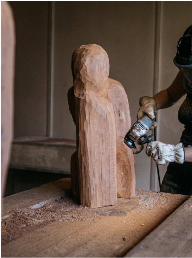
The artist spent several years in Melbourne studying woodworking, before returning to her home state of WA, where she works with local varieties of timber.