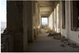
Mariam Ghani A Brief History of Collapses (8) , 2012 set of 8 digital c prints