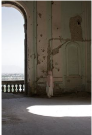
Mariam Ghani A Brief History of Collapses (3) , 2012 set of 8 digital c prints