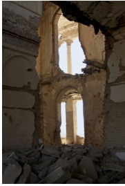
Mariam Ghani A Brief History of Collapses (7) , 2012 set of 8 digital c prints