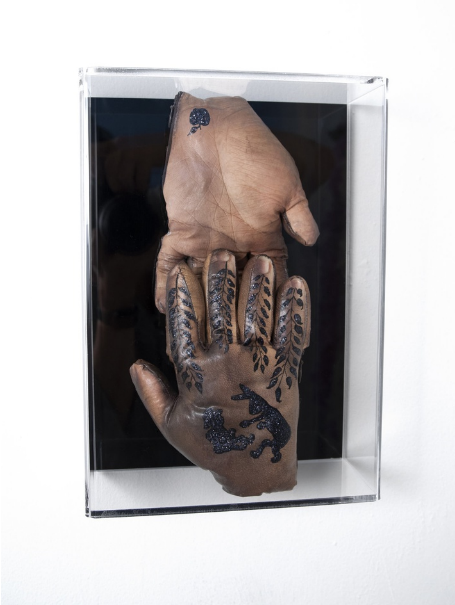
photo transfers on fabric, acrylic, glitter, zipper, polyester-fill, wire, acrylic box 12.75 x 3.75 x 8.87 inches