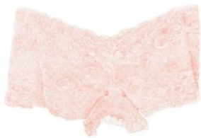
Azita Moradkhani Scream (Victorious Secrets) , 2016 colored pencil on paper 16 x 18 inches