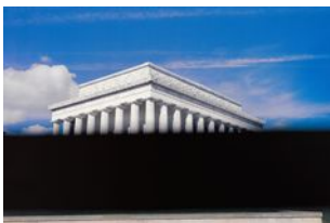
Nona Faustine Lincoln Memorial, 2019 graphite signed: lower margin silkscreen on paper