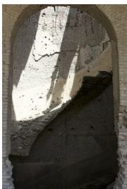
Mariam Ghani A Brief History of Collapses (5) , 2012 set of 8 digital c prints