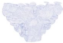
Azita Moradkhani Revolution (Victorious Secrets) , 2019 colored pencil on paper 19 x 24 inches