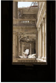
Mariam Ghani A Brief History of Collapses (1) , 2012 set of 8 digital c prints