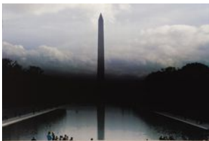
Nona Faustine Liberty or Death, Sons of Africa, 2019 graphite signed: lower margin silkscreen on paper