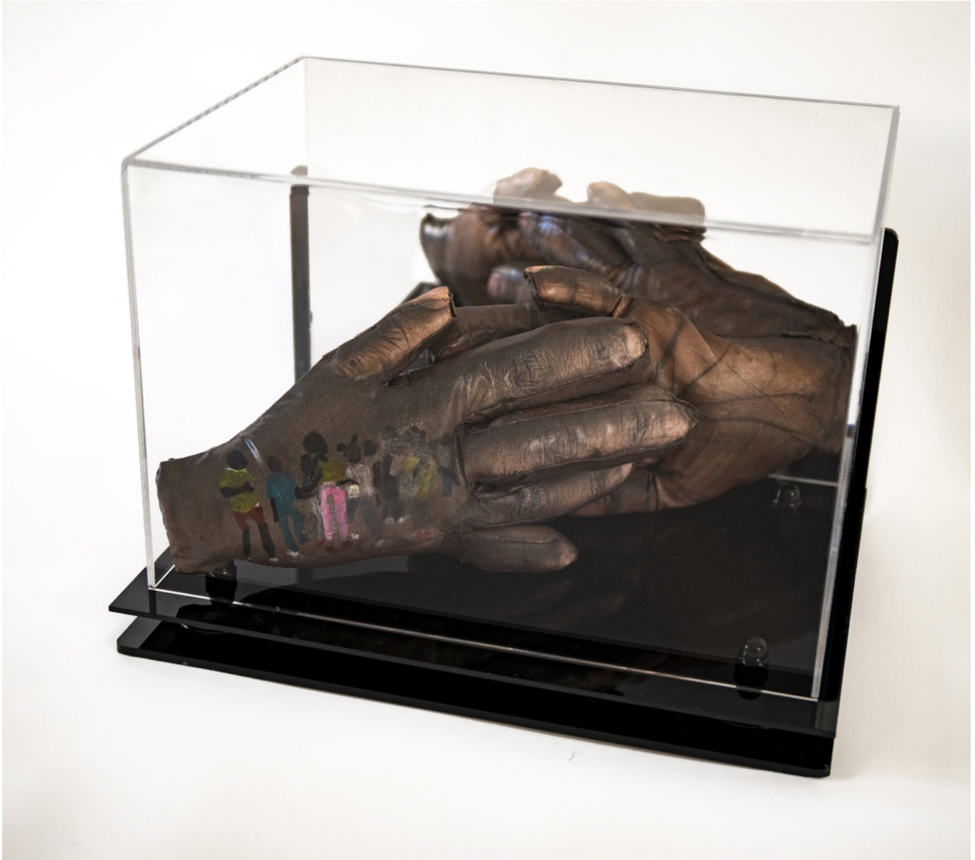
Photo transfers on fabric, acrylic, wire, zipper, polyester-fill, wire, acrylic box