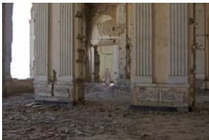
Mariam Ghani A Brief History of Collapses (4) , 2012 set of 8 digital c prints