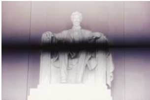
Nona Faustine Land of Freedoms Heaven, 2019 graphite signed: lower margin silkscreen on paper