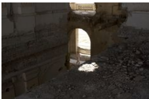
Mariam Ghani A Brief History of Collapses (6) , 2012 set of 8 digital c prints