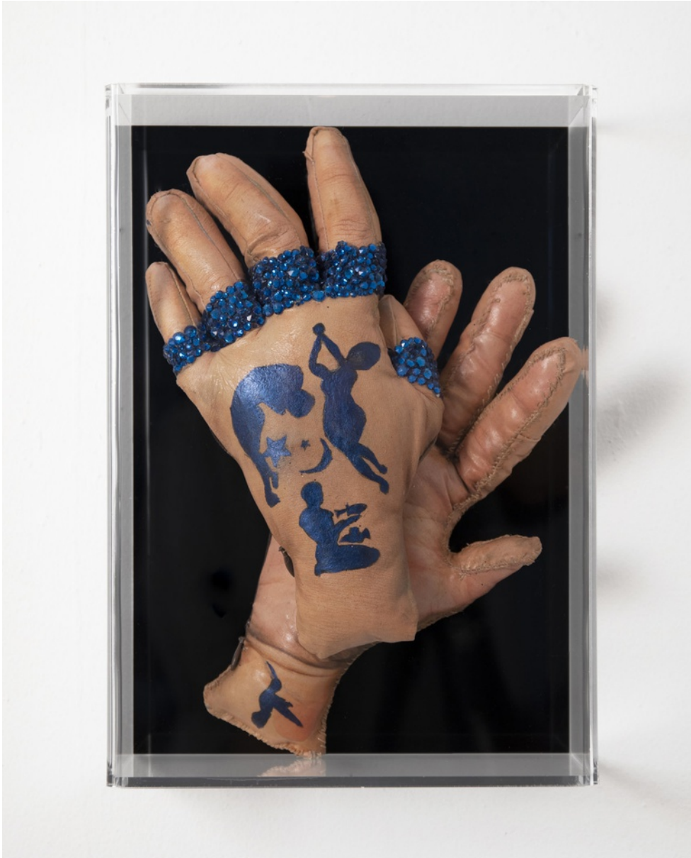
photo transfers on fabric, acrylic, Swarovski crystals, zipper, polyester-fill, wire, acrylic box 12.75 x 3.75 x 8.87 inches