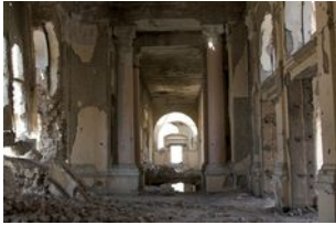
Mariam Ghani A Brief History of Collapses (2) , 2012 set of 8 digital c prints