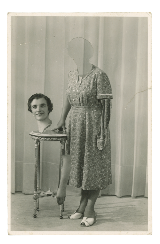
Kensuke Koike, Little by Little, 2023

Kensuke Koike creates surrealist compositions that are aimed to challenge the possibilities of image making. His practice centers around a 'no more, no less' philosophy. Koike explores ways of creating a new image from the elements of the original. While he prototypes and experiments, there is only a single chance to work with the original photograph. He notes that "I began to use archival images because I wanted to try something more challenging and to delve deeper into the meaning of an image. More risk means that I have to think twice before cutting the originals, and that is important".