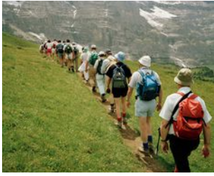
Martin Parr UK, b 1952 View detail Kleine Scheidegg. Switzerland, 1990 signed & dated on reverse archival pigment print 20 x 30 inches 50.8 x 76.2 cm Edition 7 of 25 (mp-90-6498)