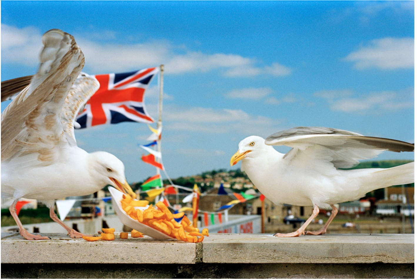
MARTIN PARR (UK, B1952) West Bay, England [seagulls], 1996