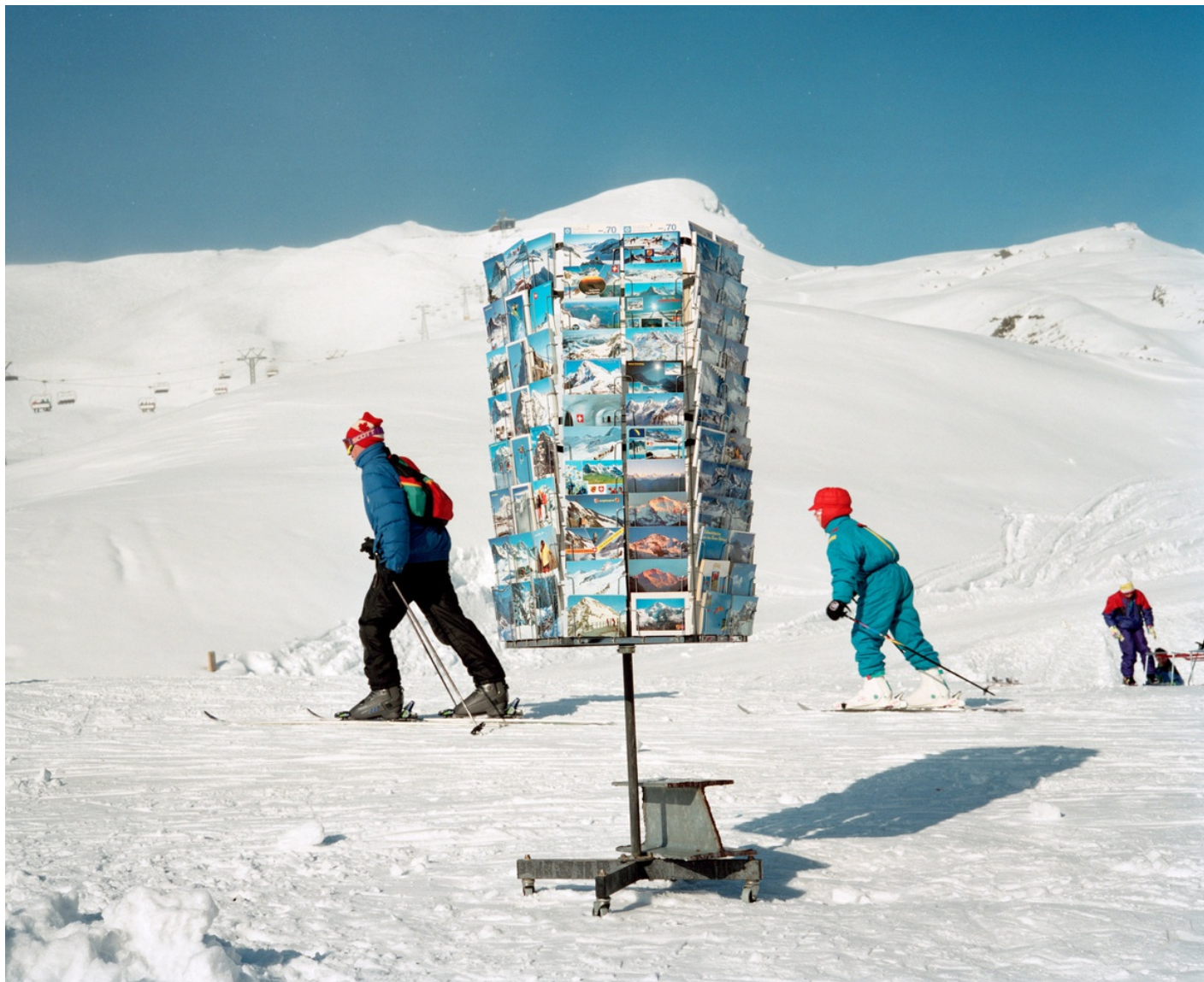
MARTIN PARR SWITZERLAND. Kleine Scheidegg , 1994

signed & dated on reverse Archival Pigment Print 20 x 24 inches Framed