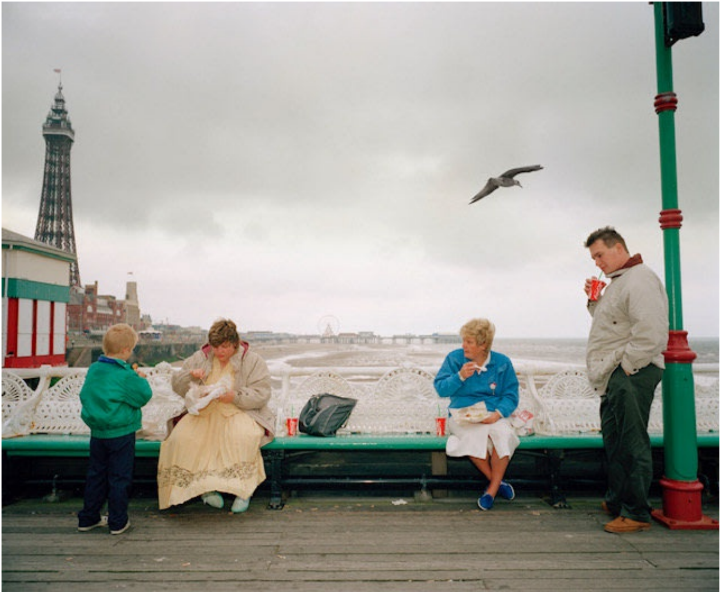
signed & dated on reverse archival pigment photograph 20 x 24 inches 50.8 x 61 cm Edition 4 of 25 (mp-94-6575)