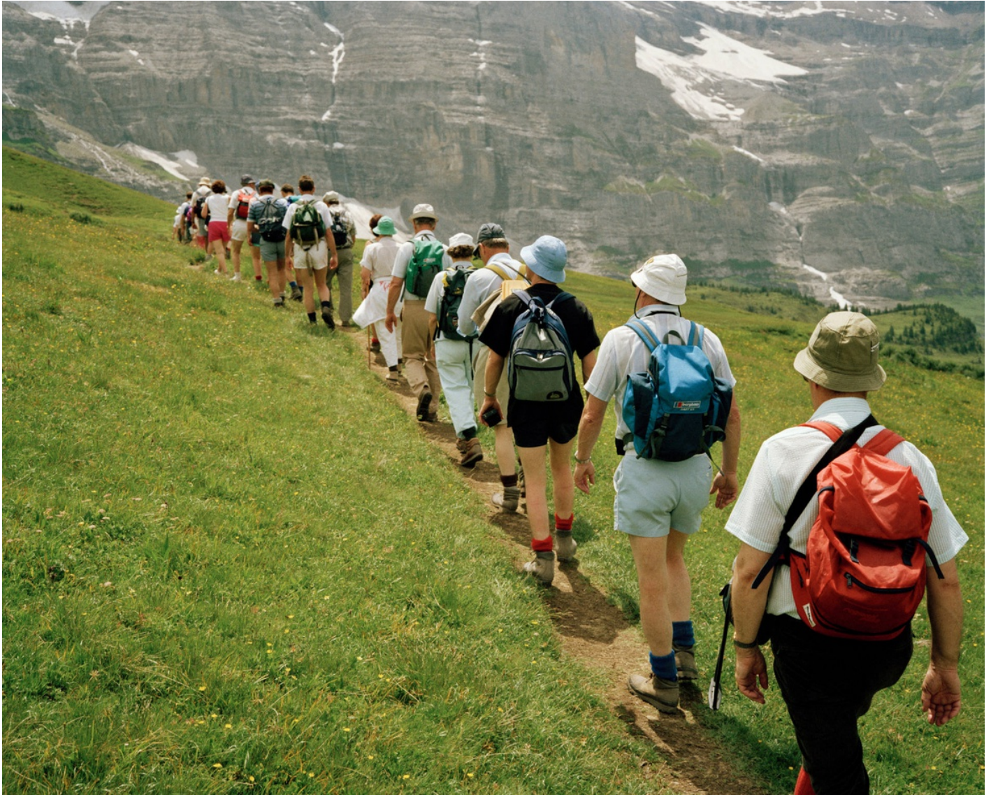
MARTIN PARR Kleine Scheidegg. Switzerland, 1990

signed & dated on reverse archival pigment print 20 x 30 inches 50.8 x 76.2 cm Edition 7 of 25 (mp-90-6498)