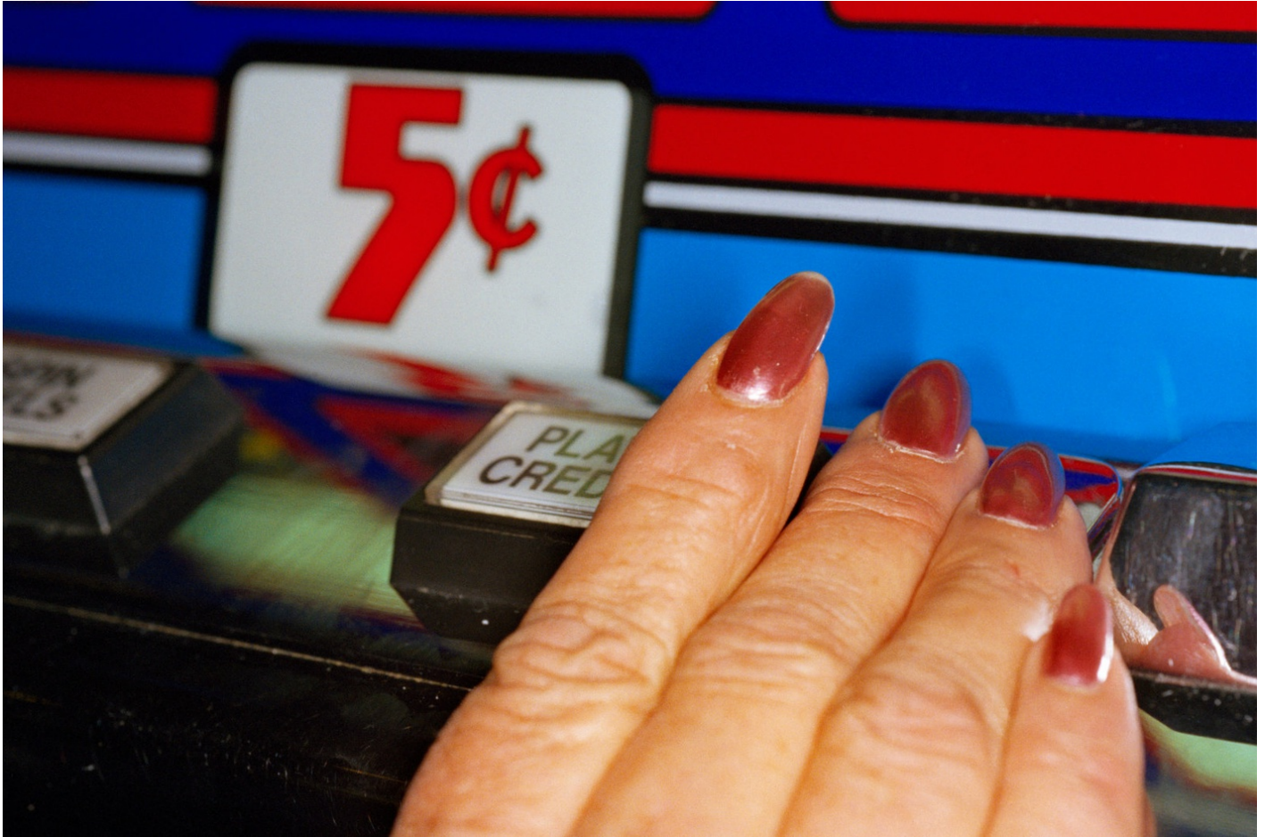
MARTIN PARR Las Vegas, USA, 1998

signed & dated on reverse 1995-99, c-type photograph 20 x 30 inches 50.8 x 76.2 cm 3/10 (mp-98-4922)