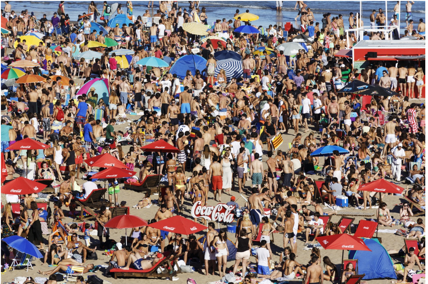
MARTIN PARR (UK, B1952) Argentina, Mar Del Plata, Grandé Beach, 2014

signed & dated on reverse archival pigment print 40 x 60 inches 101.6 x 152.4 cm Edition 3 of 5 (mp-14-5748)