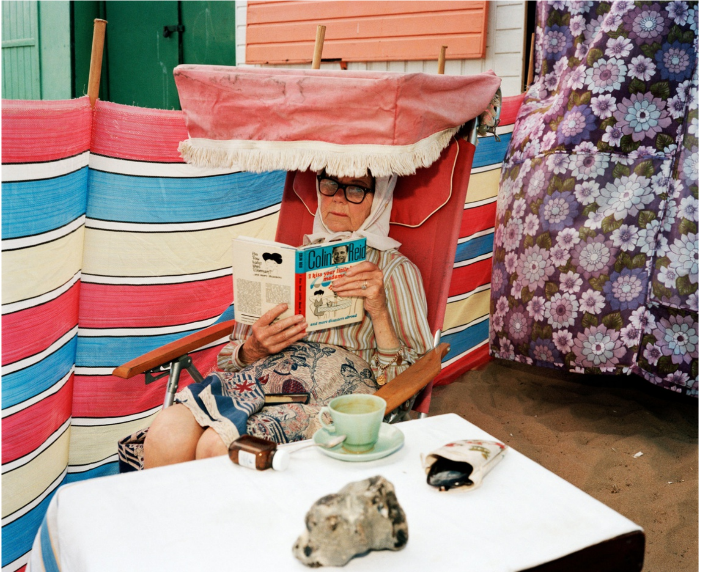
MARTIN PARR Margate, Kent, 1986