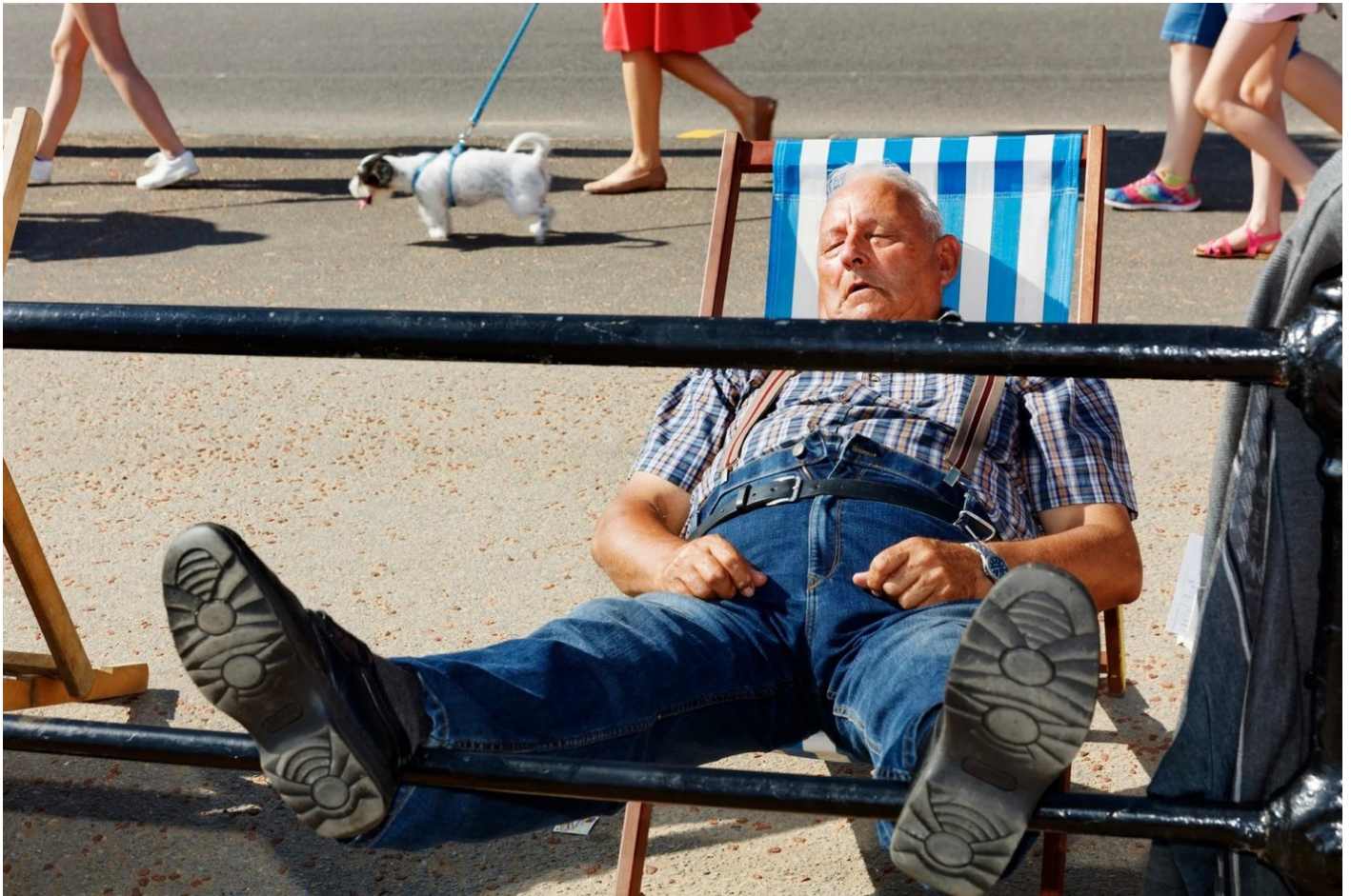
MARTIN PARR Scarborough, England, 2016

signed & dated on reverse archival pigment print 20 x 30 inches 50.8 x 76.2 cm Framed (74 x 98 cm) Edition 2 of 10 (mp-16-7293)