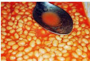
Martin Parr (UK, b1952) View detail British Food, 1995 signed & dated on reverse Archival Pigment Photograph 17.8 x 25.4 cm 7 x 10 in 16/33 (mp-95-7357)