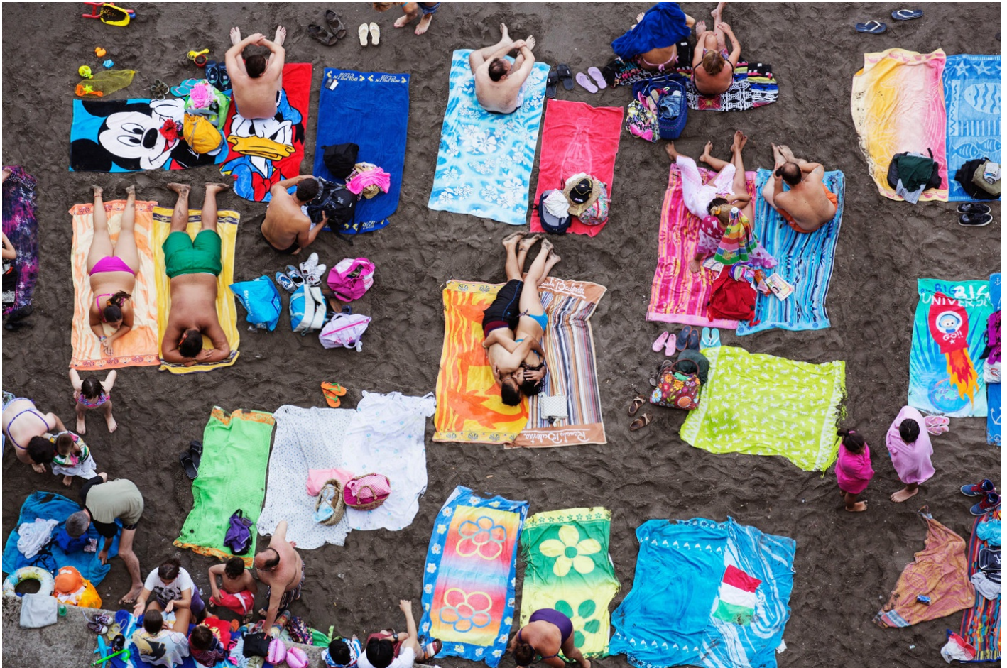
MARTIN PARR (UK, B1952) Sorrento [Beach Therapy], 2014

signed & dated on reverse archival pigment print 20 x 30 inches 50.8 x 76.2 cm Edition 9 of 10 (mp-14-7291)