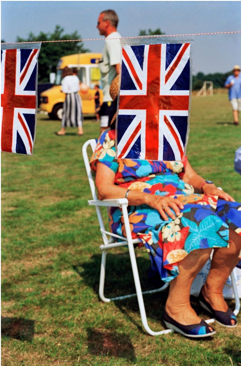
MARTIN PARR Sedlescombe, England, 1995

signed & dated on reverse archival pigment photograph