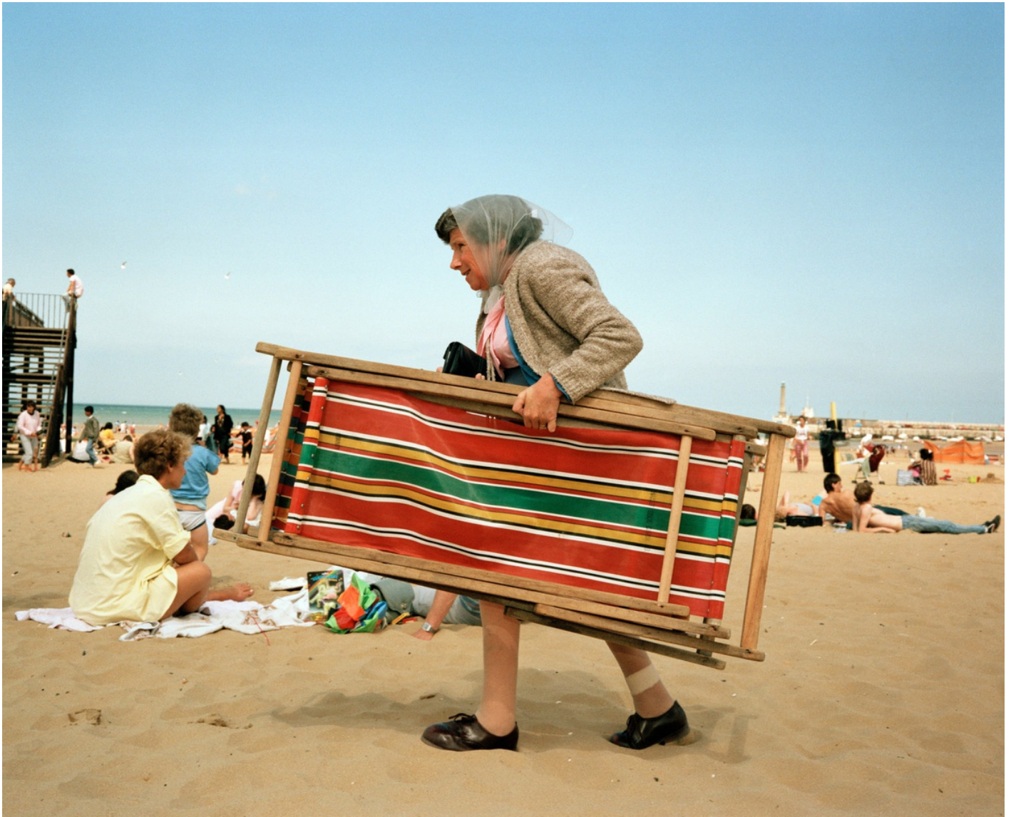
MARTIN PARR Margate, England, 1986