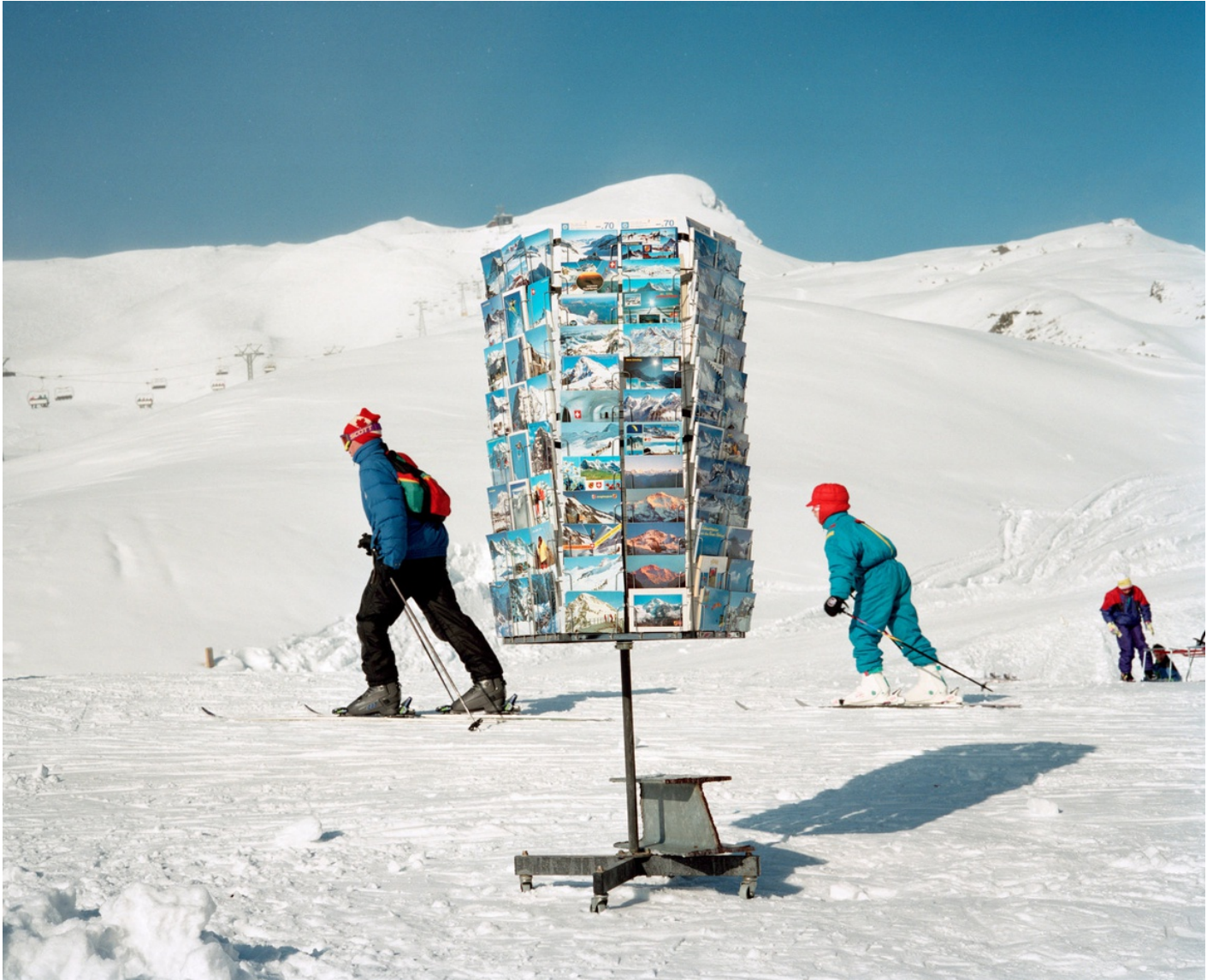
MARTIN PARR Kleine Scheidegg, Switzerland, 1994

Signed & Dated archival pigment print 40 x 50 inches 101.6 x 127 cm Framed (115 x 140 cm)