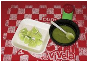
Martin Parr (UK, b1952) View detail Mexico 1, 2002 signed & dated on reverse 2002-4, Lambda c-type photograph (Fujicolor) 20 x 30 inches 508 x 762 mm number 9 of an edition of 10 (mp-02-4383)