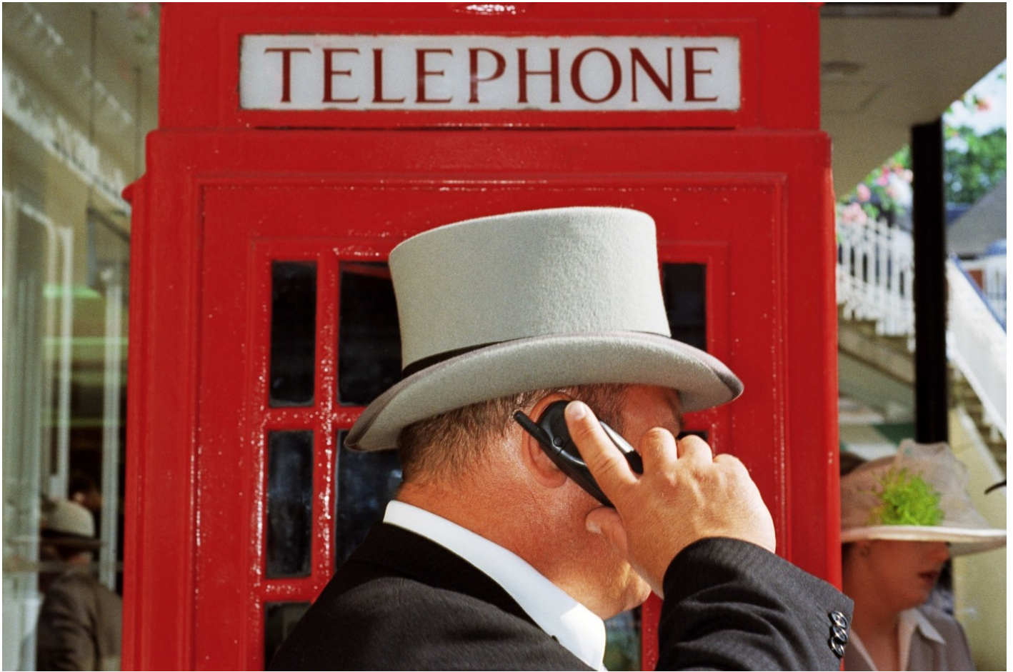
MARTIN PARR Ascot, England, 1999

signed & dated on certificate archival pigment photograph 40 x 60 inches 101.6 x 152.4 cm Framed (115 x 165.5 cm) Edition 4 of 5 (mp-99-7289)