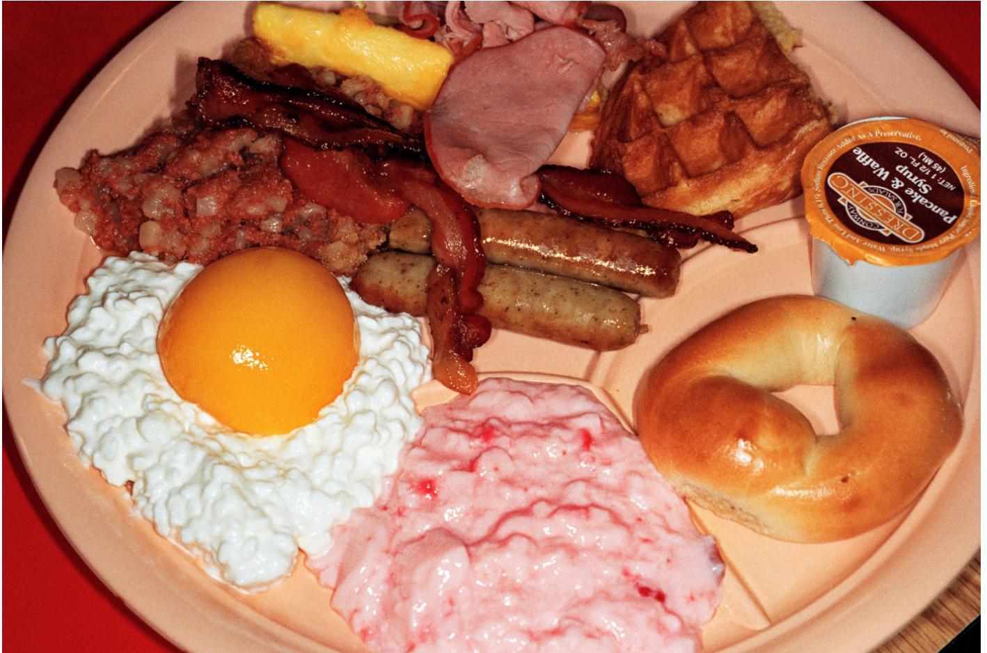
MARTIN PARR Las Vegas, Breakfast, 1996

signed & dated on reverse archival pigment photograph