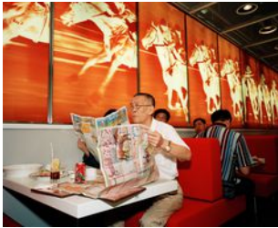
Martin Parr UK, b 1952 View detail HONG KONG. Horse Racing. Sha Tin. A punter studying the form guide in a race course restaurant, 2001 signed & dated on reverse archival pigment print 20 x 30 inches 50.8 x 76.2 cm