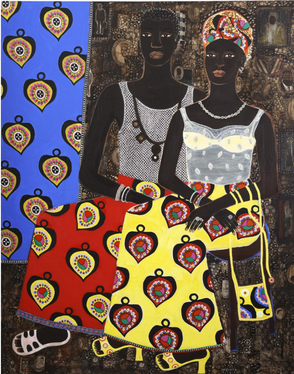
CARLA KRANENDONK Couple in balance , 2012

hand embroidery, beadwork, acrylic and collage on canvas