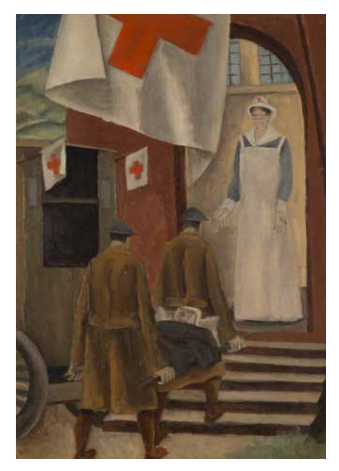
Red Cross Nurse, 1919, oil on canvas, 301/4 x 22 inches