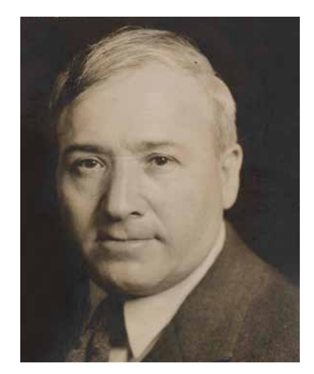
Max Weber, 1936. Max Weber papers, 1902–2008. Archives of American Art Smithsonian Institution