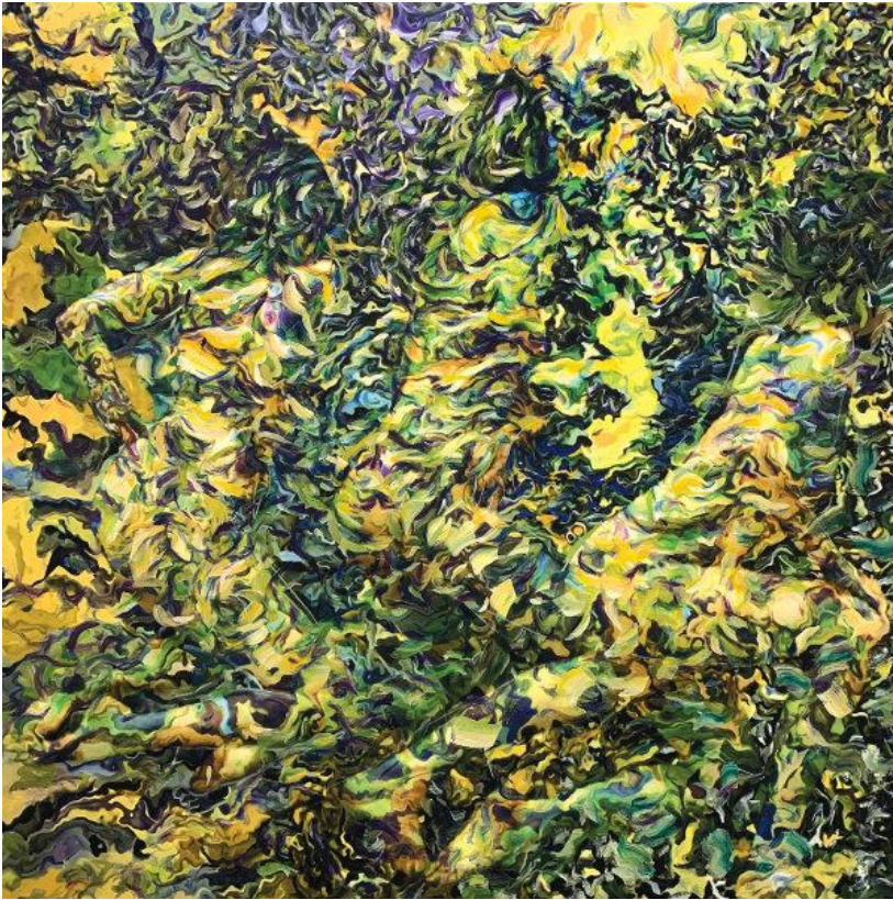
Camouflage , 2020, pigment, oil on canvas, 50 x 50 inches

With its penetrating honesty, Kremer’s art challenges us to undergo a process of self-discovery.