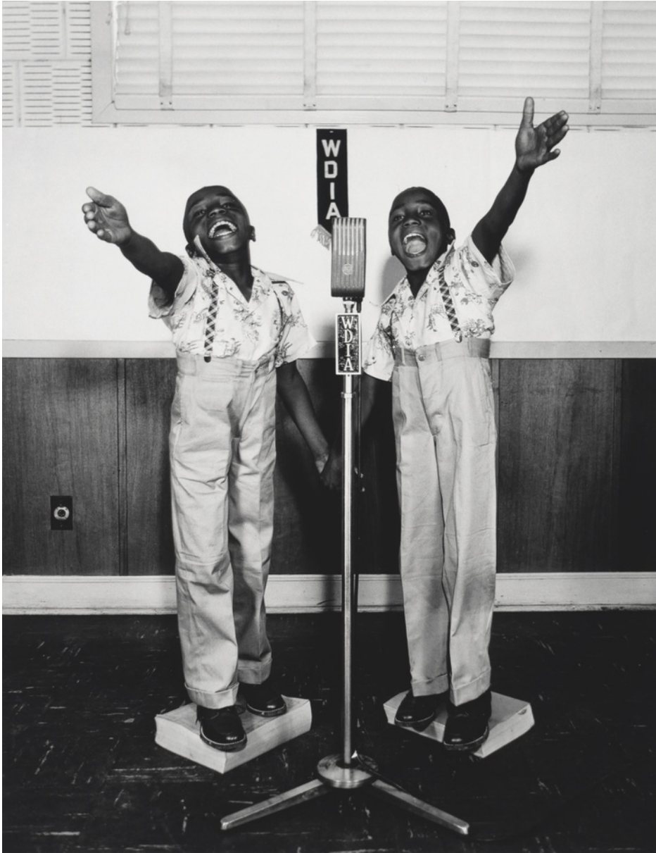
Signed by the artist in pencil on the verso. Annotations in pencil on the verso. Silver gelatin print, printed later Paper size: 35.3 x 27.9 cm Image size: 32.8 x 25.4 cm (001-ECW)