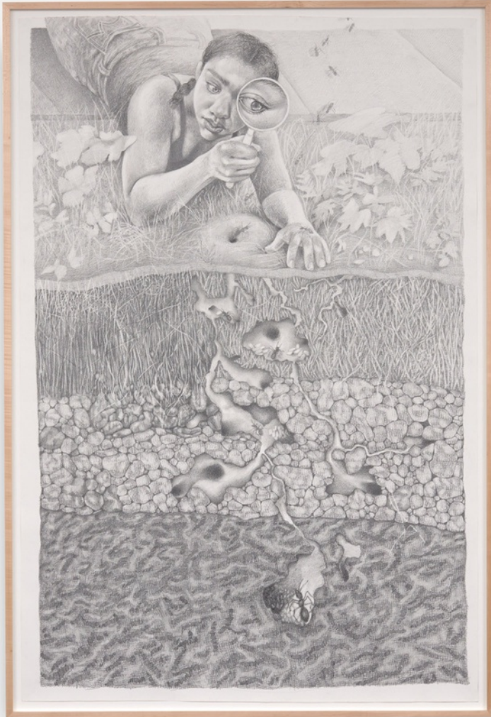
Graphite on paper 191.6 x 130.7 x 4 cm (framed) 75 3/8 x 51 1/2 x 1 5/8 in (LEFE1120)