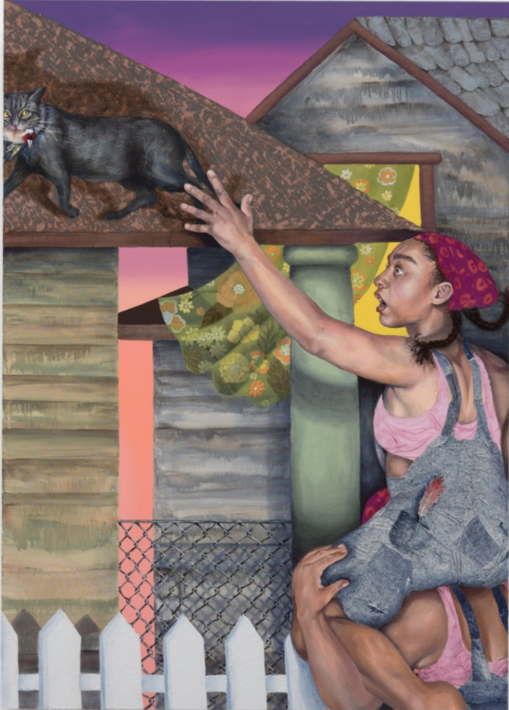
Acrylic, moulding paste, matte medium, puff paint, found cloth, papier mâché and yarn on canvas 152.4 x 213.4 x 5.1 cm 60 x 84 x 2 in (LEFE1116)