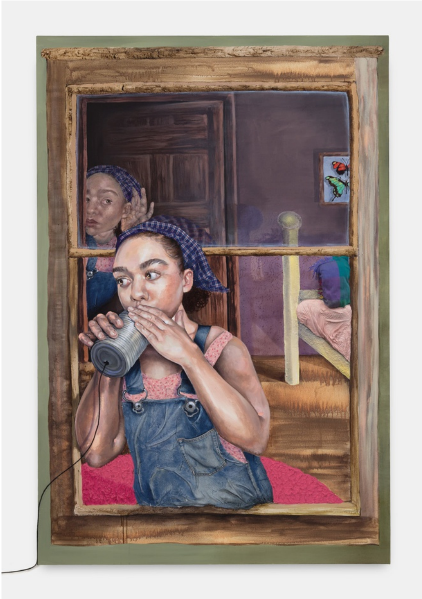
LEYLA FAYE Outside My Window , 2023

Acrylic, moulding paste, matte medium, found cloth, papier mâché, foam, and yarn on canvas