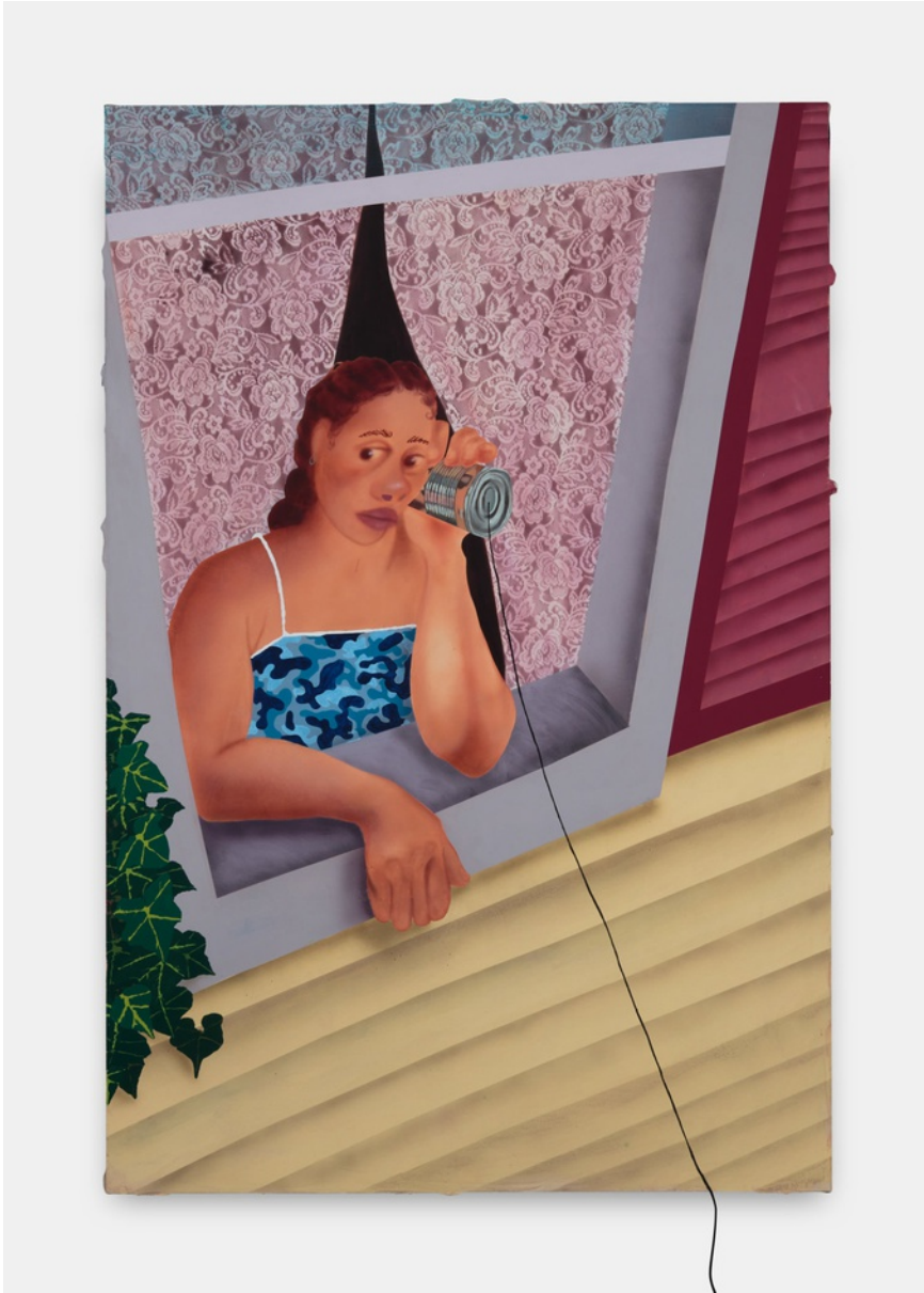
BRIANNA ROSE BROOKS Outside My Window , 2023

Acrylic, oil, airbrush and moulding paste on canvas