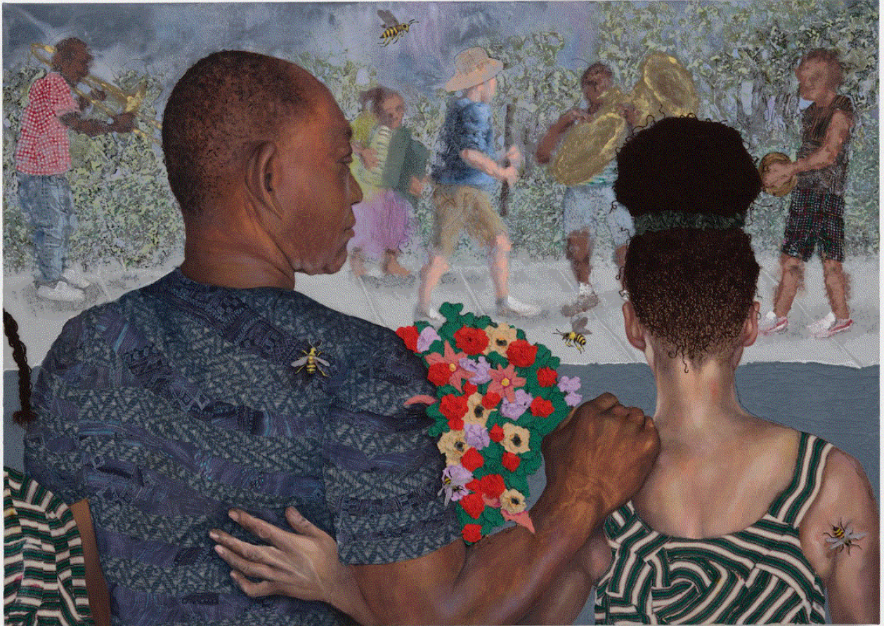
Acrylic, moulding paste, matte medium, tar gel medium, found cloth, papier mâché and yarn on canvas 152.4 x 213.4 x 10.2 cm 60 x 84 x 4 in (LEFE1117)