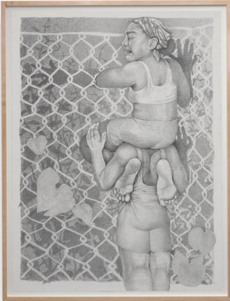
Graphite on paper 130.7 x 100.2 x 4 cm (framed) 51 1/2 x 39 1/2 x 1 5/8 in (LEFE1121)