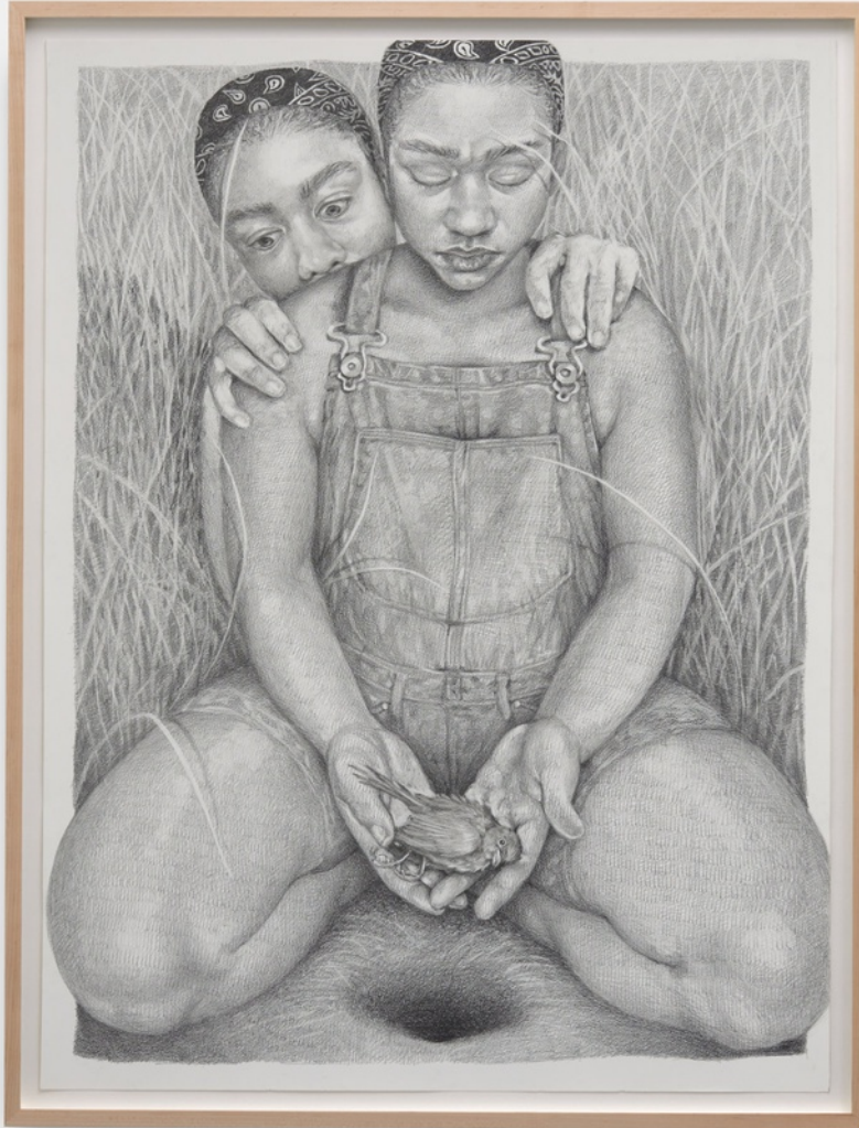
Graphite on paper 130.7 x 100.2 x 4 cm (framed) 51 1/2 x 39 1/2 x 1 5/8 in (LEFE1118)