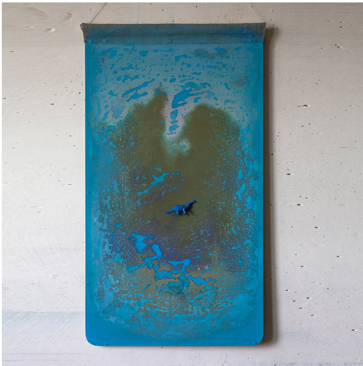
Lacquer, oil, acrylic on wood 75 x 45 cm (AKMV-00007)