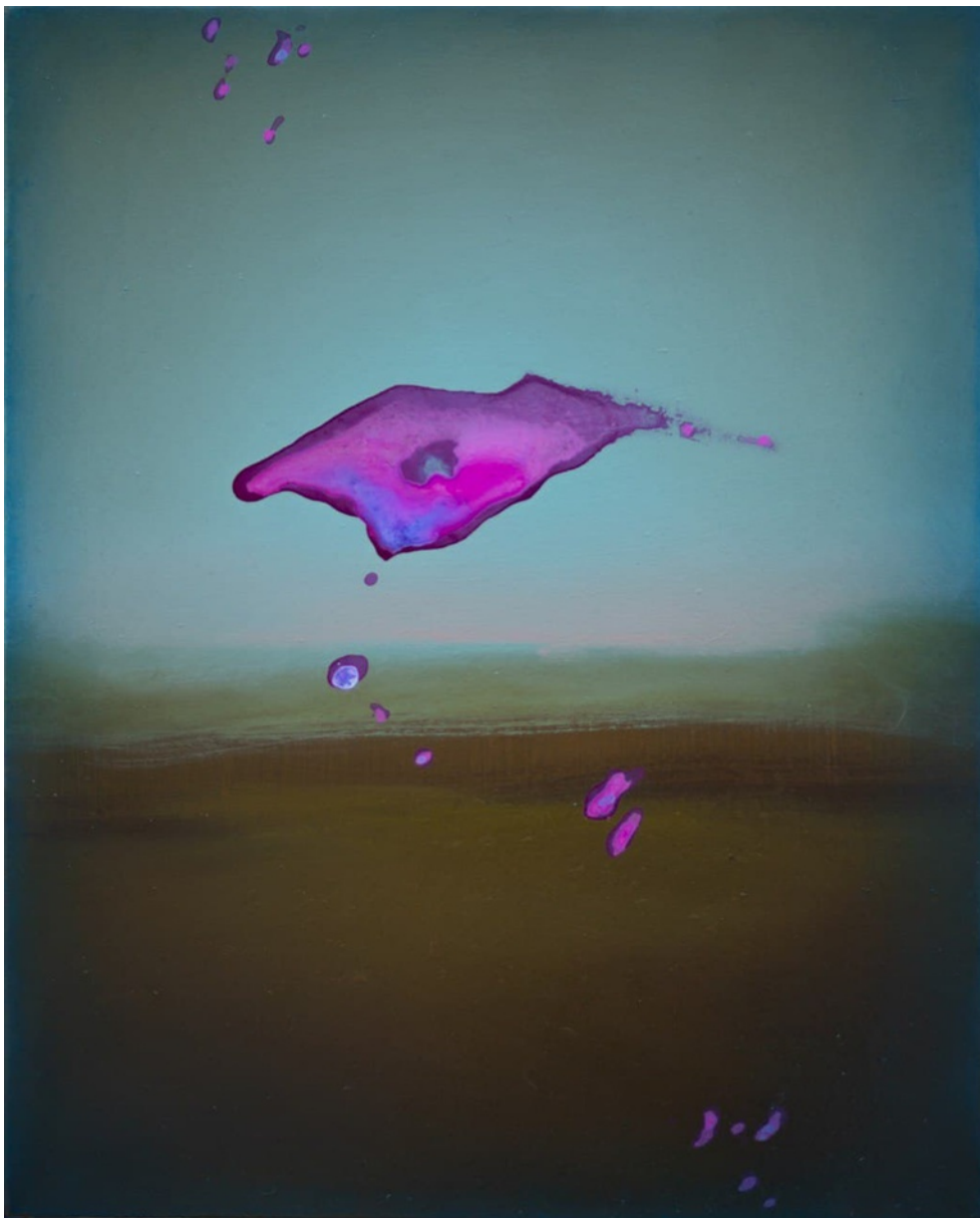
Oil, lacquer, acrylic on primed paper on wood 55 x 45 cm (AKMV-00005)