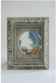
Fedora Akimova Tatyana 10 , 2019 embroidery, textile, wood, plastic 20 x 16 x 5cm (AKMV-00018)