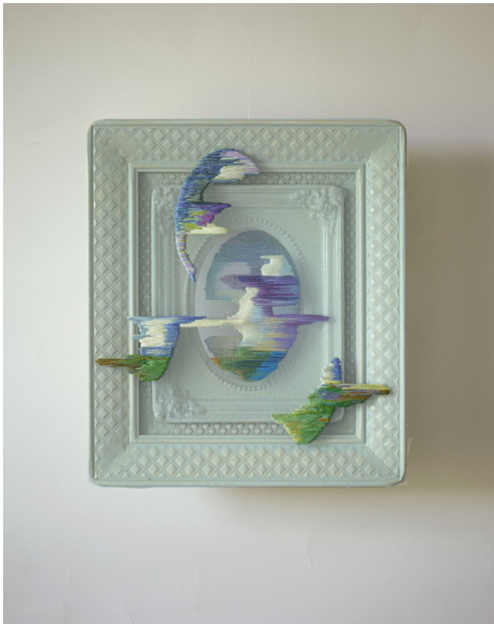
Handmade embroidery, textile, wood, plastic 30 x 25 x 5 cm (AKMV-00019)