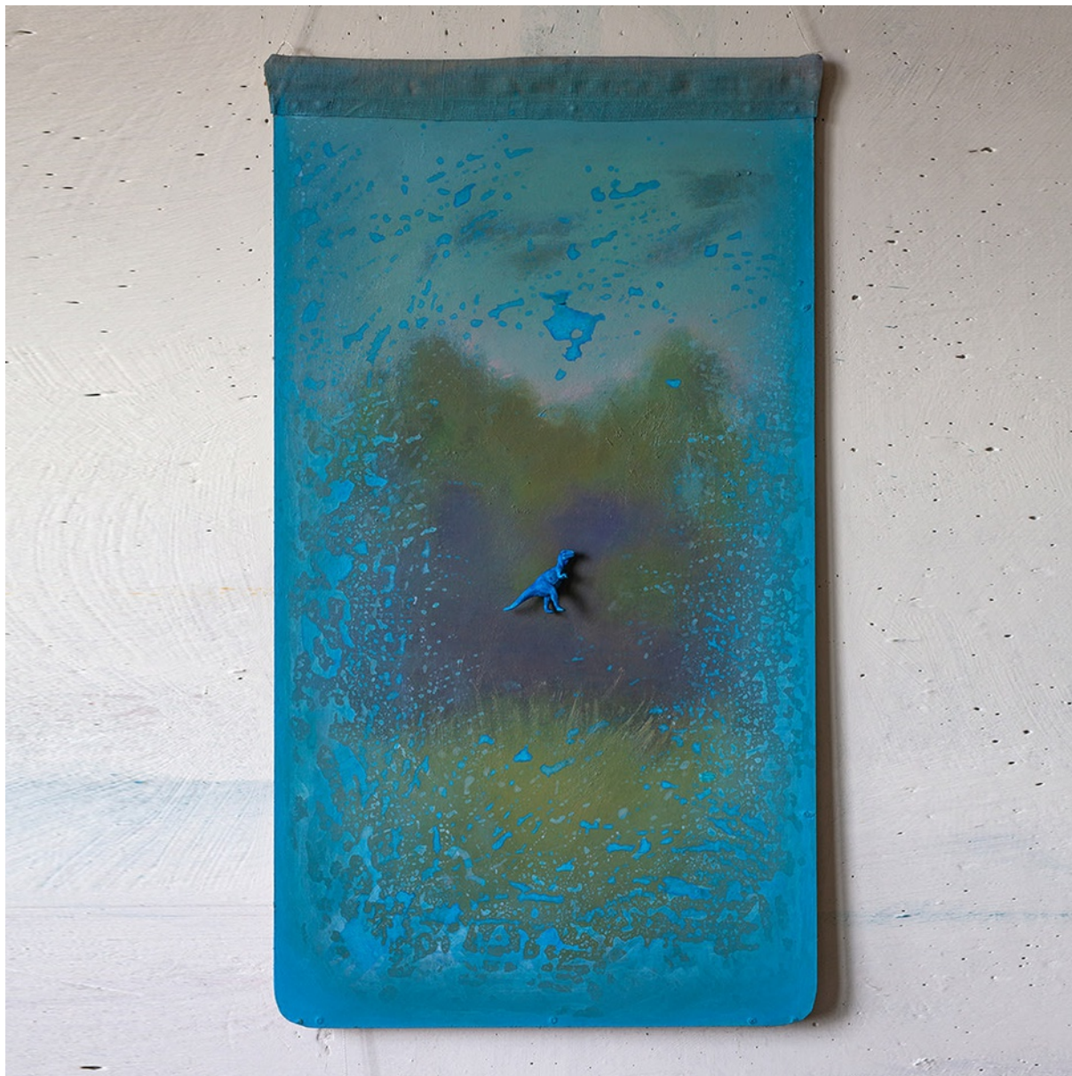
Lacquer, oil, acrylic on wood 75 x 45 cm (AKMV-00008)