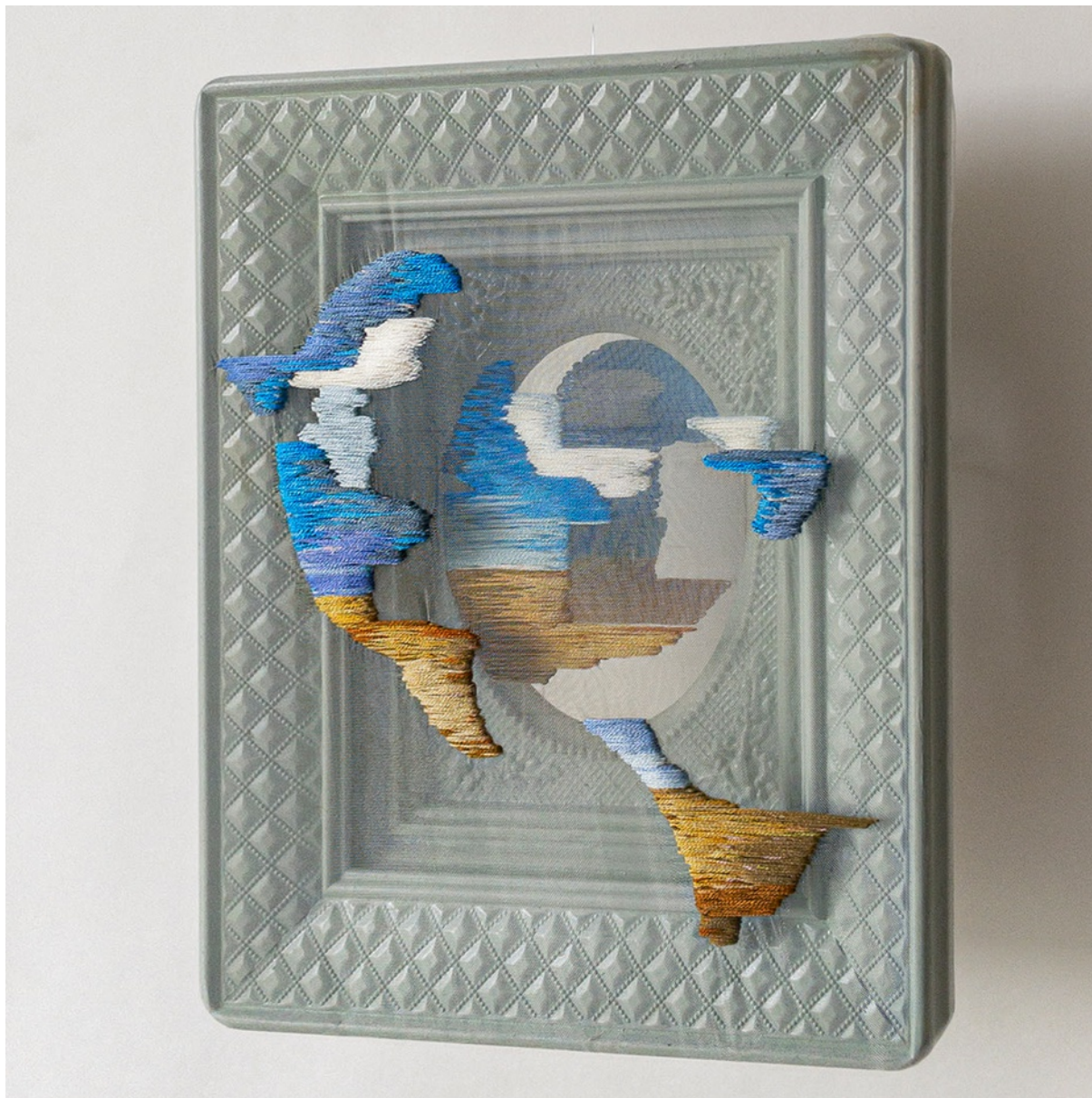
Textile, embroidery, plastic 27 x 22 x 5 cm (AKMV-00001)