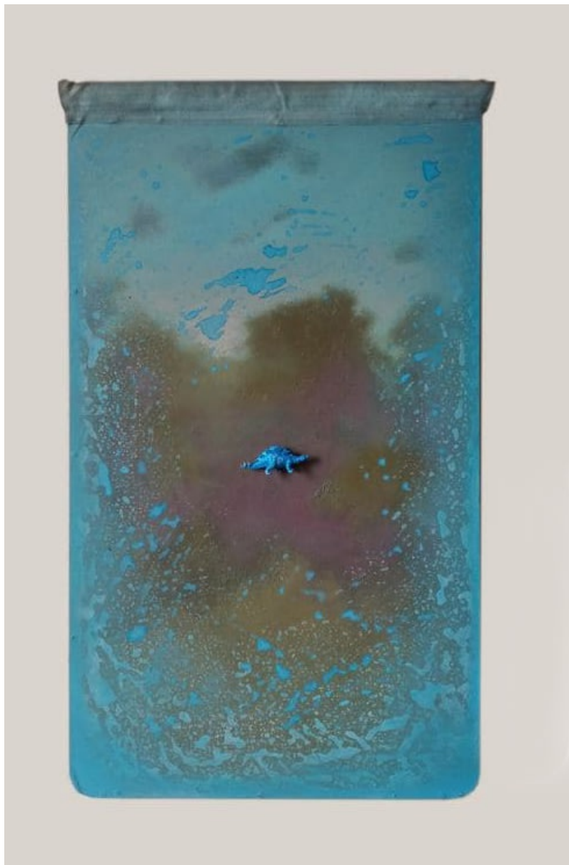
Lacquer, oil, acrylic on wood 75 x 45 cm (AKMV-00006)