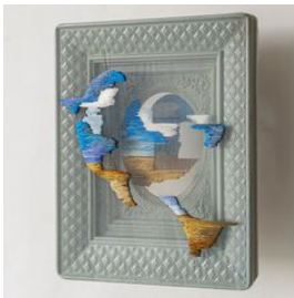
Fedora Akimova Tatyana 16 , 2021 Textile, embroidery, plastic 27 x 22 x 5 cm (AKMV-00001)