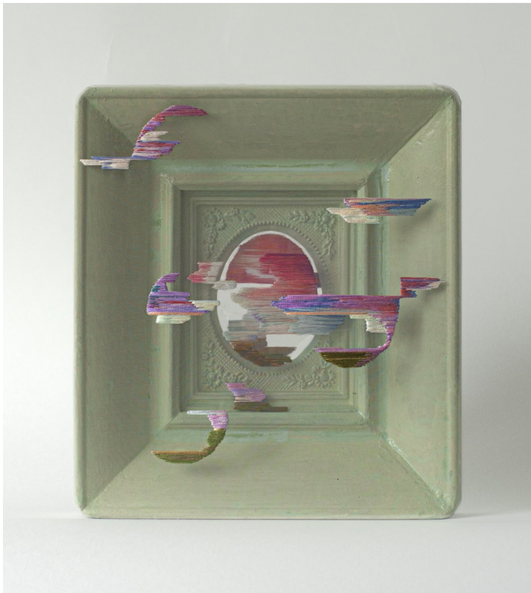
Embroidery, textile, wood, plastic 32 x 25 x cm (AKMV-00022)