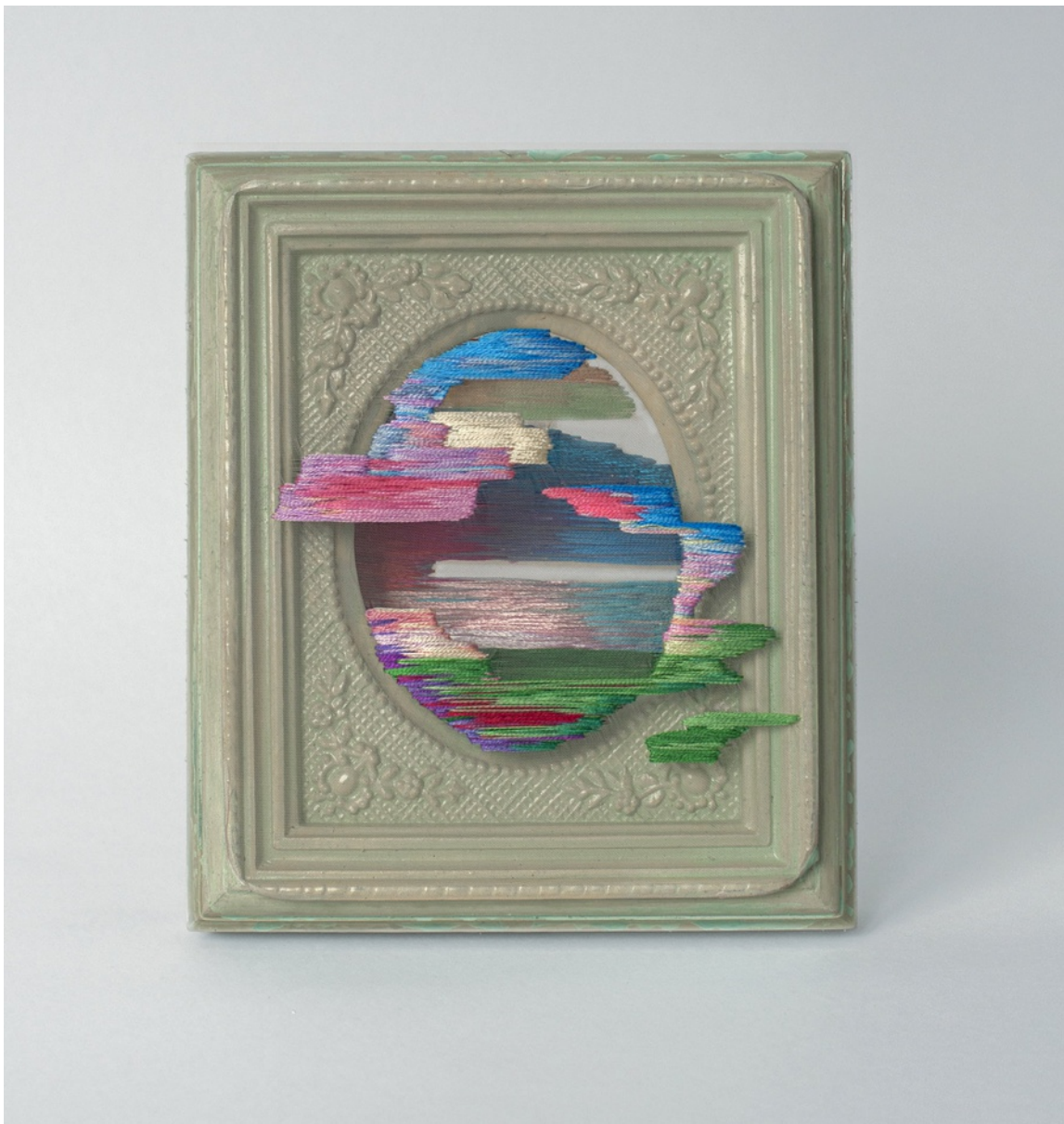
Embroidery, textile, wood, plastic 22 x 18 x 4 cm (AKMV-00020)