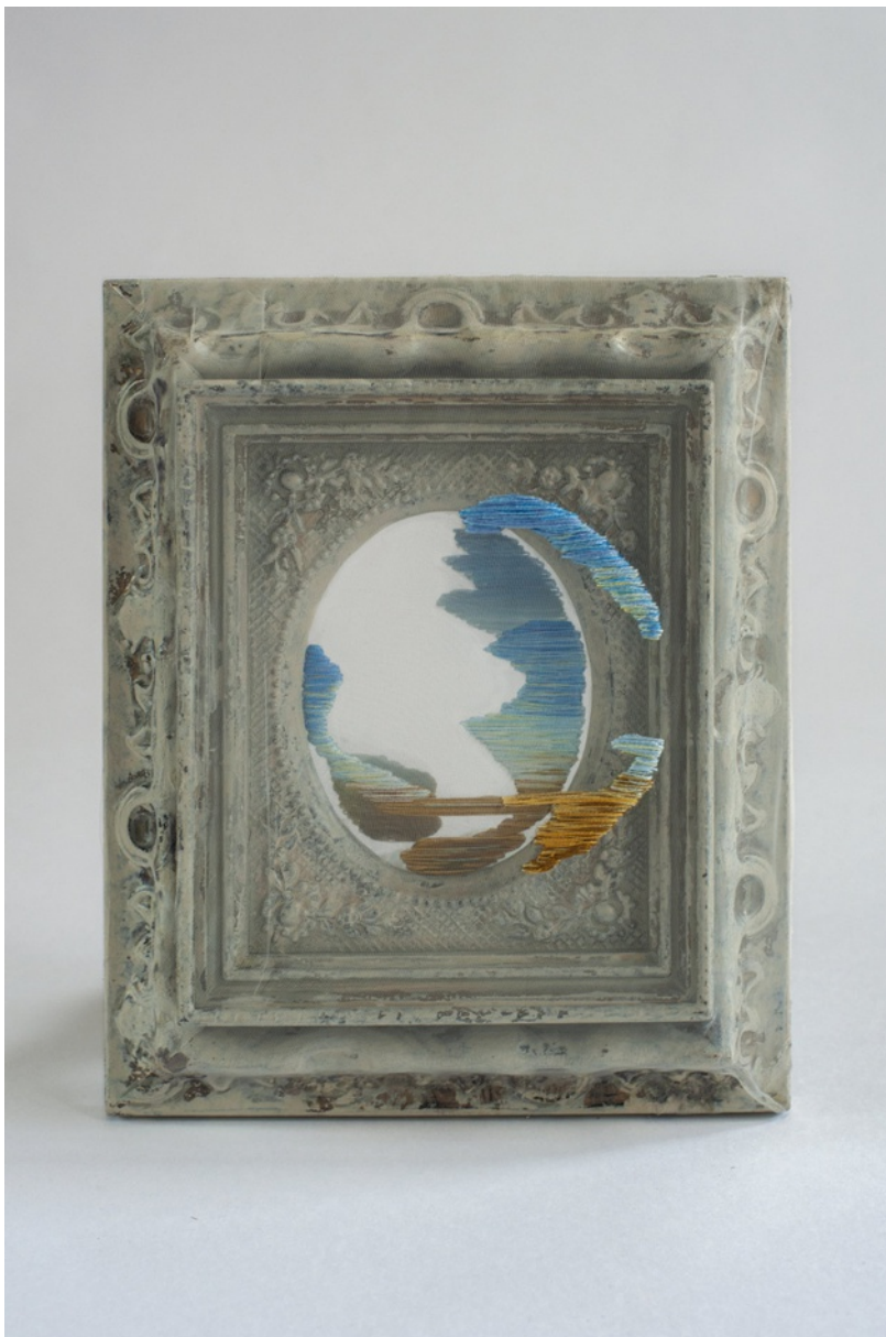
embroidery, textile, wood, plastic 20 x 16 x 5cm (AKMV-00018)