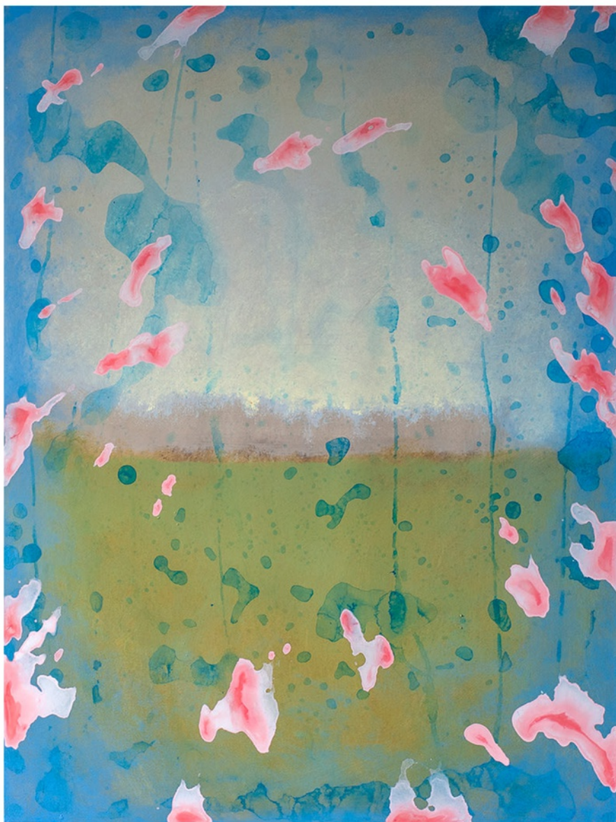
Oil, lacquer, acrylic on primed paper on wood 70 x 50 cm (AKMV-00004)