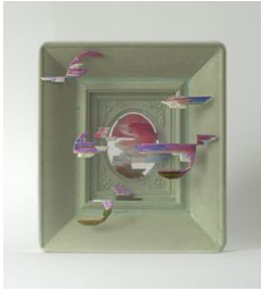
Fedora Akimova Tatyana 20 , 2021 Embroidery, textile, wood, plastic 32 x 25 x cm (AKMV-00022)