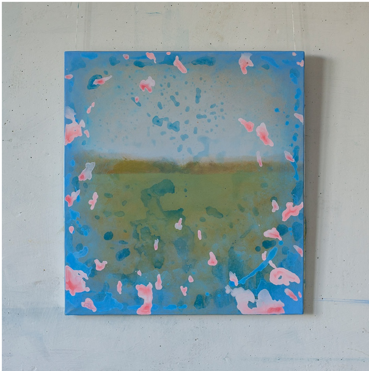
Oil, lacquer, acrylic on primed paper on wood 60 x 70 cm (AKMV-00003)