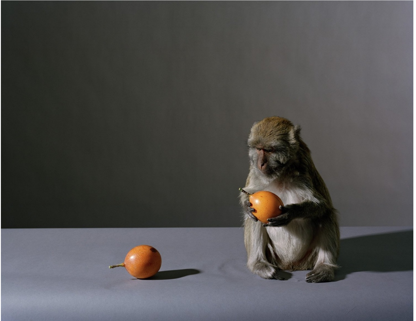
c-type print 95 x 120 cm 37 3/8 x 47 1/4 in Edition 1/5, +1 AP (IBID-RICHO-00101)