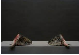
Olivier Richon Melencolia, with Fish , 2012 c-type print 65 x 85 cm 25 5/8 x 33 1/2 in Edition 2/3 + 1 AP (IBID-RICHO-00157)