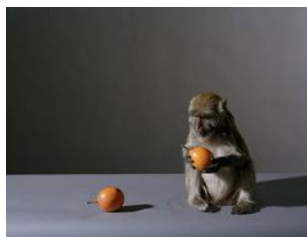
Olivier Richon Portrait of a Monkey with Fruit , 2008 c-type print 95 x 120 cm 37 3/8 x 47 1/4 in Edition 1/5, +1 AP (IBID-RICHO-00101)