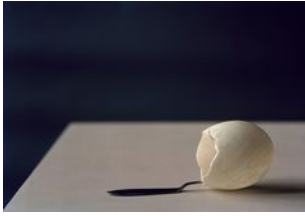
Olivier Richon Acedia , 2012 c-type print 49 x 59 cm 19 1/4 x 23 1/4 in Edition 1/3 +1 AP (IBID-RICHO-00137)