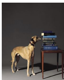
Olivier Richon Financial Still Life (with Dog) , 2003 c-type print 105 x 130 cm 41 3/8 x 51 1/8 in AP 1/2 (IBID-RICHO-00013)

For full details and larger images, please see the end of this document.