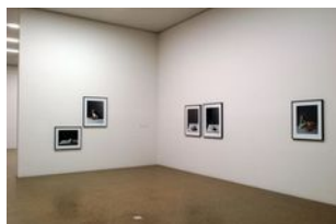
Olivier Richon Installation View, Teaching Photography , 2010 (IBID-RICHO-00169)