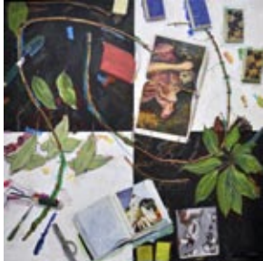
Manny Farber Spy Glass, 2000 Oil on board 60 x 60 inches