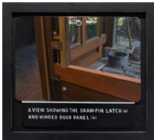
Tony May A View Showing the Draw-Pin Latch (a) and Hinged Door Panel (b), 2018 Acrylic on panel in artist-made frame 7 7/8 x 9 inches irr.; 10 x 11 inches framed