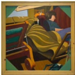
Jack Beal Still-Life with Girl, 1966 Oil on canvas 49 x 49 1/4 inches