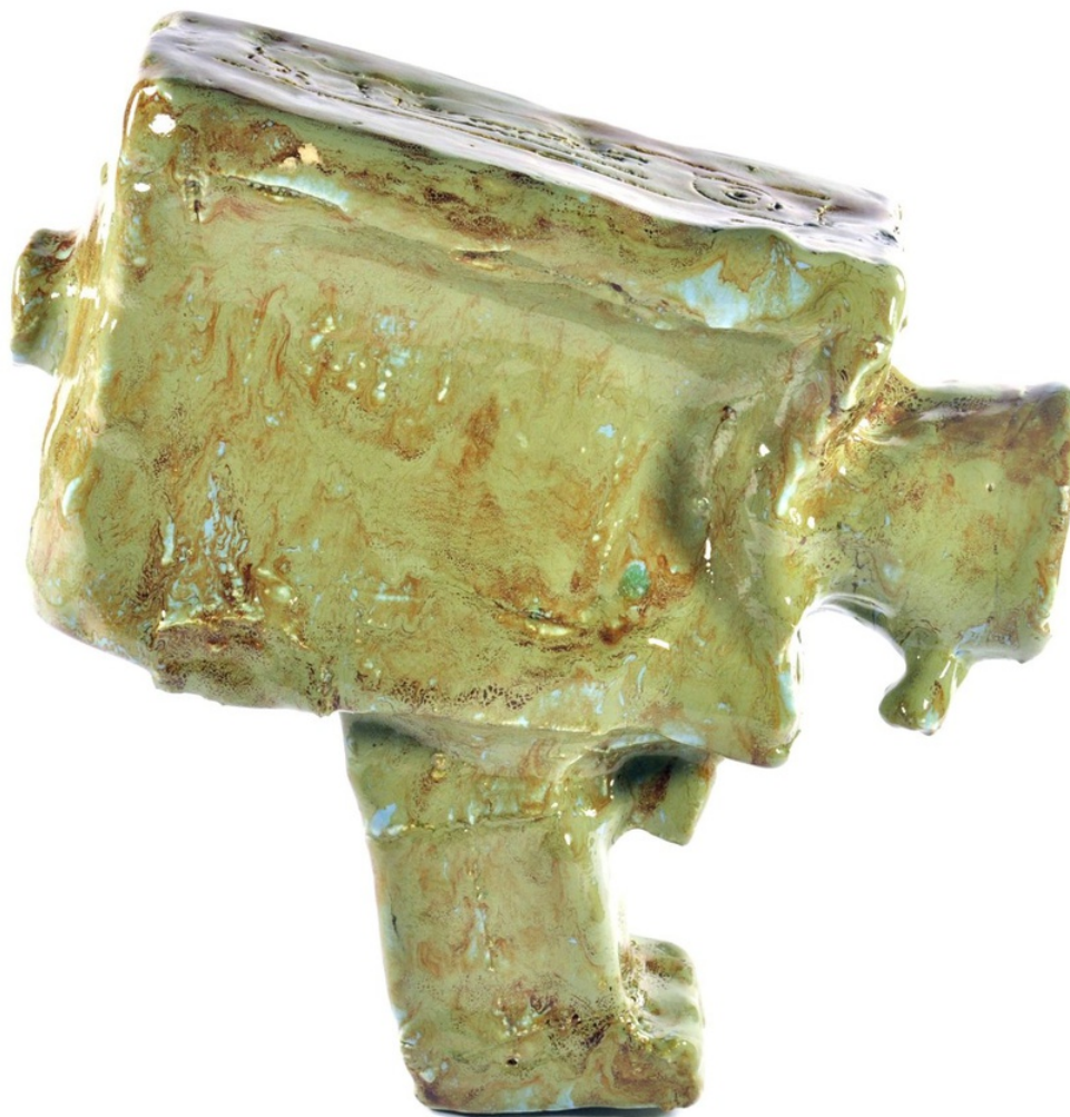
ALAN CONSTABLE Untitled (Movie Camera) , 2016

clay, glaze, paint 24 x 25 x 9 cm 9 1/2 x 9 7/8 x 3 1/2 in (CONST-046)