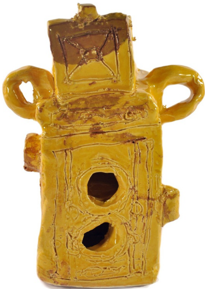
ALAN CONSTABLE Untitled (Rolleiflex) , 2015

clay, glaze 8 x 14 x 8 cm 3 1/4 x 5 1/2 x 3 1/4 in (CONST-067)