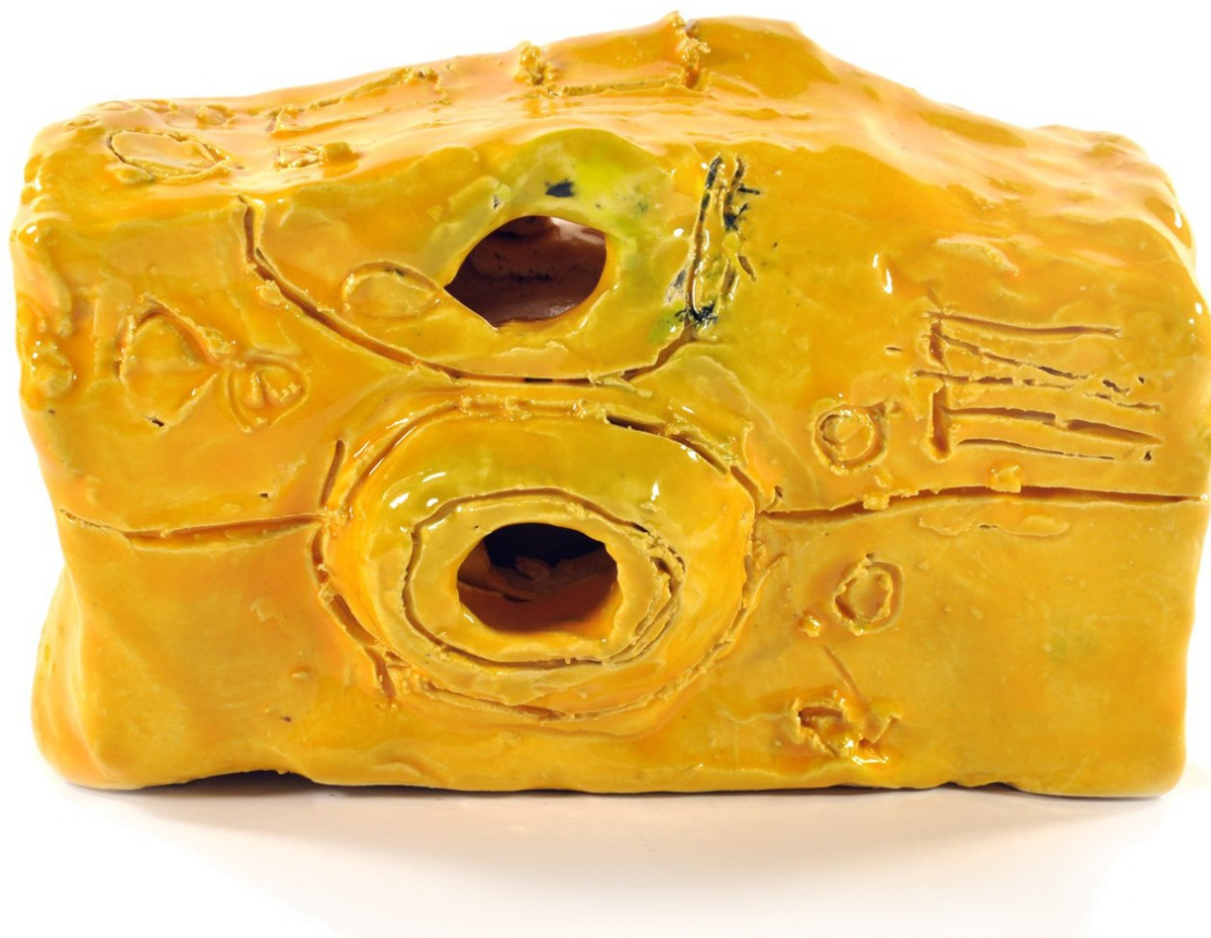
ALAN CONSTABLE Untitled (Instamatic) , 2015

clay, varnish, paint 11 x 17 x 8 cm 4 1/4 x 6 3/4 x 3 1/4 in (CONST-068)