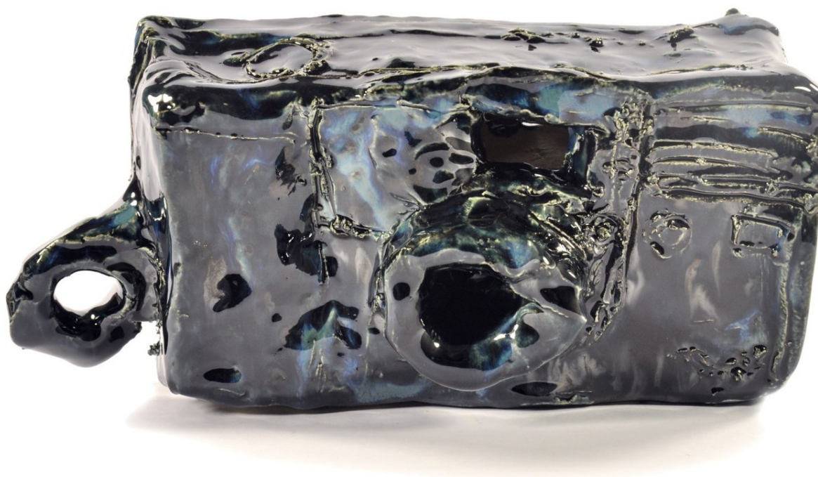
ALAN CONSTABLE Untitled (Instamatic)

clay, varnish, paint 9 x 20 x 10 cm 3 1/2 x 7 7/8 x 4 in (CONST-071)