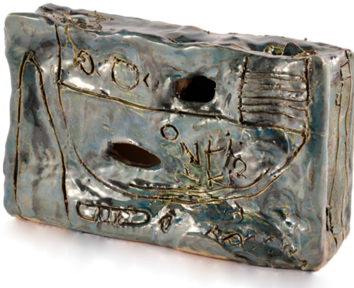
ALAN CONSTABLE Untitled (Nikon RF) , 2010

clay, glaze 13 x 22 x 8 cm 5 1/8 x 8 5/8 x 3 1/8 in (CONST-072)