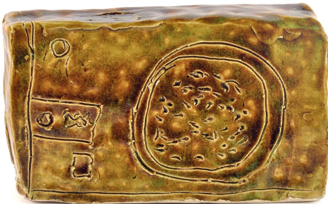
ALAN CONSTABLE Untitled (Leica M) , 2016

clay, glaze 5 x 10 x 3.6 cm 2 x 4 x 1 3/8 in (CONST-045)