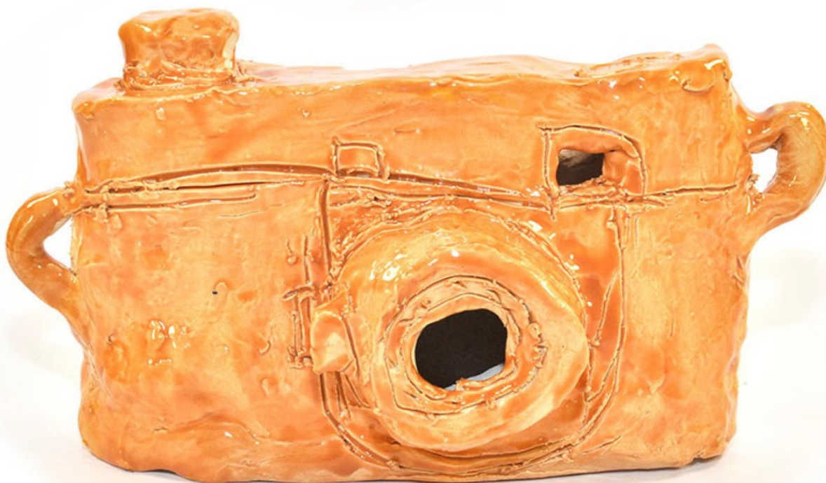
ALAN CONSTABLE Untitled (SLR) , 2014

clay, varnish, paint 13 x 23 x 10 cm 5 1/8 x 9 1/8 x 4 in (CONST-063)