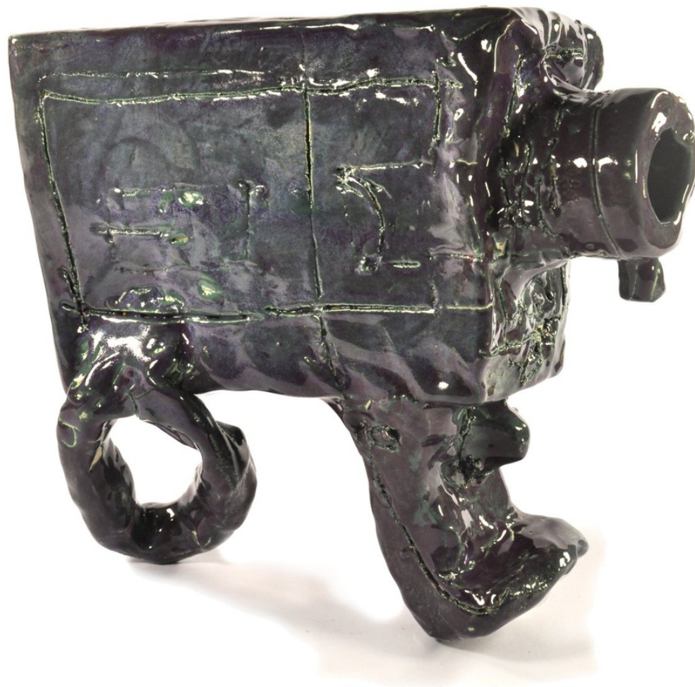
ALAN CONSTABLE Untitled (Movie Camera) , 2015

clay, glaze 22 x 25 x 9 cm 8 5/8 x 9 7/8 x 3 1/2 in (CONST-065)