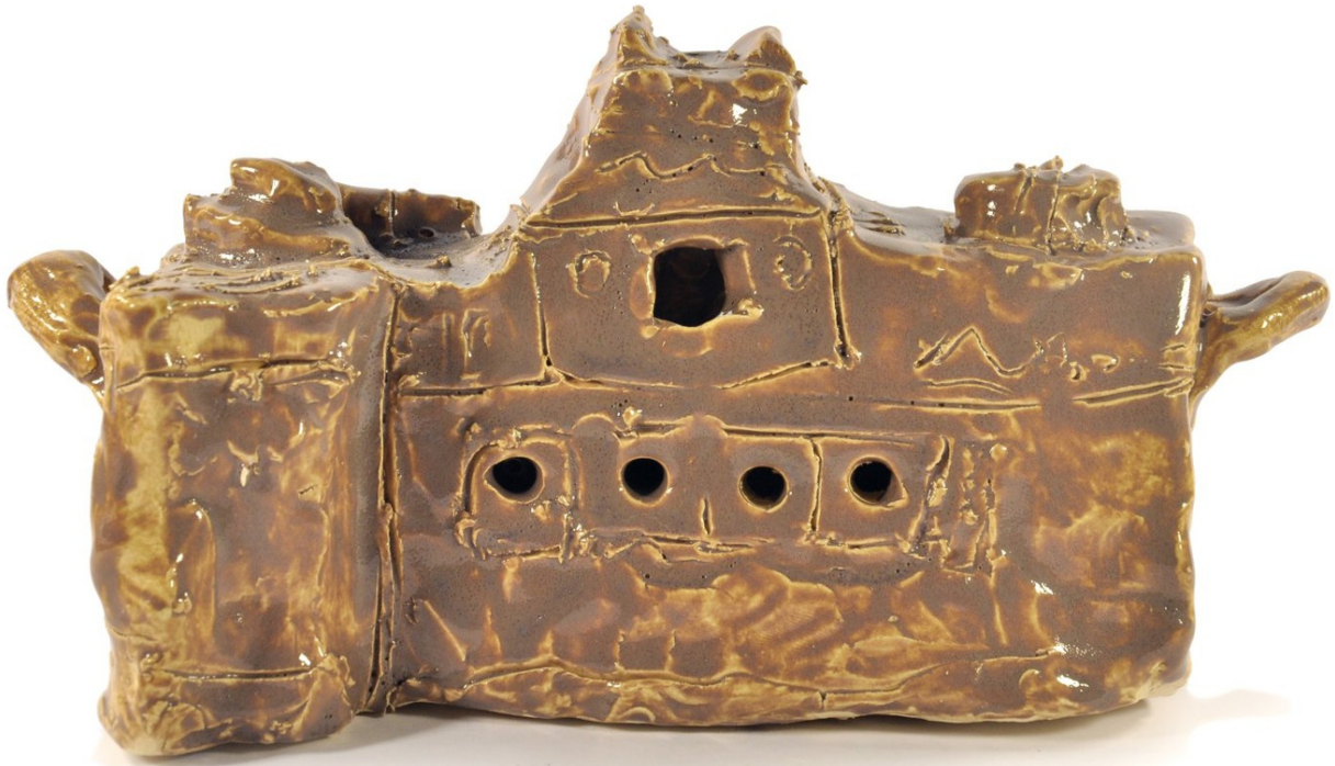
ALAN CONSTABLE Untitled (Multi-Lens Passport Camera) , 2015

clay, glaze 12 x 25 x 9 cm 4 3/4 x 9 7/8 x 3 1/2 in (CONST-062)