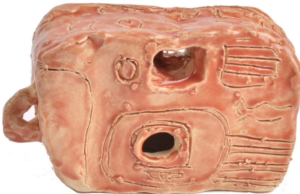
ALAN CONSTABLE Untitled (Instamatic) , 2016

clay, glaze 9 x 15.5 x 5 cm 3 1/2 x 6 1/8 x 2 in (CONST-041)