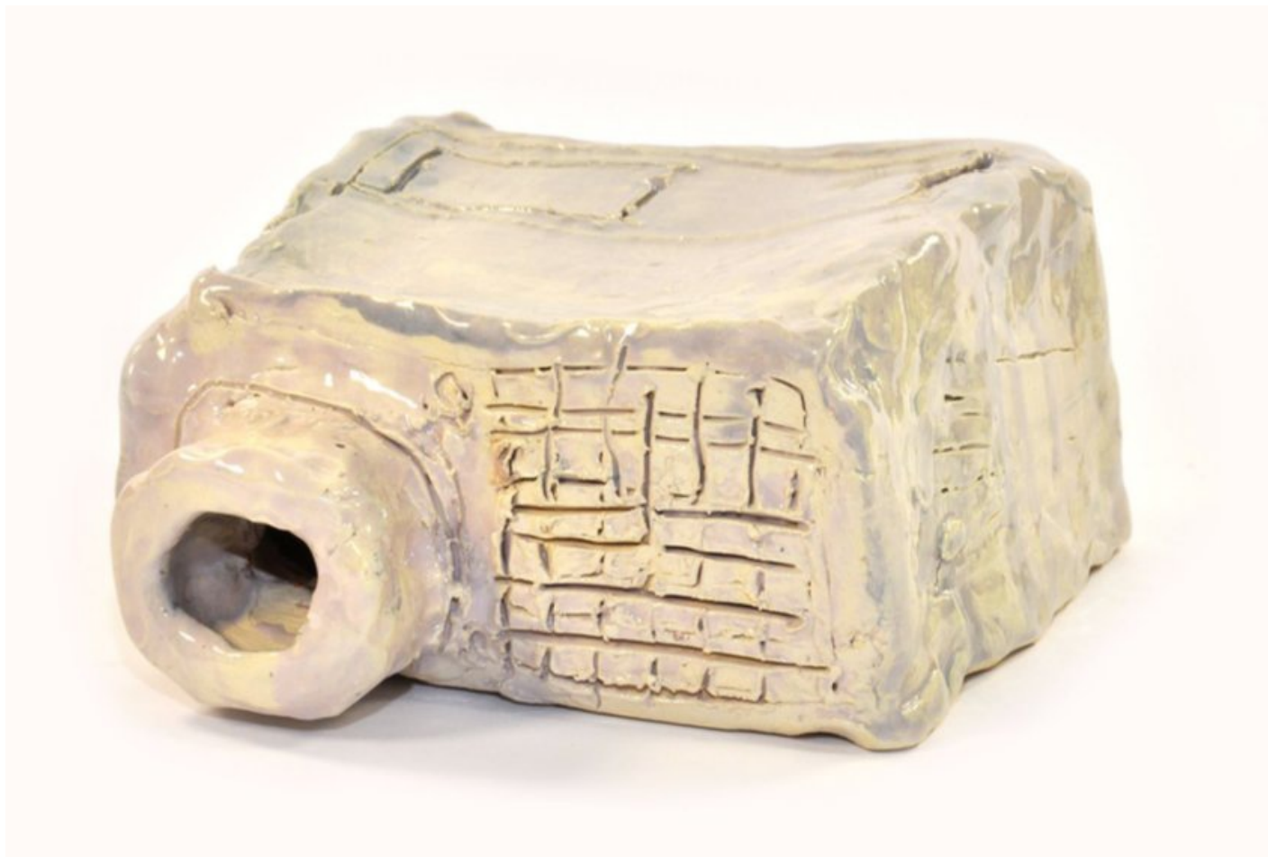
ALAN CONSTABLE Untitled (Movie Projector) , 2016

clay, glaze 8 x 14 x 15.5 cm 3 1/8 x 5 1/2 x 6 1/8 in (CONST-057)