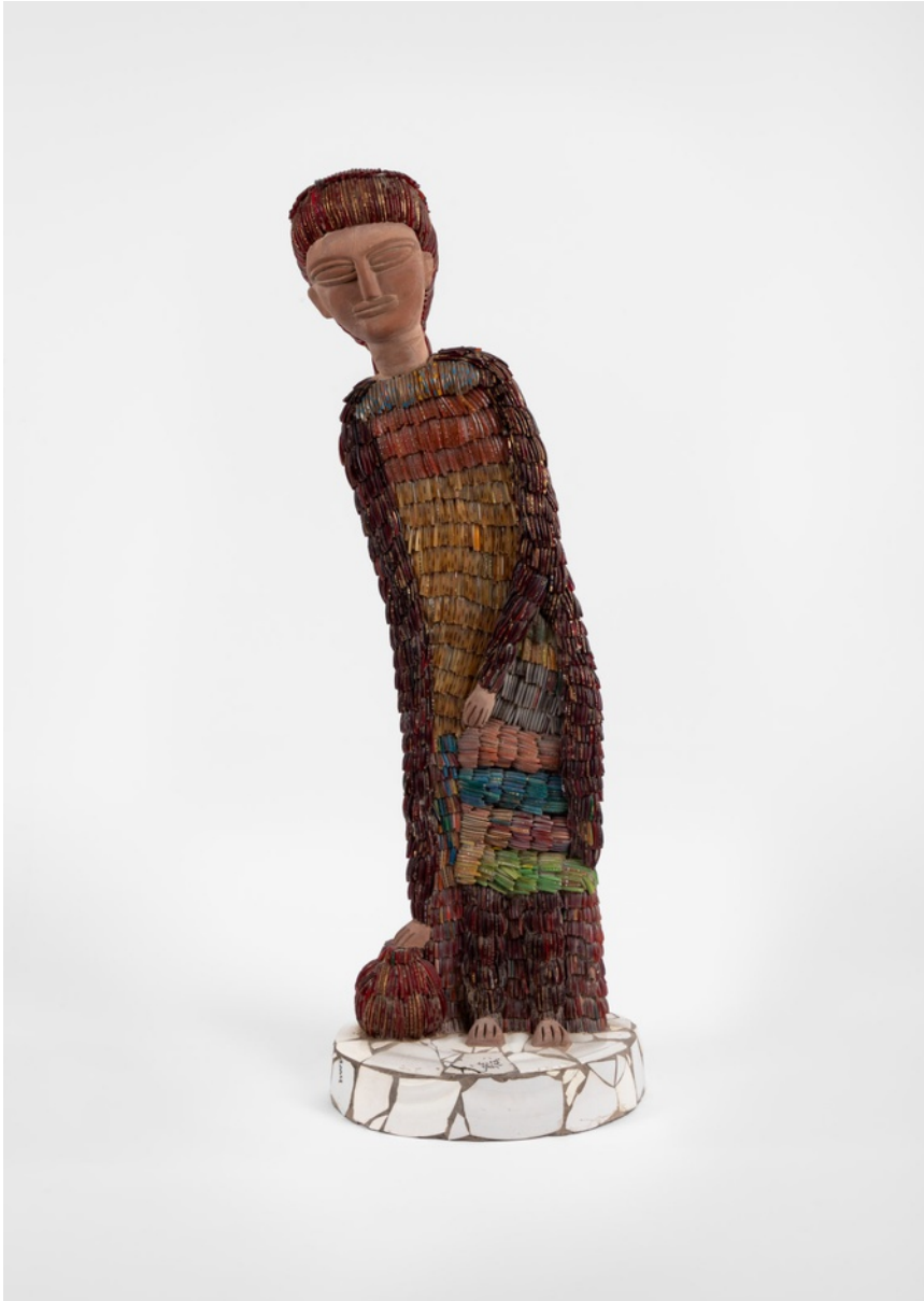
NEK CHAND SAINI Untitled (standing figure) , 1980/90