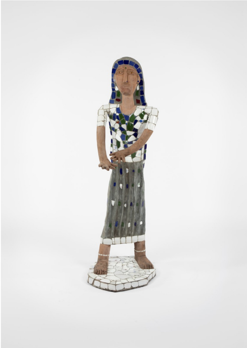
NEK CHAND SAINI Untitled (standing figure) , 1980/90

metal, cement, ceramic 158 x 51 x 59 cm 62 1/4 x 20 x 23 1/4 in (CHAN-031)