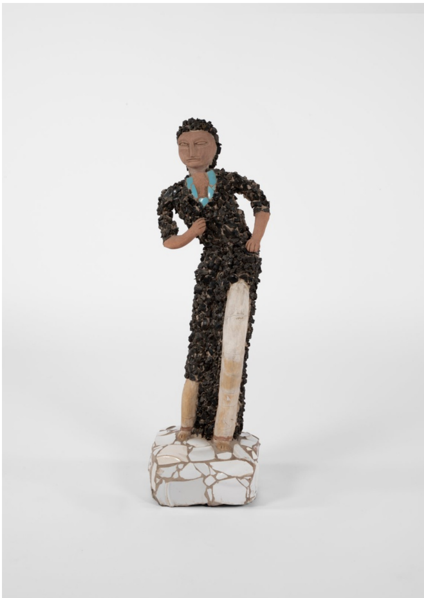
metal, cement, clinker, ceramic 71 x 22 x 20 cm 28 x 8 3/4 x 7 3/4 in (CHAN-063)