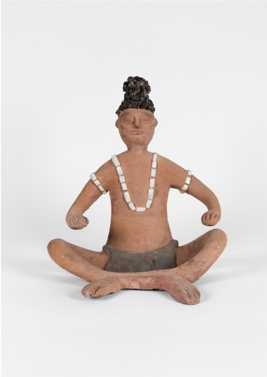
NEK CHAND SAINI Untitled (seated figure) , 1980/90

metal, cement, clinker, ceramic 46 x 41 x 28 cm 18 x 16 1/4 x 11 in (CHAN-007)