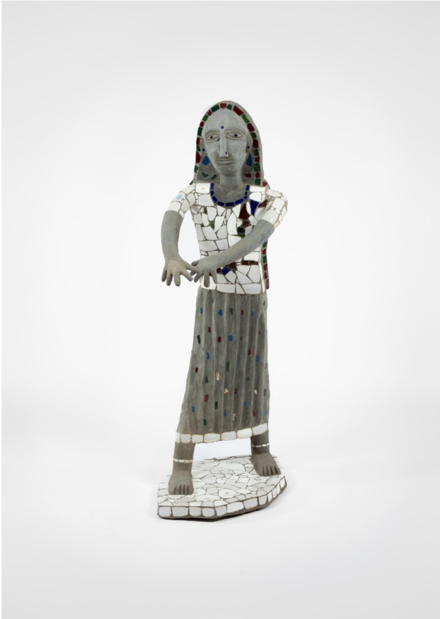
NEK CHAND SAINI Untitled (standing figure) , 1980/90

metal, cement, ceramic 158 x 51 x 54 cm 62 1/4 x 20 x 21 1/4 in (CHAN-053)