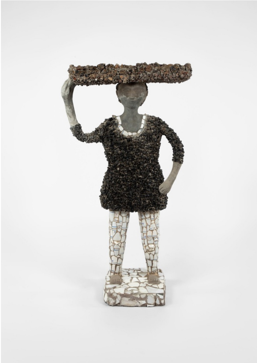
metal, cement, ceramic, rock 137 x 71 x 39 cm 54 x 28 x 15 1/4 in (CHAN-068)