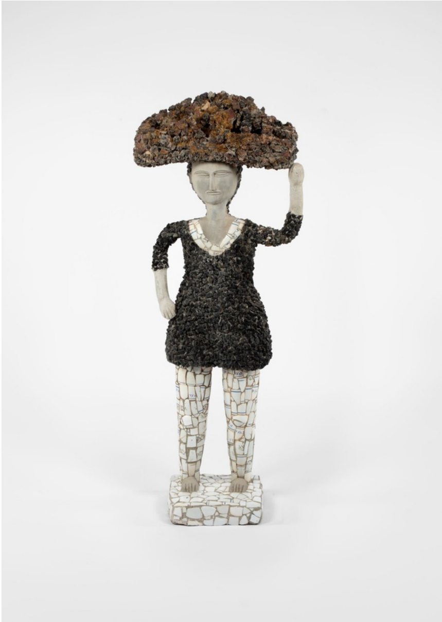
NEK CHAND SAINI Untitled (standing figure), 1970/80

metal, cement, ceramic, rock 149 x 56 x 34 cm 58 3/4 x 22 x 13 1/2 in (CHAN-069)