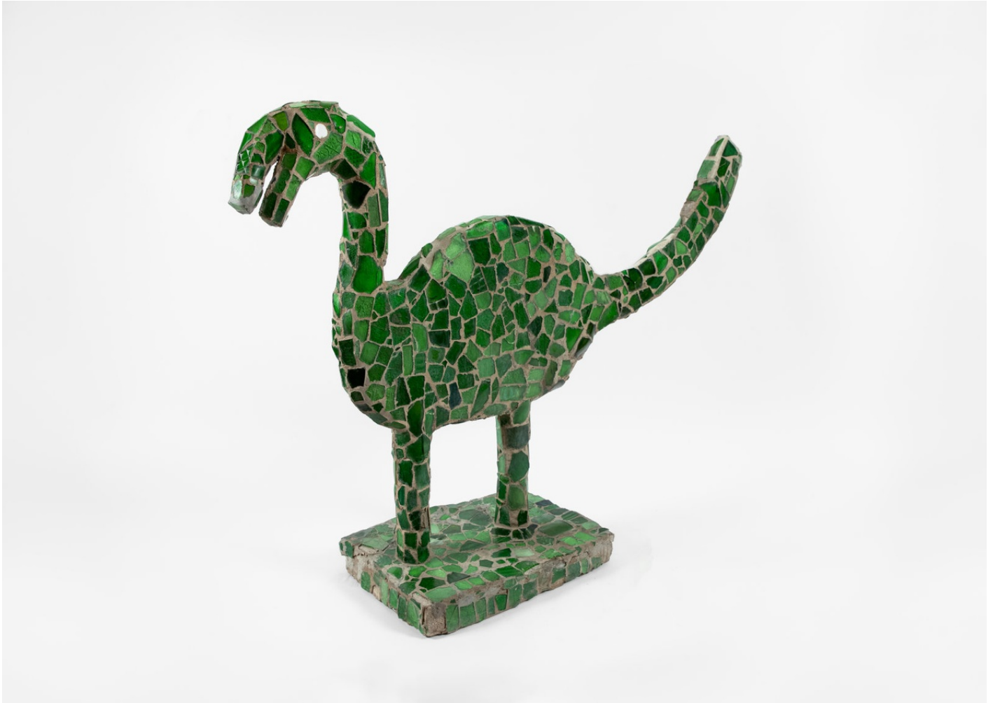
NEK CHAND SAINI Untitled (bird) , 1980/90

metal, cement, glass, ceramic 96 x 124 x 35 cm 37 3/4 x 48 7/8 x 13 3/4 in (CHAN-028)