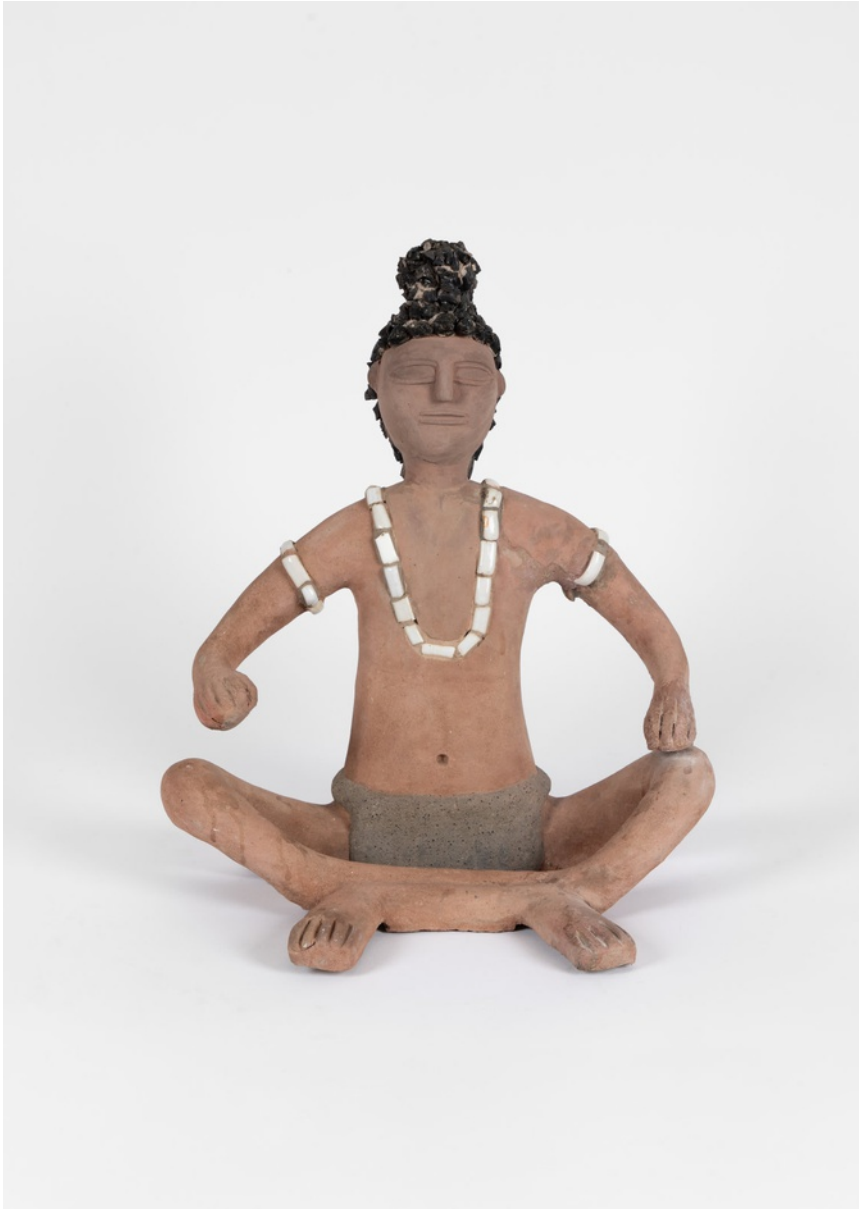
NEK CHAND SAINI Untitled (seated figure) , 1980/90

metal, cement, clinker, ceramic 46 x 41 x 30 cm 18 1/8 x 16 1/8 x 11 7/8 in (CHAN-006)