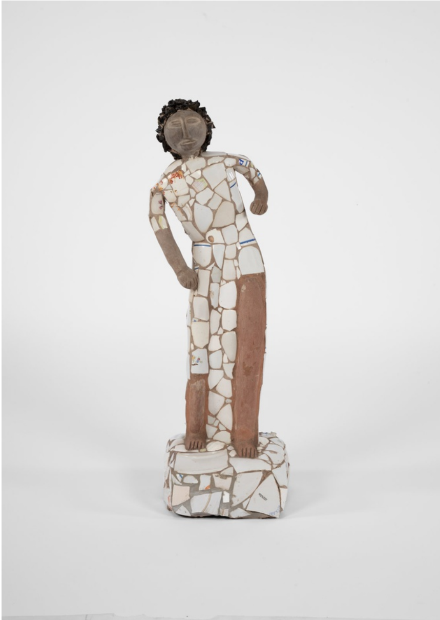
metal, cement, clinker, ceramic 74 x 22 x 21 cm 29 1/4 x 8 3/4 x 8 1/4 in (CHAN-064)