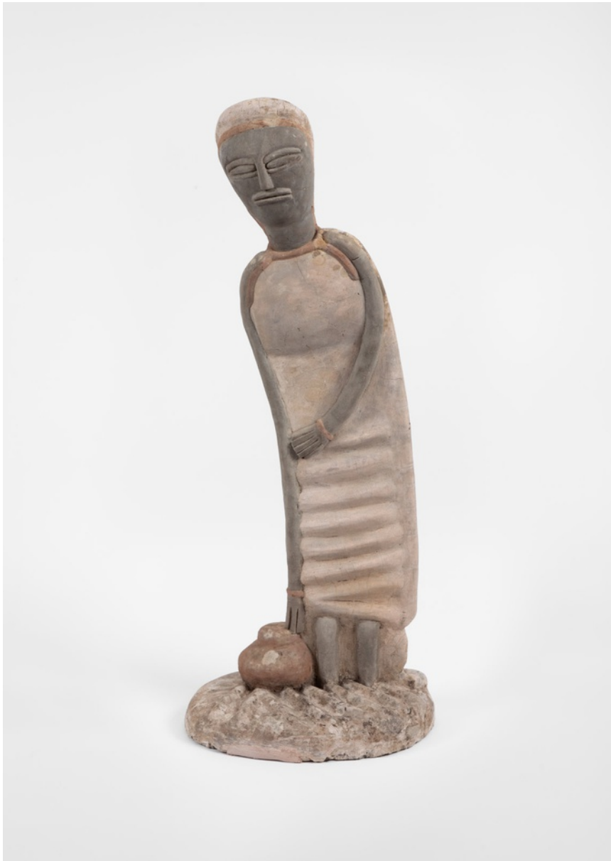
cement 86 x 36 x 27 cm 33 7/8 x 14 1/8 x 10 5/8 in (CHAN-110)