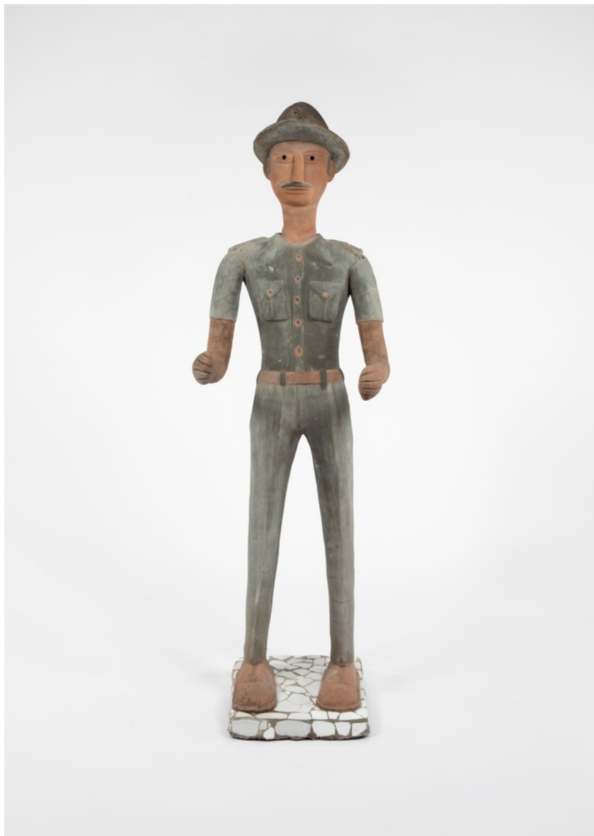
NEK CHAND SAINI Untitled (standing figure) , 1980/90

metal, cement, ceramic 179 x 54 x 51 cm 70 1/2 x 21 1/4 x 20 in (CHAN-032)