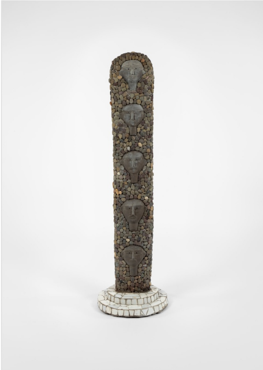
metal, cement, stone, ceramic 144 x 40 x 40 cm 56 5/8 x 15 3/4 x 15 3/4 in (CHAN-036)