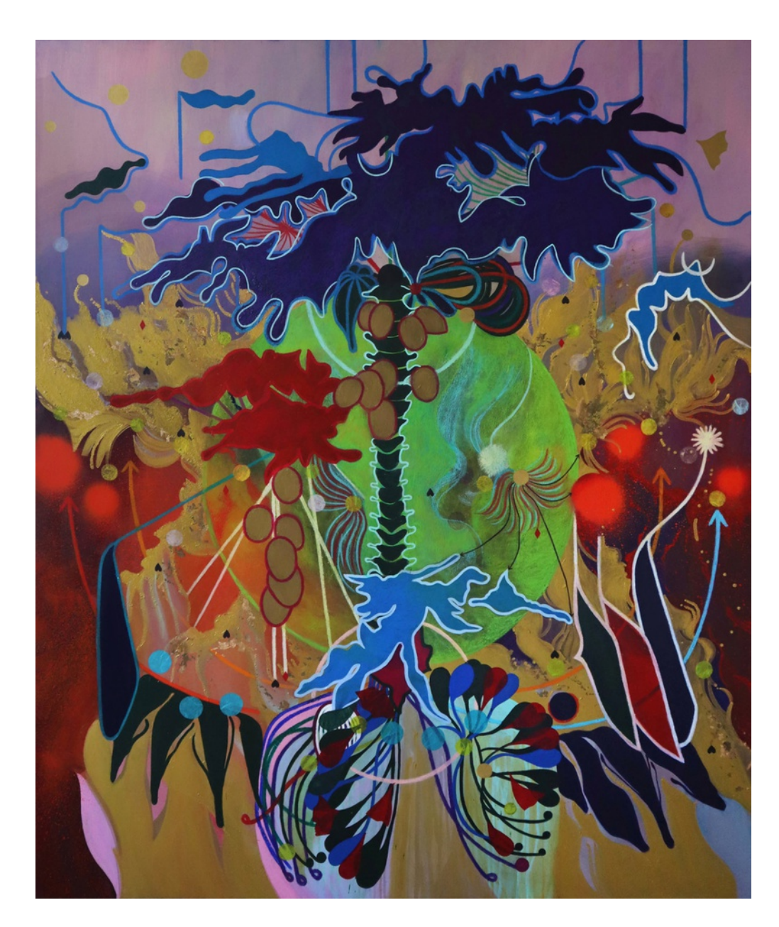
Mixed Media on Cotton Canvas

180 x 150 cm 70 7/8 x 59 in (G1957TD056)