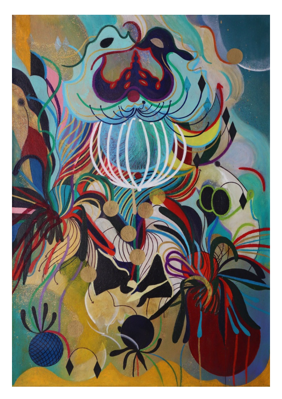
Mixed Media on Cotton Canvas

100 x 70 cm 39 3/8 x 27 1/2 in (G1957TD064)