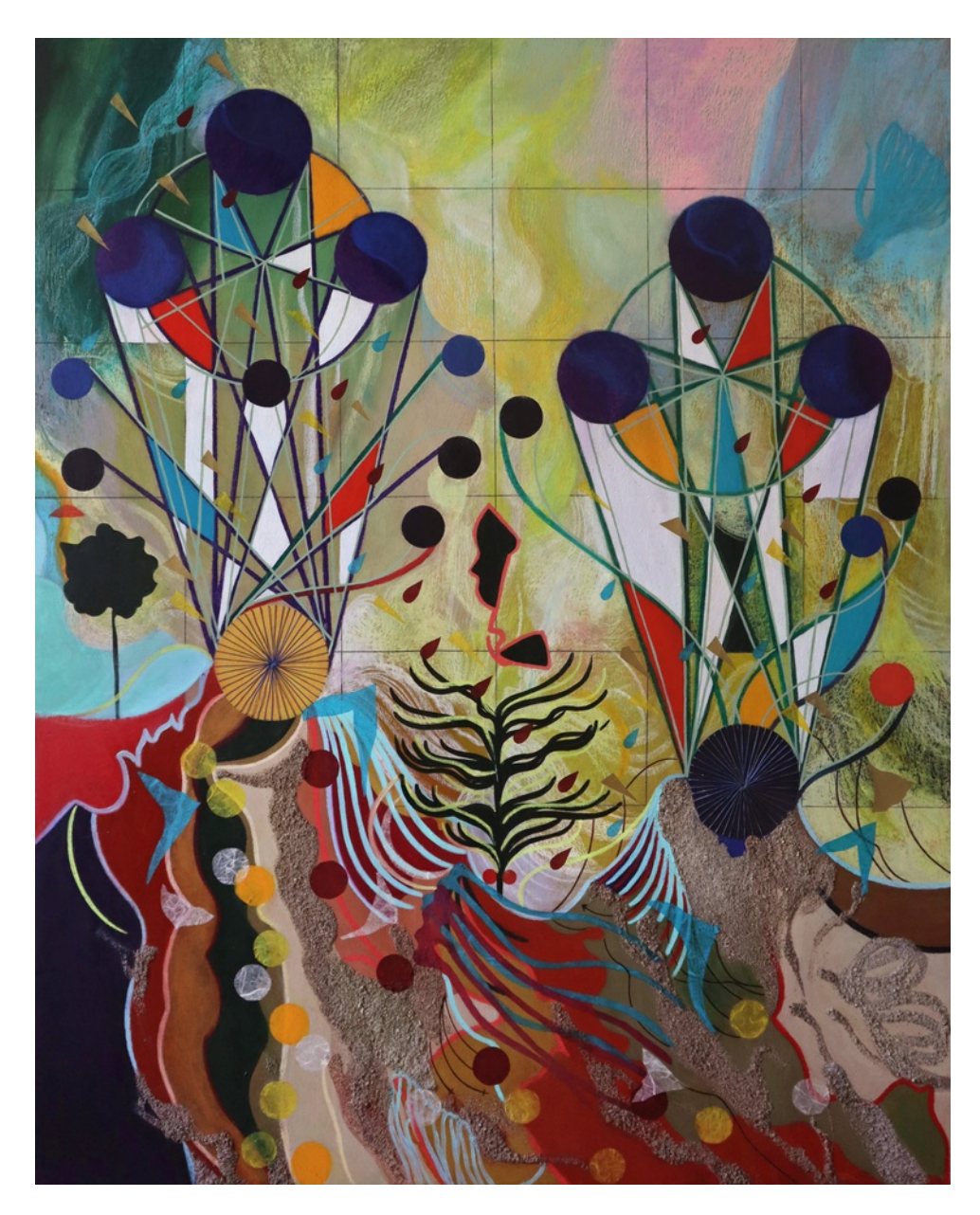
Mixed Media on Cotton Canvas

150 x 120 cm 59 x 47 1/4 in (G1957TD055)