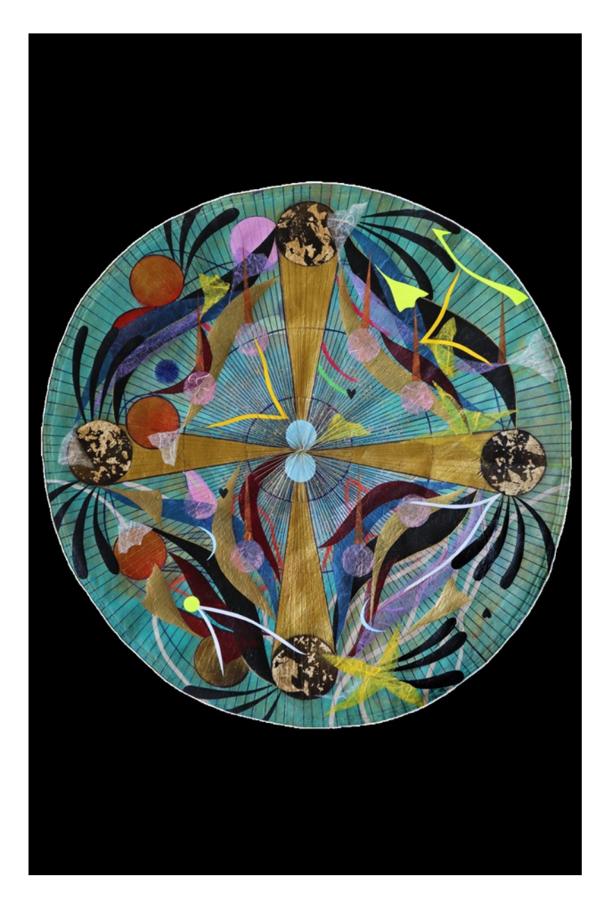
Mixed Media on Cotton Canvas

70 cm Diameter 27 1/2 in Diameter (G1957TD058)