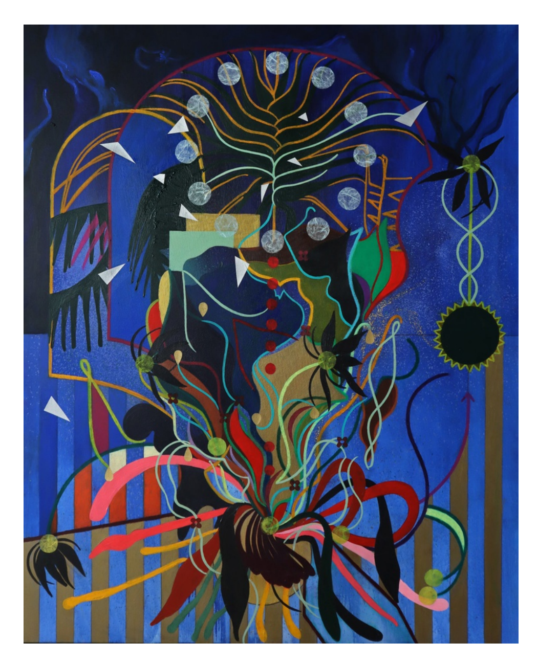
Mixed Media on Cotton Canvas

150 x 120 cm 59 x 47 1/4 in (G1957TD061)