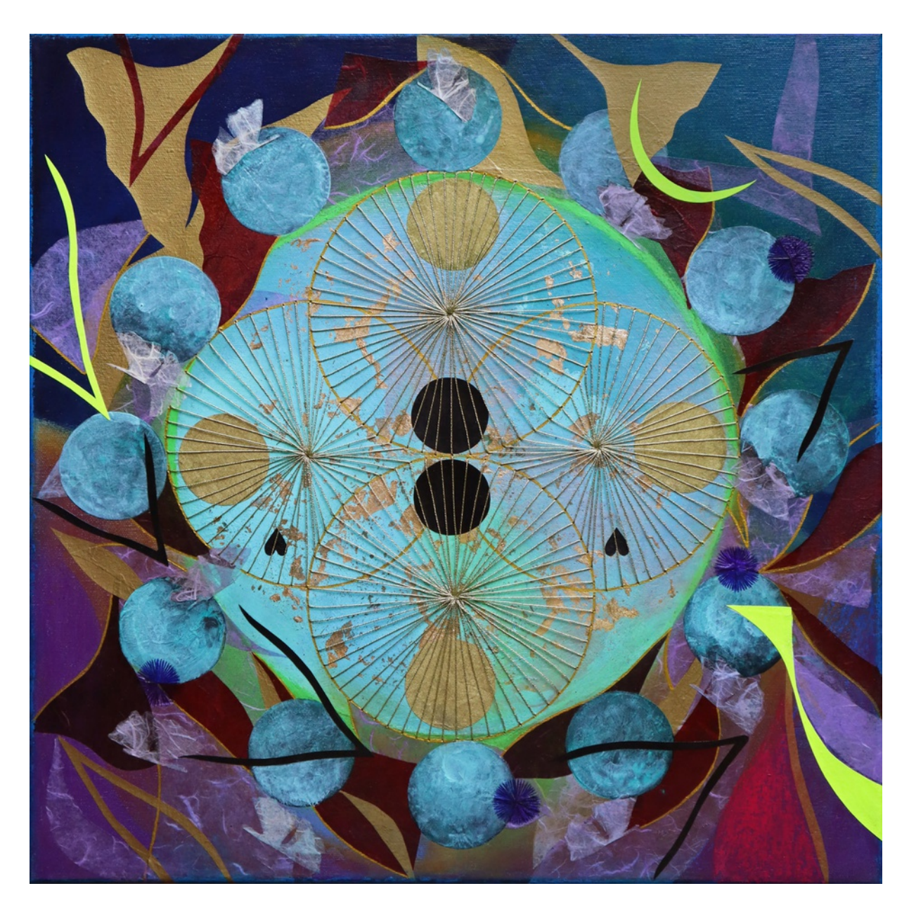
Mixed Media on Cotton Canvas

50 x 50 cm 19 3/4 x 19 3/4 in (G1957TD063)