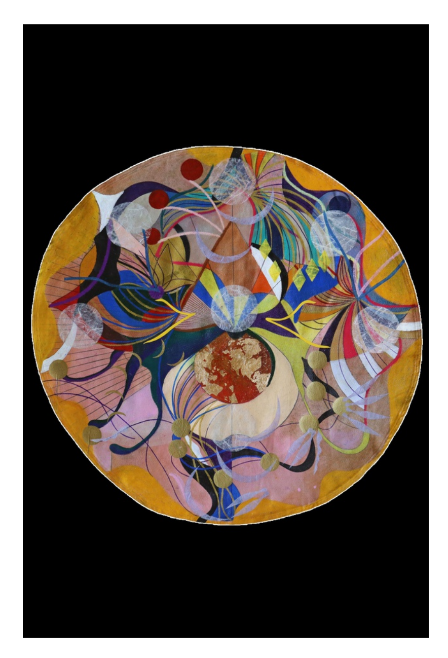
Mixed Media on Cotton Canvas

70 cm Diameter 27 1/2 in Diameter (G1957TD057)