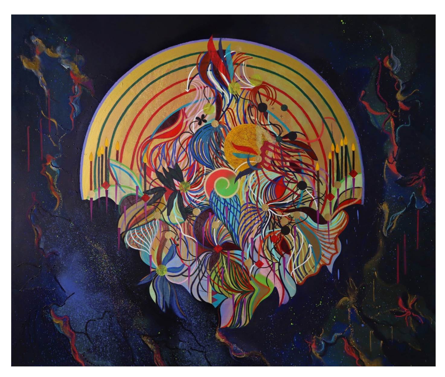
Mixed Media on Cotton Canvas

150 x 180 cm 59 x 70 7/8 in (G1957TD060)