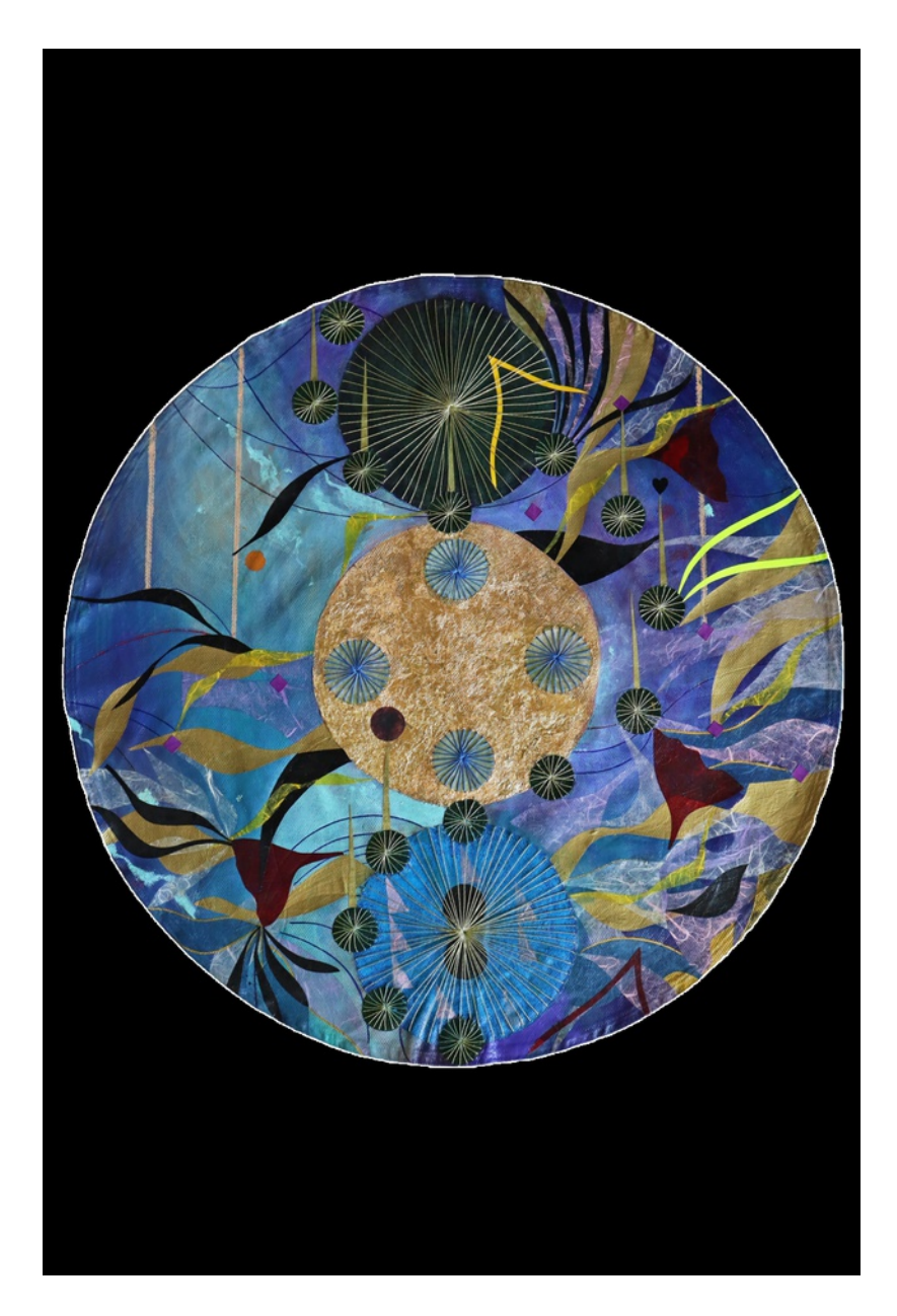
Mixed Media on Cotton Canvas

70 cm Diameter 27 1/2 in Diameter (G1957TD059)