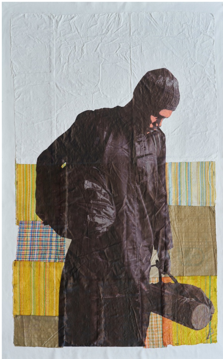
Polypropylene, paint and photo on canvas 142.5 x 87.5 cm 56 1/8 x 34 1/2 in (G1957CS006)