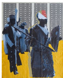
Collin Sekajugo Subjects, 2021 Polypropylene, paint and photo on canvas 198.5 x 157 cm 78 1/8 x 61 3/4 in (G1957CS002)