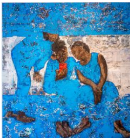
Kaloki Nyamai Oka Twone1 (Come and See), 2022 Acrylic, stitching, and image transfer on canvas 230 x 221 cm 90 1/2 x 87 1/8 in (G1957KNK019)