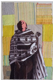
Collin Sekajugo Filtered imagination, 2021 Polypropylene, paint and photo on canvas 141 x 93.5 cm 55 1/2 x 36 3/4 in (G1957CS008)