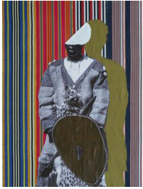
Collin Sekajugo The watchman, 2021 Polypropylene, paint and photo on canvas 200 x 149 cm 78 3/4 x 58 5/8 in (G1957CS003)