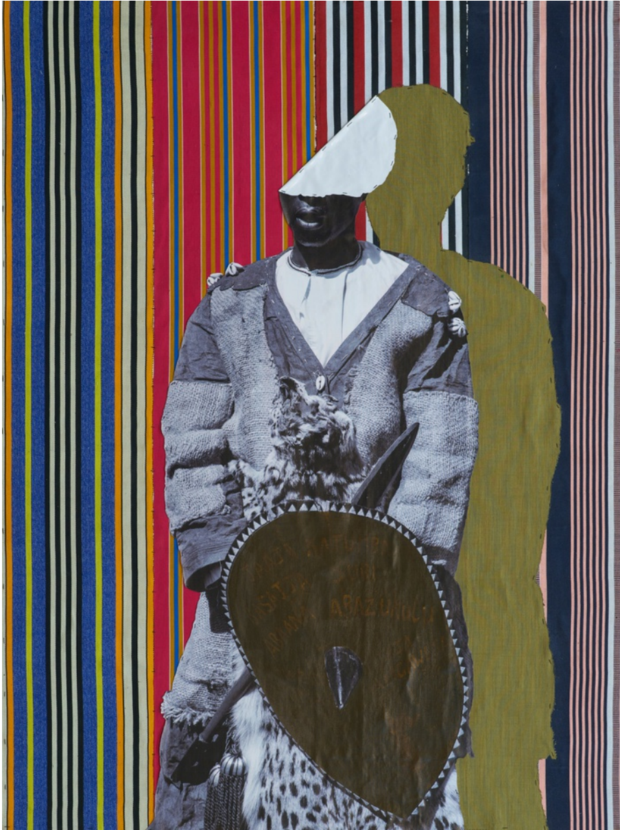
Polypropylene, paint and photo on canvas 200 x 149 cm 78 3/4 x 58 5/8 in (G1957CS003)