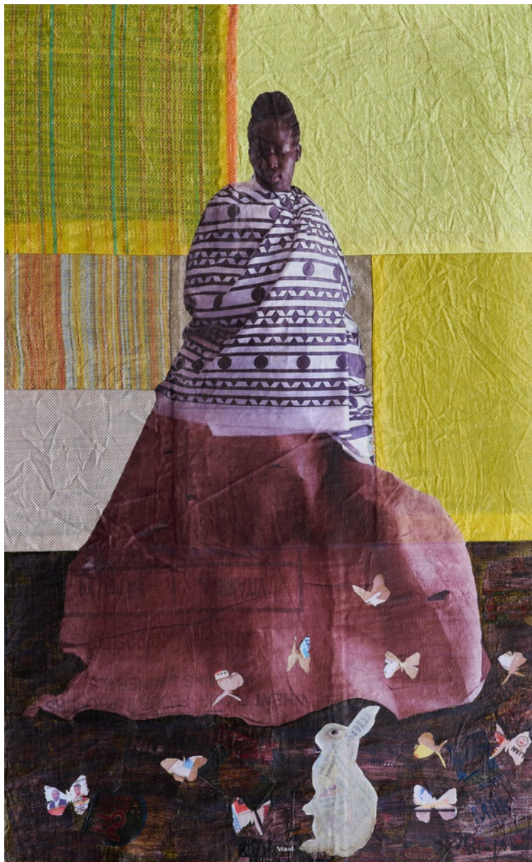
Polypropylene, paint and photo on canvas 136 x 85 cm 53 1/2 x 33 1/2 in (G1957CS009)