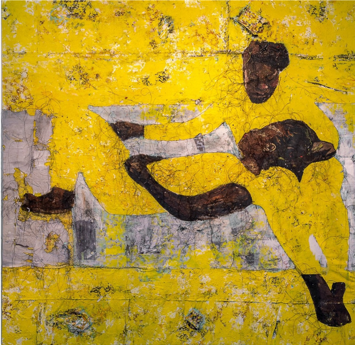
Acrylic, stitching, and image transfer on canvas 225 x 235 cm 88 5/8 x 92 1/2 in (G1957KNK018)