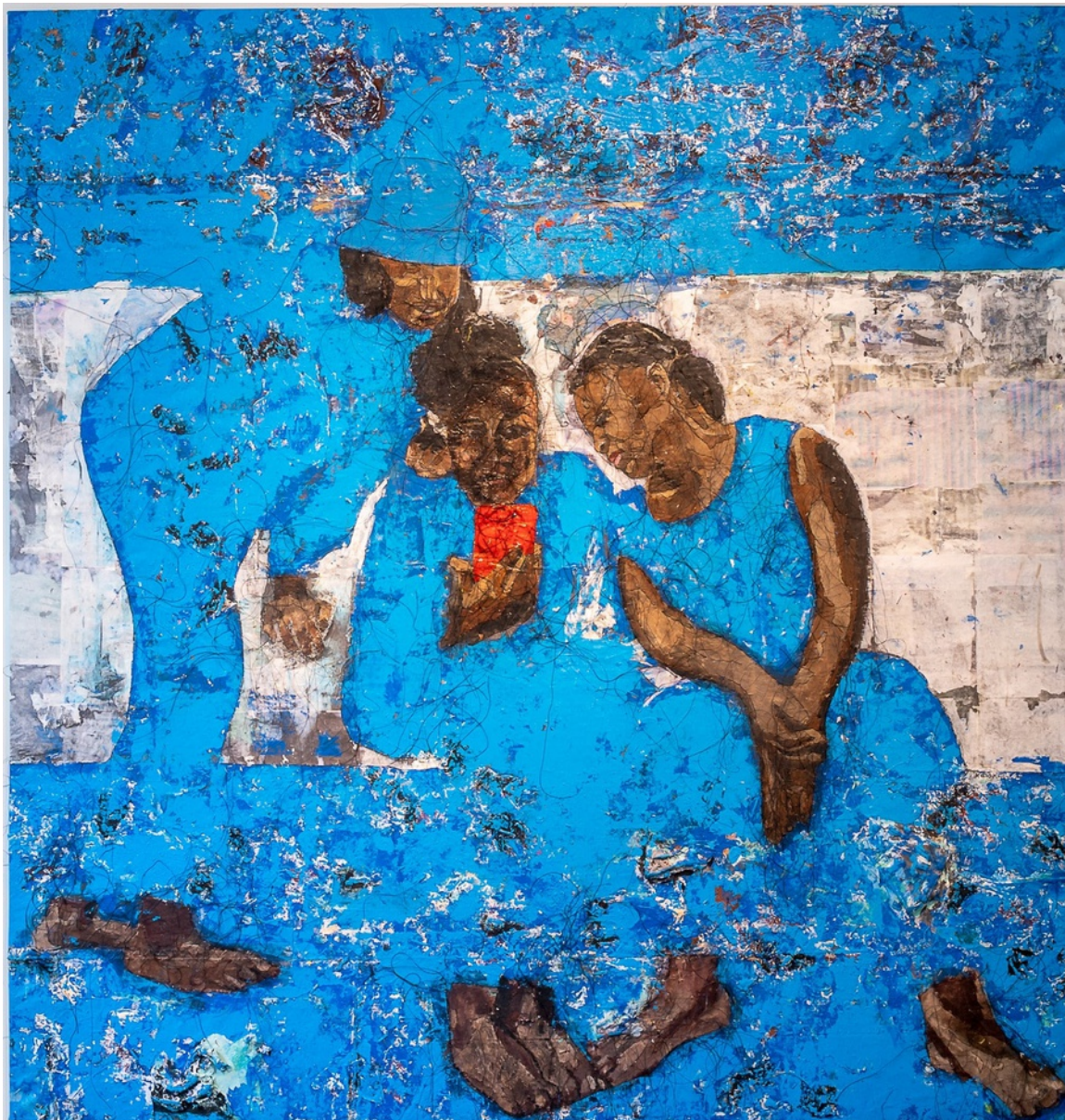
Acrylic, stitching, and image transfer on canvas 230 x 221 cm 90 1/2 x 87 1/8 in (G1957KNK019)