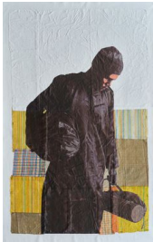
Collin Sekajugo Dream chaser, 2021 Polypropylene, paint and photo on canvas 142.5 x 87.5 cm 56 1/8 x 34 1/2 in (G1957CS006)