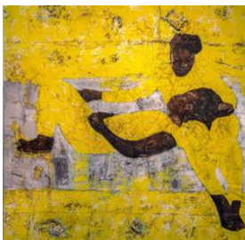
Kaloki Nyamai Keta Tu Okoma (Just Sleep), 2022 Acrylic, stitching, and image transfer on canvas 225 x 235 cm 88 5/8 x 92 1/2 in (G1957KNK018)