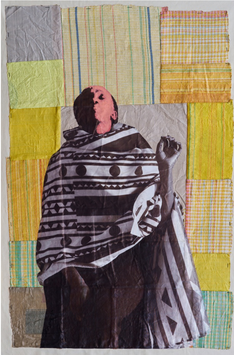
Polypropylene, paint and photo on canvas 141 x 93.5 cm 55 1/2 x 36 3/4 in (G1957CS008)