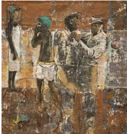
Kaloki Nyamai Ivinda Inene (Big Day), 2021 Acrylic and collage on canvas 152 x 140 cm 59 7/8 x 55 1/8 in (G1957KNK015)