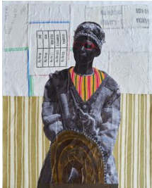
Collin Sekajugo The endorser, 2021 Polypropylene, paint and photo on canvas 198.5 x 157 cm 78 1/8 x 61 3/4 in (G1957CS005)