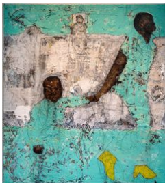
Kaloki Nyamai Nutonga Sukulu (I am taking you back to school), 2022 Acrylic, stitching, and image transfer on canvas 143 x 128 cm 56 1/4 x 50 3/8 in (G1957KNK017)