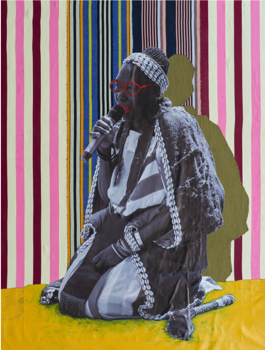
Polypropylene, paint and photo on canvas 198.5 x 150 cm 78 1/8 x 59 1/8 in (G1957CS001)