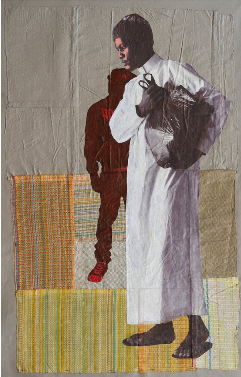
Polypropylene, paint and photo on canvas 138.5 x 88.5 cm 54 1/2 x 34 7/8 in (G1957CS007)