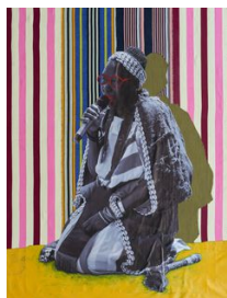
Collin Sekajugo Trust the aunt, 2021 Polypropylene, paint and photo on canvas 198.5 x 150 cm 78 1/8 x 59 1/8 in (G1957CS001)

For full details and larger images, please see the end of this document.