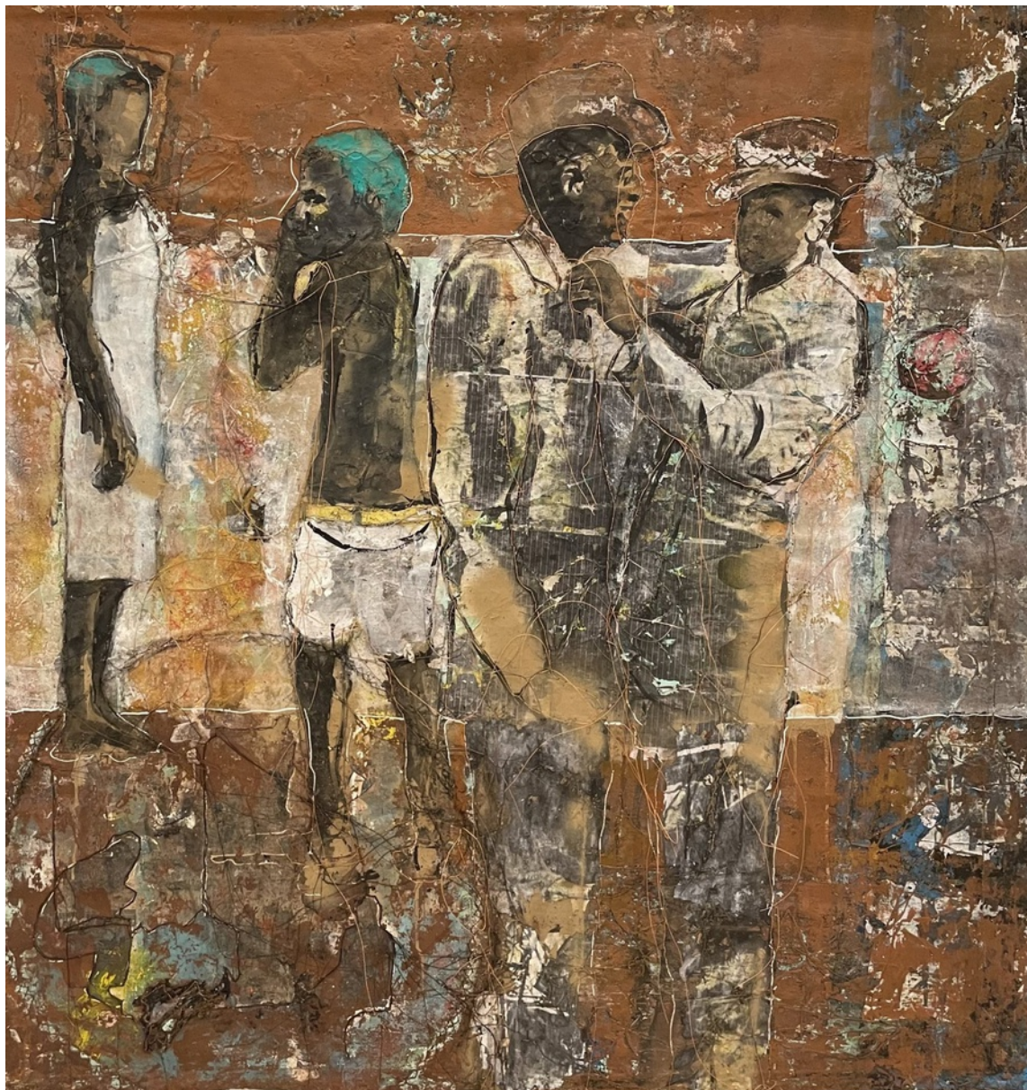
Acrylic and collage on canvas 152 x 140 cm 59 7/8 x 55 1/8 in (G1957KNK015)