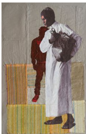
Collin Sekajugo The reality, 2021 Polypropylene, paint and photo on canvas 138.5 x 88.5 cm 54 1/2 x 34 7/8 in (G1957CS007)