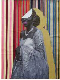
Collin Sekajugo Hidden price, 2021 Polypropylene, paint and photo on canvas 198.5 x 150 cm 78 1/8 x 59 1/8 in (G1957CS004)