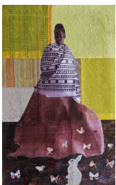
Collin Sekajugo Warm winter, 2021 Polypropylene, paint and photo on canvas 136 x 85 cm 53 1/2 x 33 1/2 in (G1957CS009)