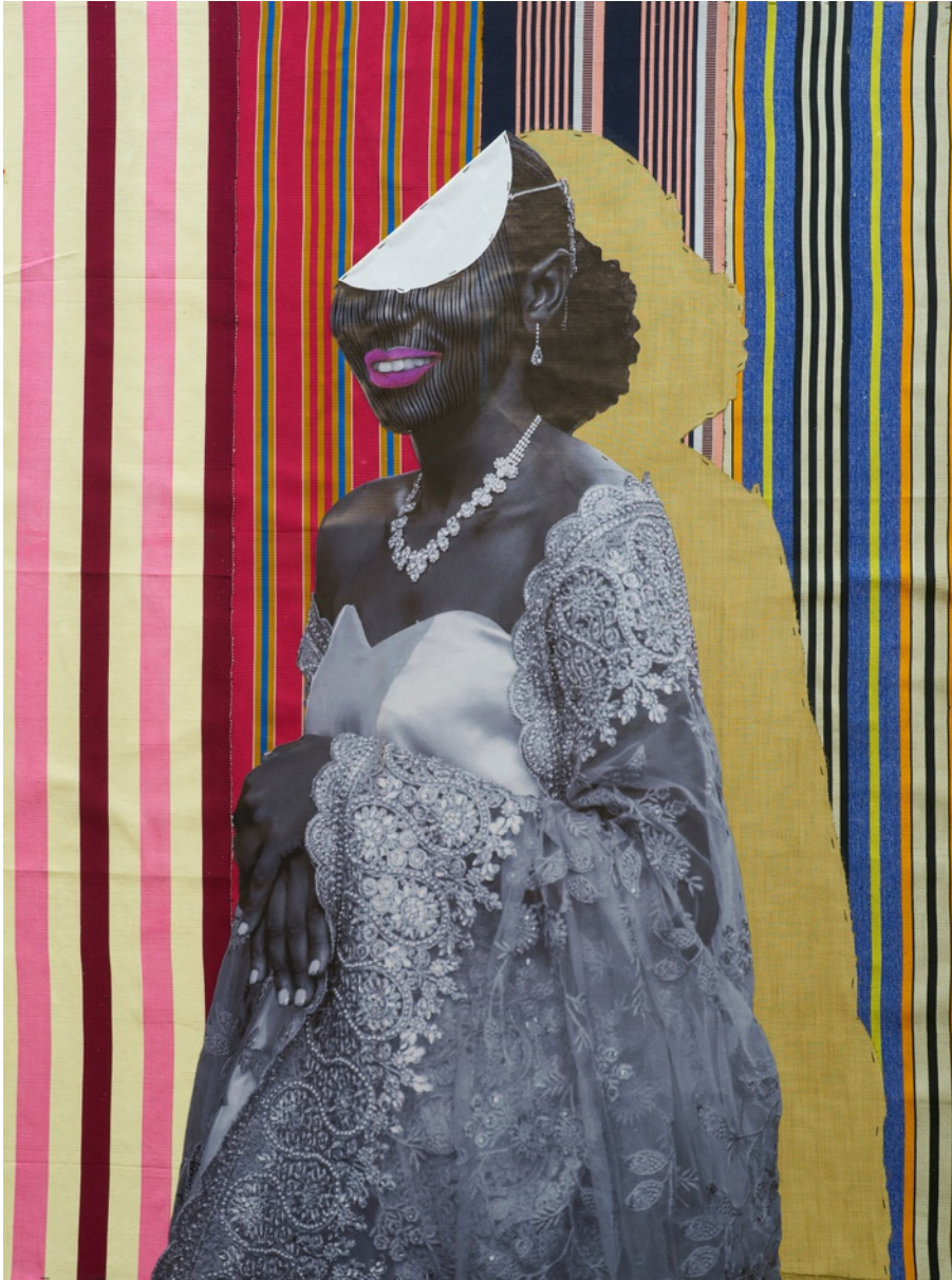
Polypropylene, paint and photo on canvas 198.5 x 150 cm 78 1/8 x 59 1/8 in (G1957CS004)