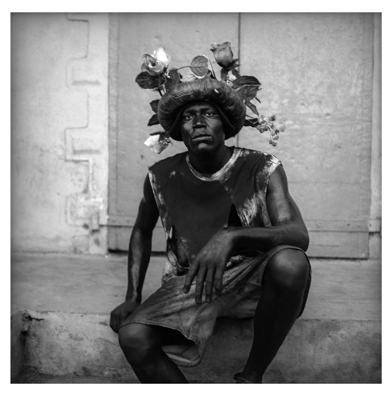
C-type Lambda prints on Fuji Crystal Archive paper from scans from black and white medium format analogue negatives

50 \times 50 cm / 100 \times 100 cm Edition of 5 plus 2 artist's proofs (ECFA2133)