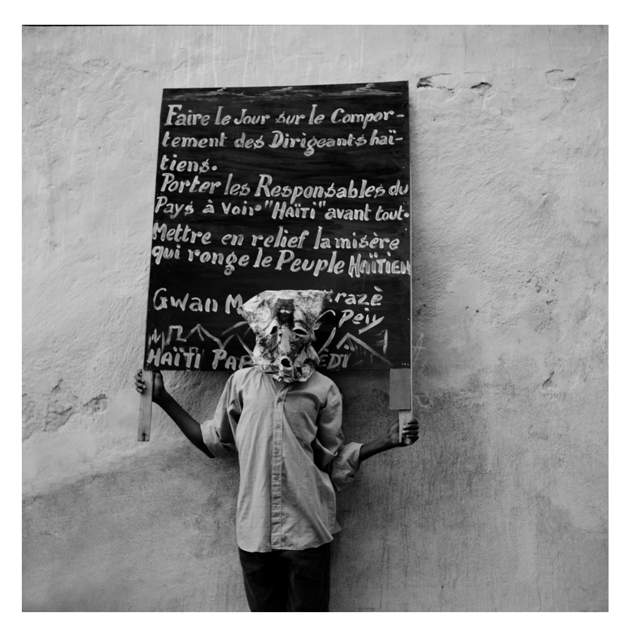
C-type Lambda prints on Fuji Crystal Archive paper from scans from black and white medium format analogue negatives 50 \times 50 \text{ cm} / 100 \times 100 \text{ cm}

Edition of 5 plus 2 artist's proofs (ECFA2160)