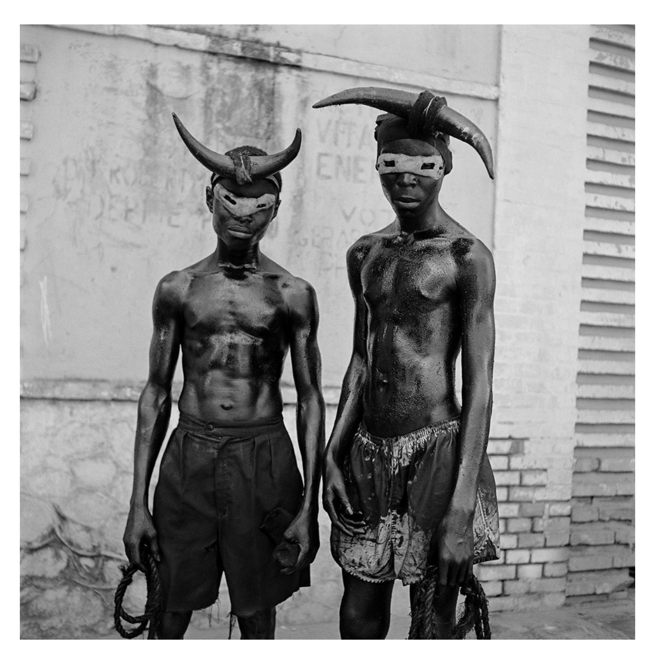
C-type Lambda prints on Fuji Crystal Archive paper from scans from black and white medium format analogue negatives