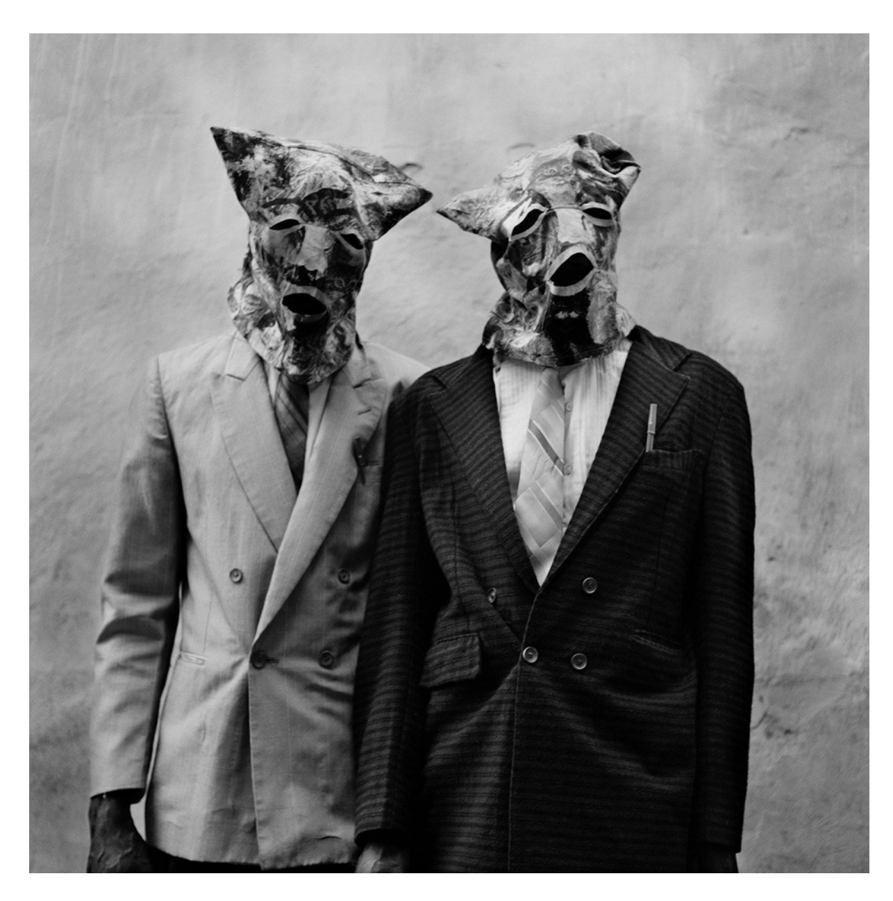
C-type Lambda prints on Fuji Crystal Archive paper from scans from black and white medium format analogue negatives

Edition of 5 plus 2 artist's proofs (ECFA2121)