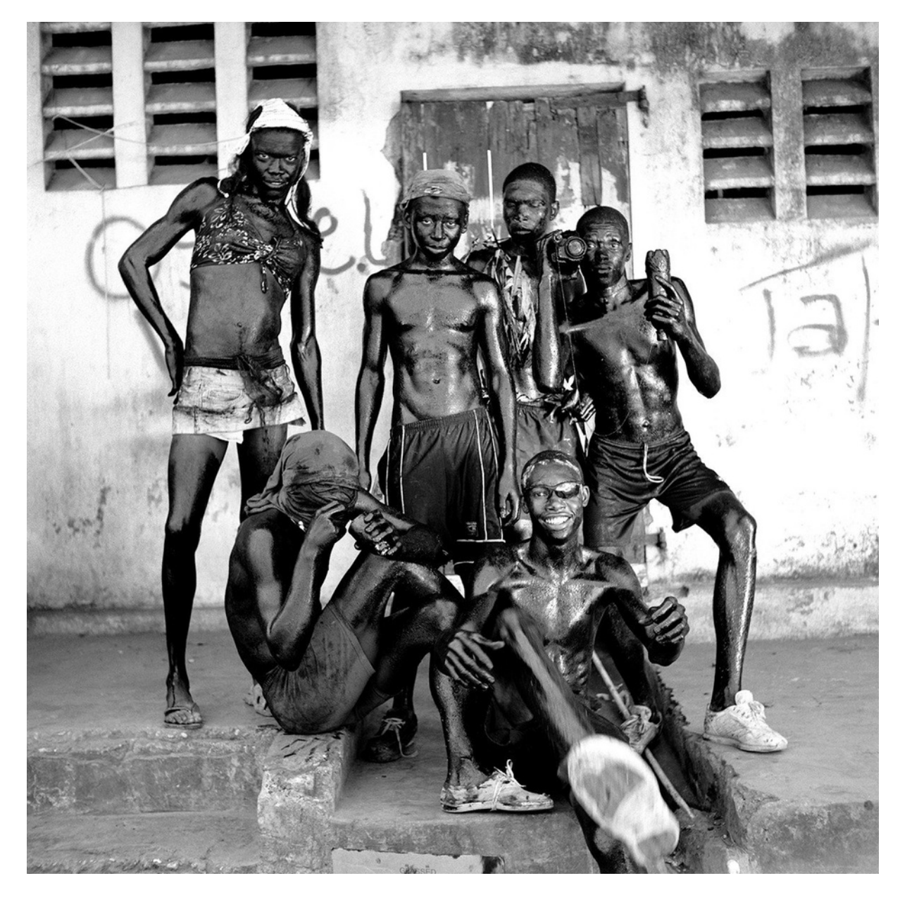
C-type Lambda prints on Fuji Crystal Archive paper from scans from black and white medium format analogue negatives

Edition of 5 plus 2 artist's proofs (ECFA2149)