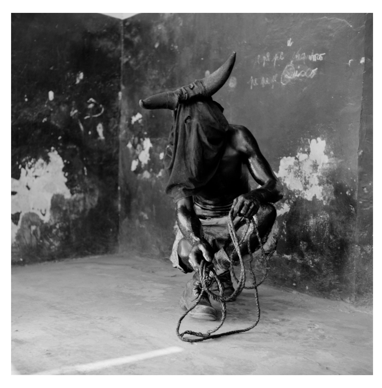
C-type Lambda prints on Fuji Crystal Archive paper from scans from black and white medium format analogue negatives 50 \times 50 \text{ cm} / 100 \times 100 \text{ cm}

Edition of 5 plus 2 artist's proofs (ECFA2163)