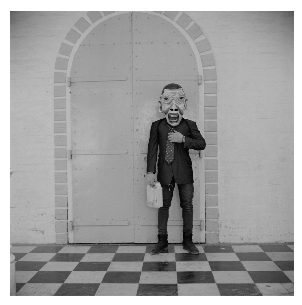
C-type Lambda prints on Fuji Crystal Archive paper from scans from black and white medium format analogue negatives

50 x 50 cm Edition 2/5 plus 2 APs (ECFA2132)