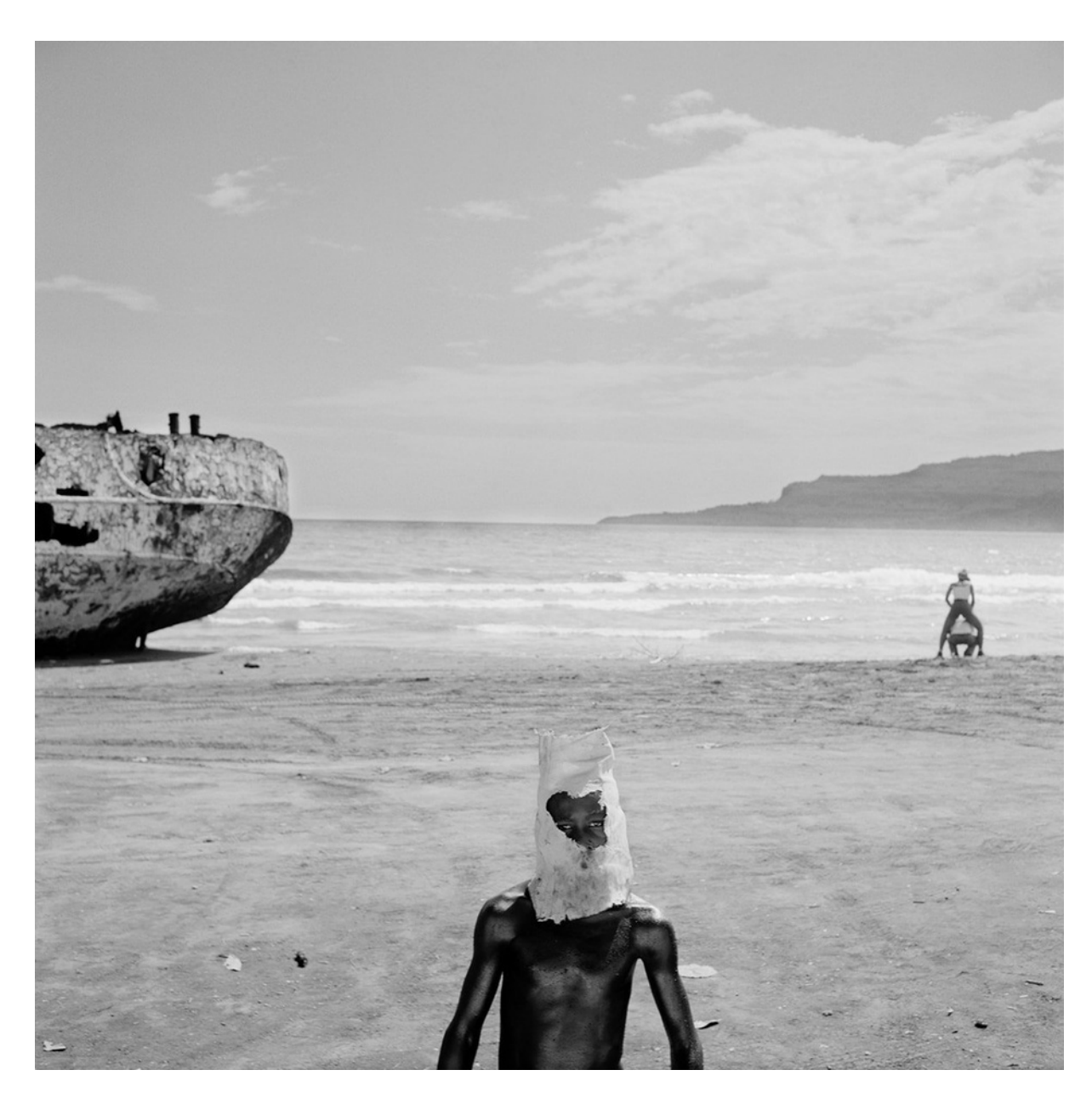
C-type Lambda prints on Fuji Crystal Archive paper from scans from black and white medium format analogue negatives