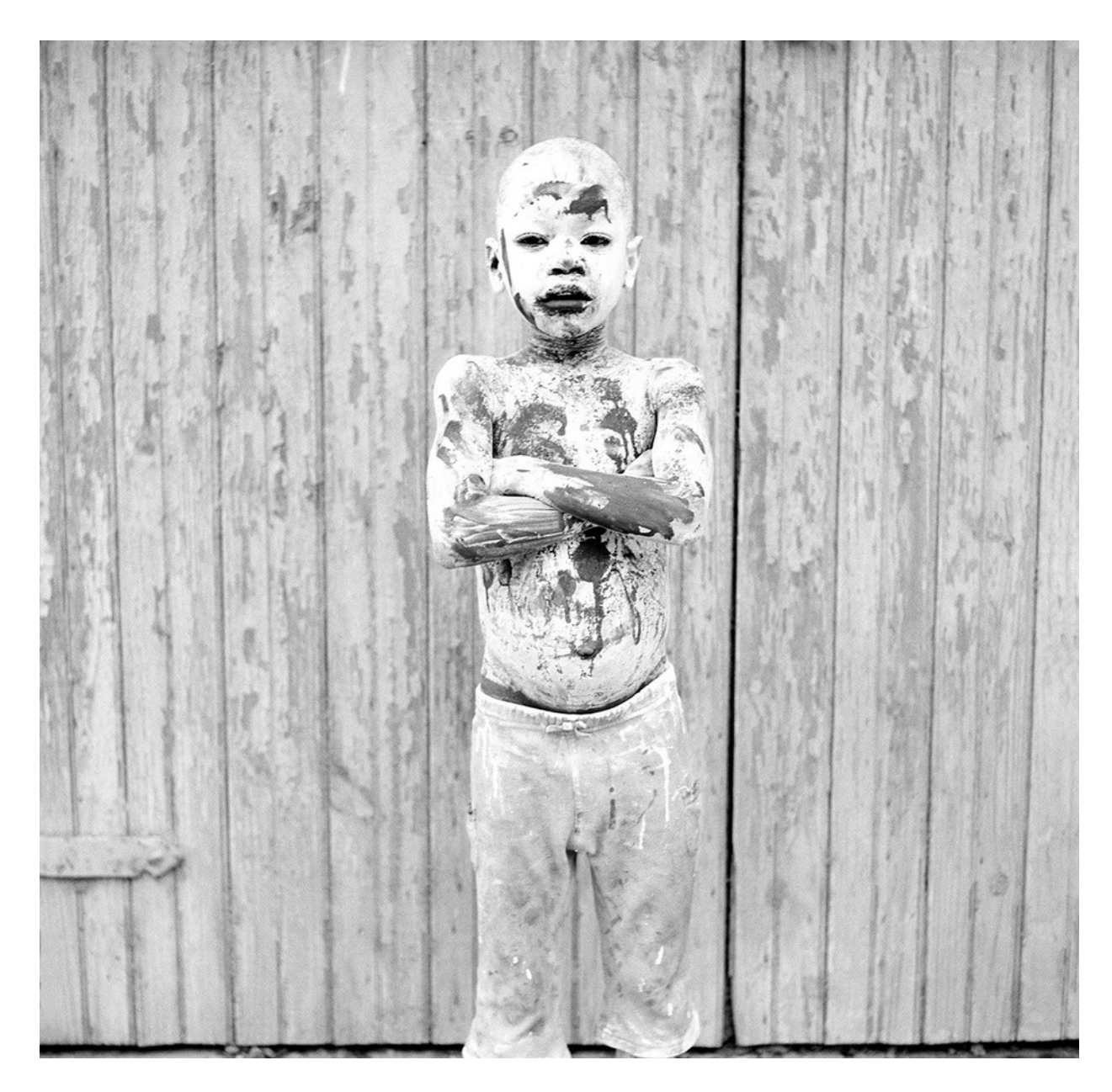
C-type Lambda prints on Fuji Crystal Archive paper from scans from black and white medium format analogue negatives

Edition of 5 plus 2 artist's proofs (ECFA2164)