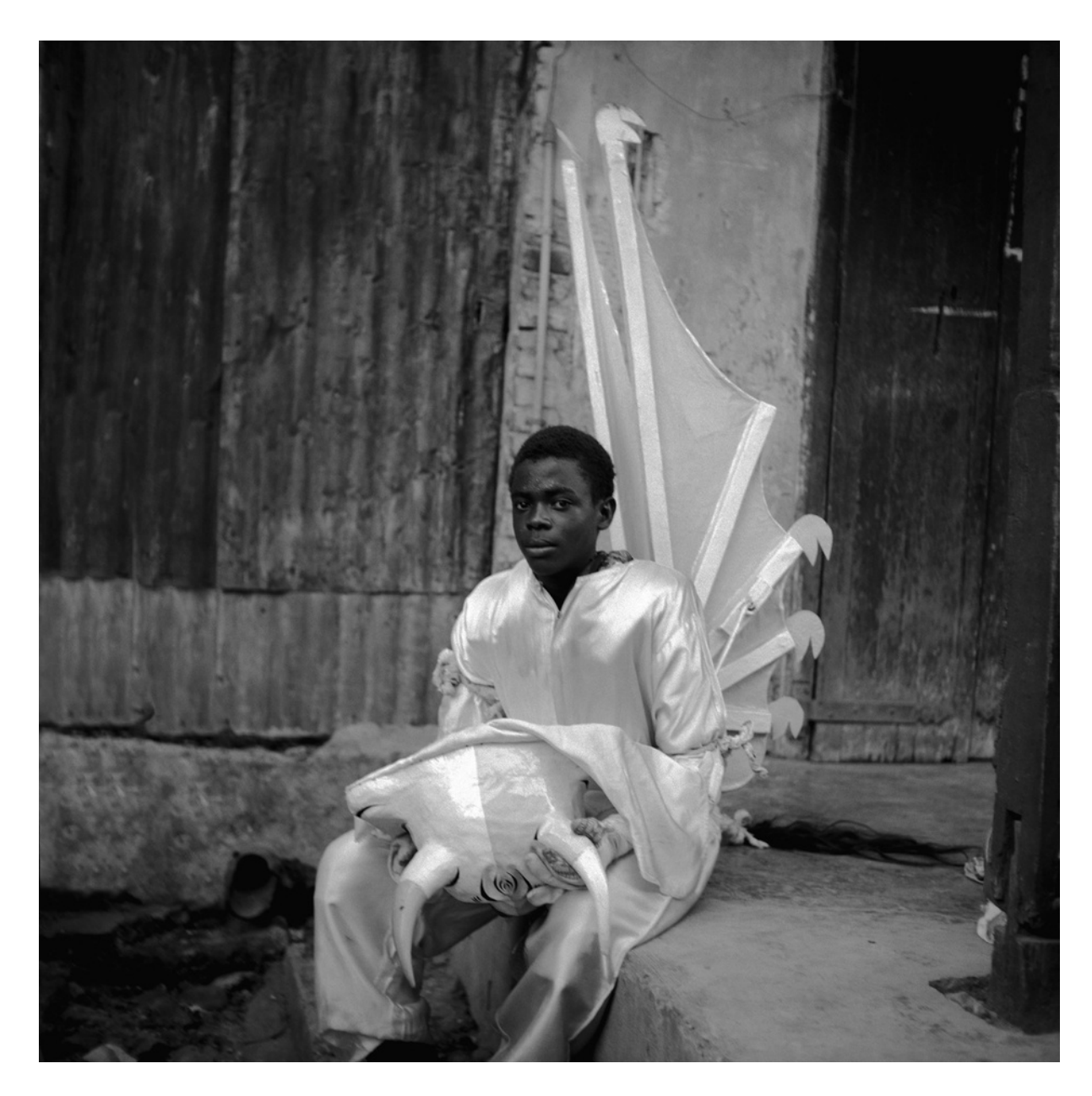
C-type Lambda prints on Fuji Crystal Archive paper from scans from black and white medium format analogue negatives

Edition of 5 plus 2 artist's proofs (ECFA2129)