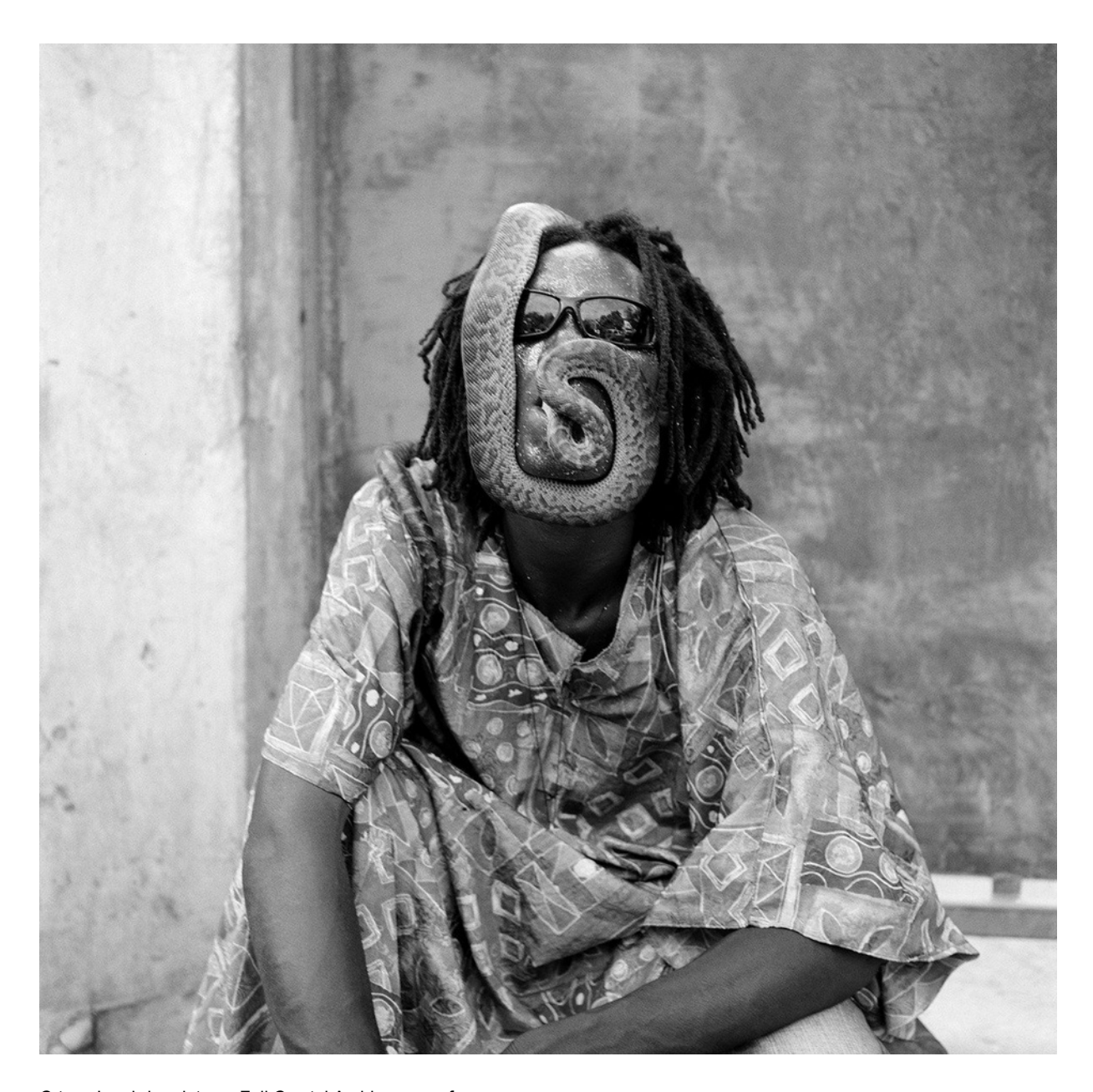
C-type Lambda prints on Fuji Crystal Archive paper from scans from black and white medium format analogue negatives 50 \times 50 \text{ cm} / 100 \times 100 \text{ cm}

Edition of 5 plus 2 artist's proofs (ECFA2162)