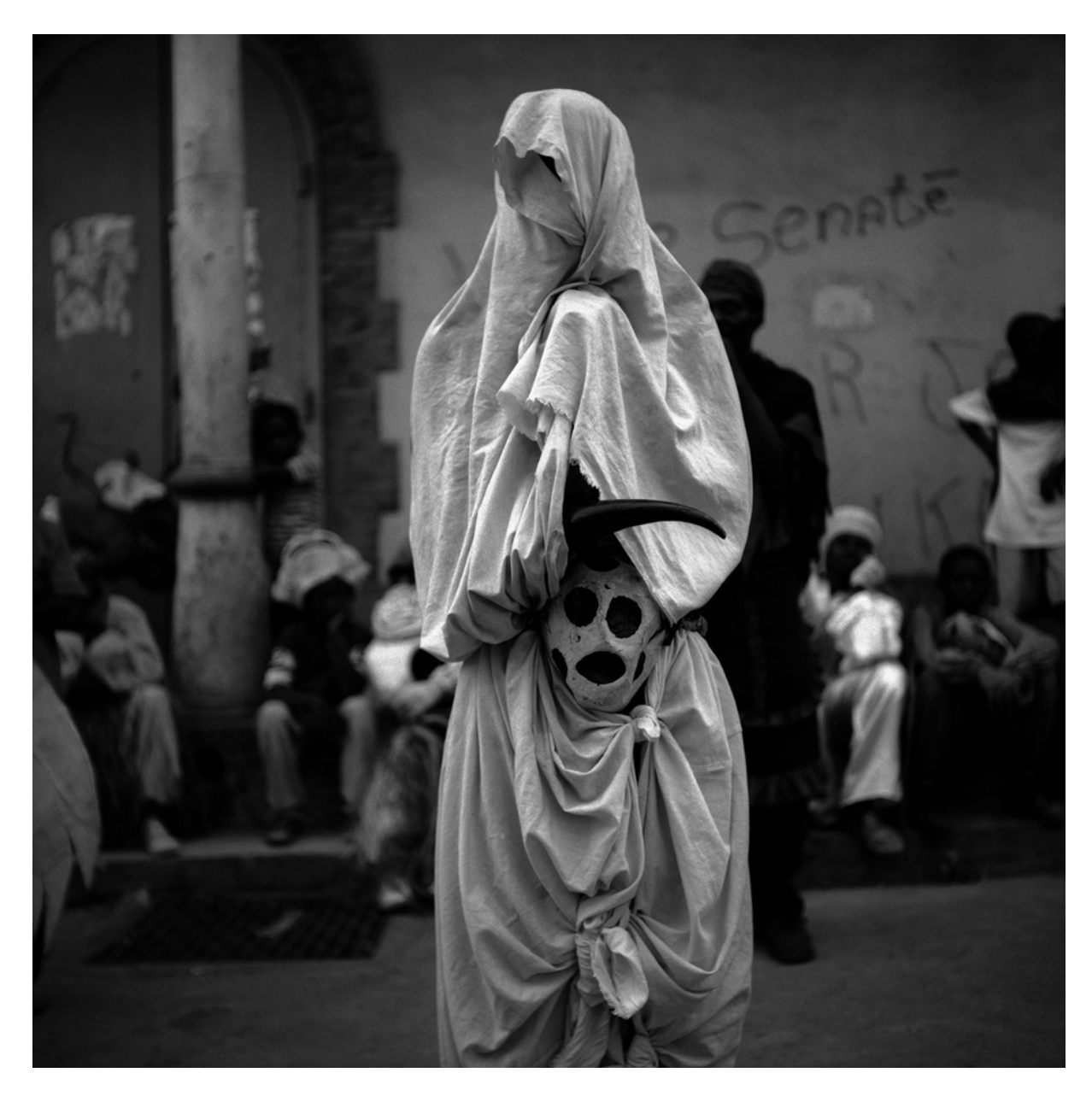
C-type Lambda prints on Fuji Crystal Archive paper from scans from black and white medium format analogue negatives

Edition of 5 plus 2 artist's proofs (ECFA2131)