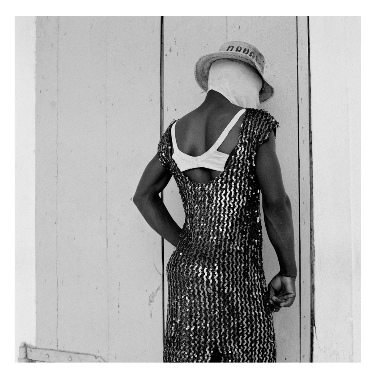
C-type Lambda prints on Fuji Crystal Archive paper from scans from black and white medium format analogue negatives

Edition of 5 plus 2 artist's proofs (ECFA2150)