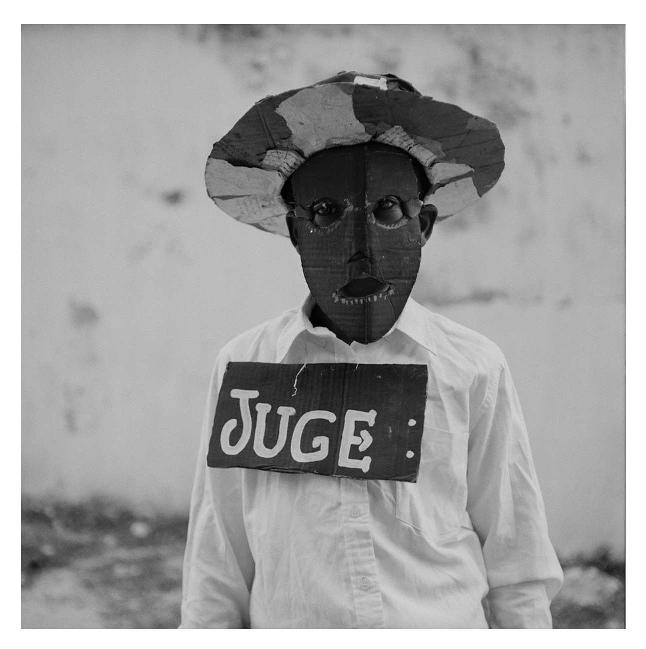
C-type Lambda prints on Fuji Crystal Archive paper from scans from black and white medium format analogue negatives

Edition of 5 plus 2 artist's proofs (ECFA2125)