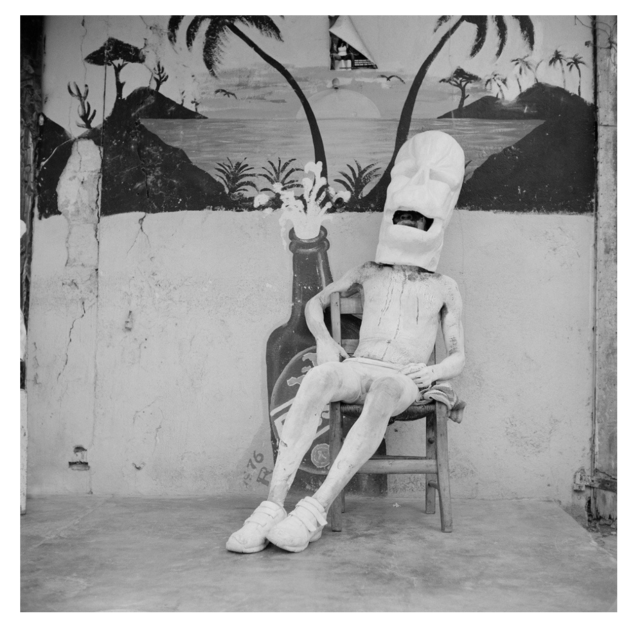
C-type Lambda prints on Fuji Crystal Archive paper from scans from black and white medium format analogue negatives