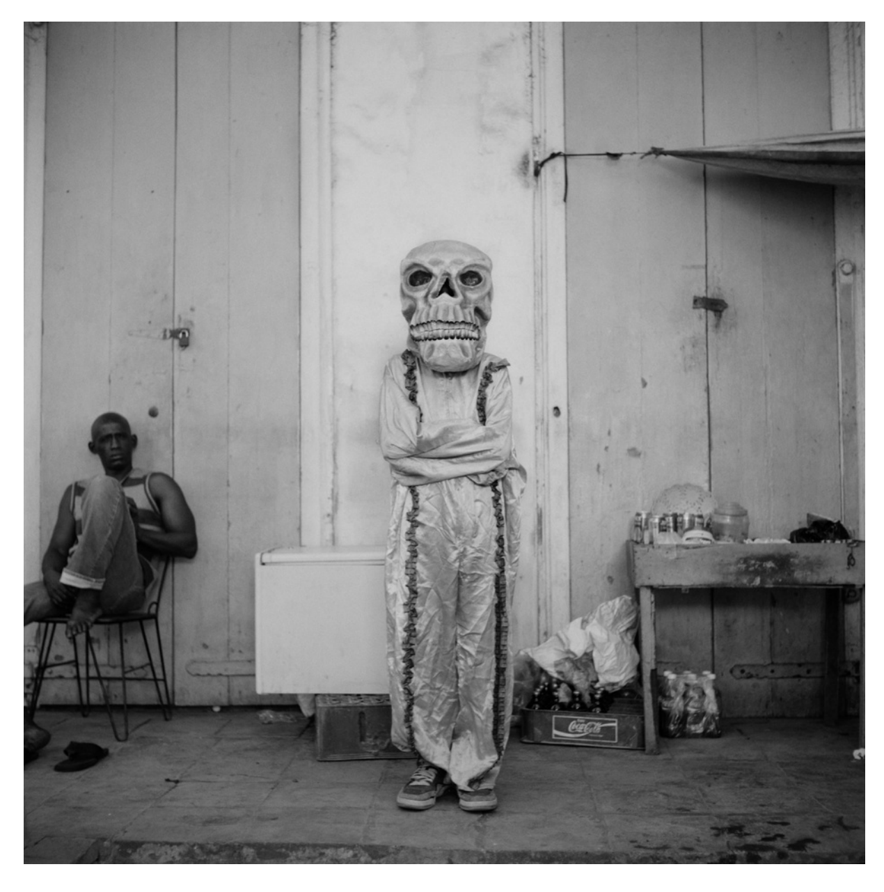
C-type Lambda prints on Fuji Crystal Archive paper from scans from black and white medium format analogue negatives

Edition of 5 plus 2 artist's proofs (ECFA1989)