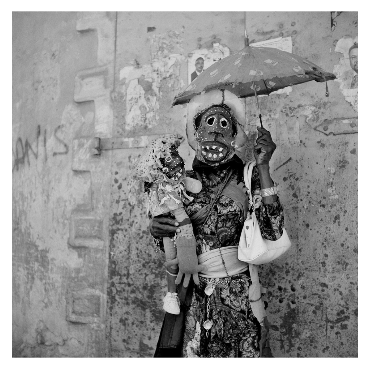
C-type Lambda prints on Fuji Crystal Archive paper from scans from black and white medium format analogue negatives