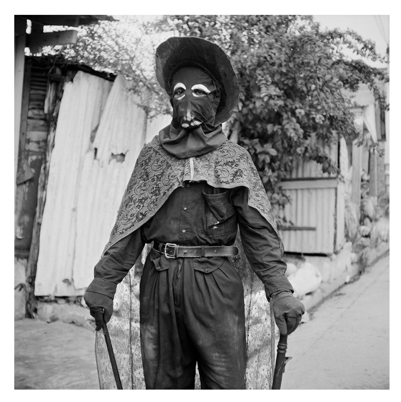
C-type Lambda prints on Fuji Crystal Archive paper from scans from black and white medium format analogue negatives

Edition of 5 plus 2 artist's proofs (ECFA2153)