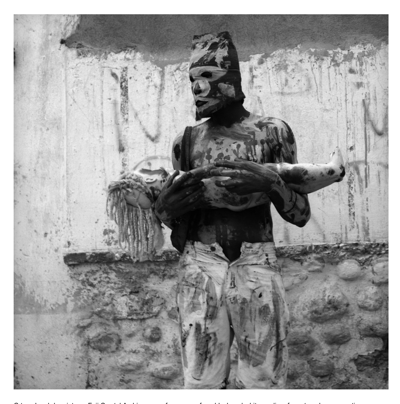
C-type Lambda prints on Fuji Crystal Archive paper from scans from black and white medium format analogue negatives

Edition of 5 plus 2 artist's proofs (ECFA2123)