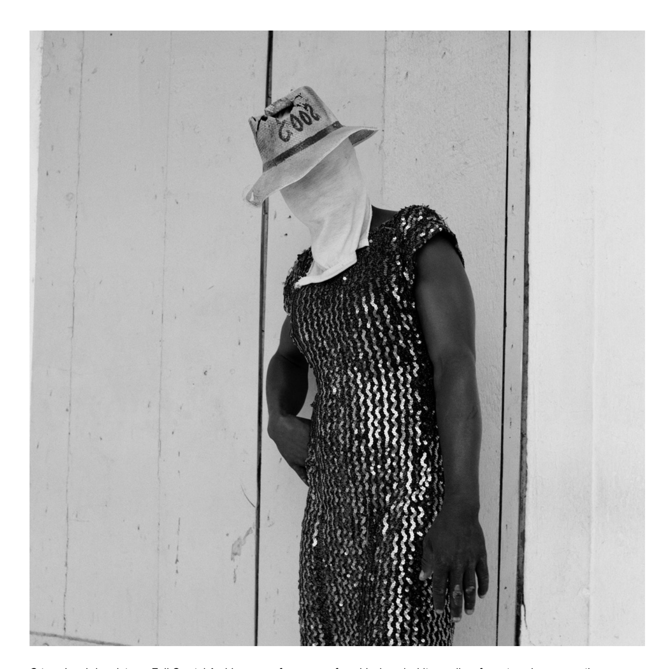
C-type Lambda prints on Fuji Crystal Archive paper from scans from black and white medium format analogue negatives 50 \times 50 \text{ cm} / 100 \times 100 \text{ cm}

Edition of 5 plus 2 artist's proofs (ECFA2156)