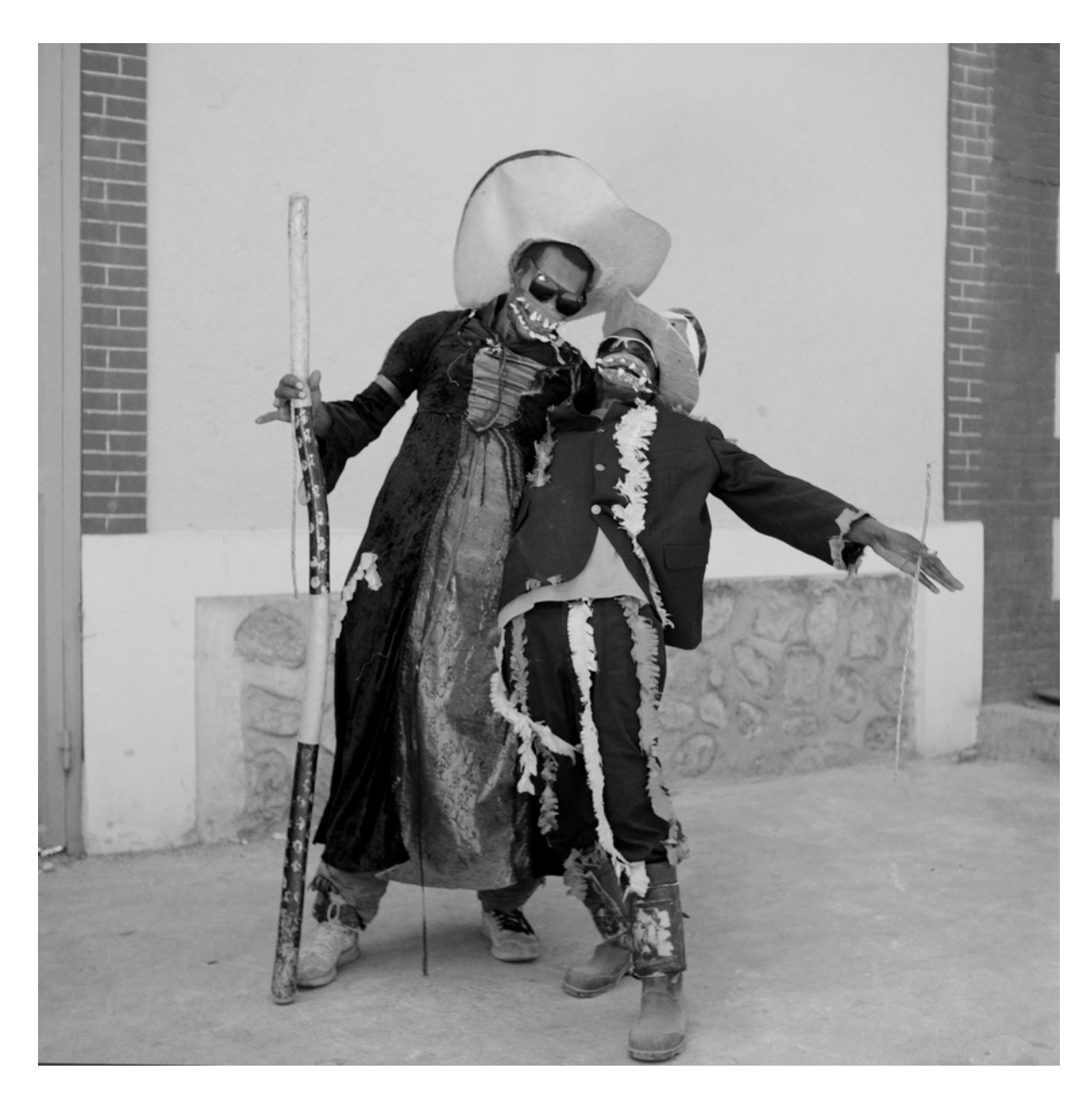
C-type Lambda prints on Fuji Crystal Archive paper from scans from black and white medium format analogue negatives 50 \times 50 \text{ cm} / 100 \times 100 \text{ cm}

Edition of 5 plus 2 artist's proofs (ECFA2165)