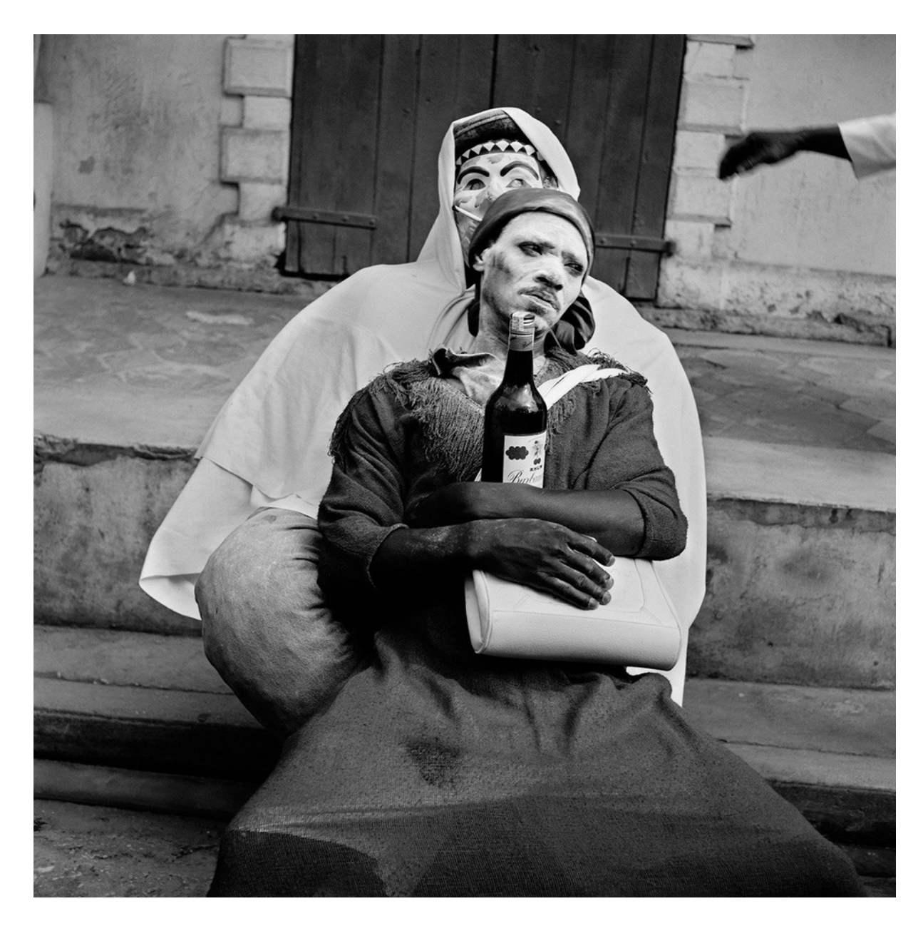
C-type Lambda prints on Fuji Crystal Archive paper from scans from black and white medium format analogue negatives

Edition of 5 plus 2 artist's proofs (ECFA2152)