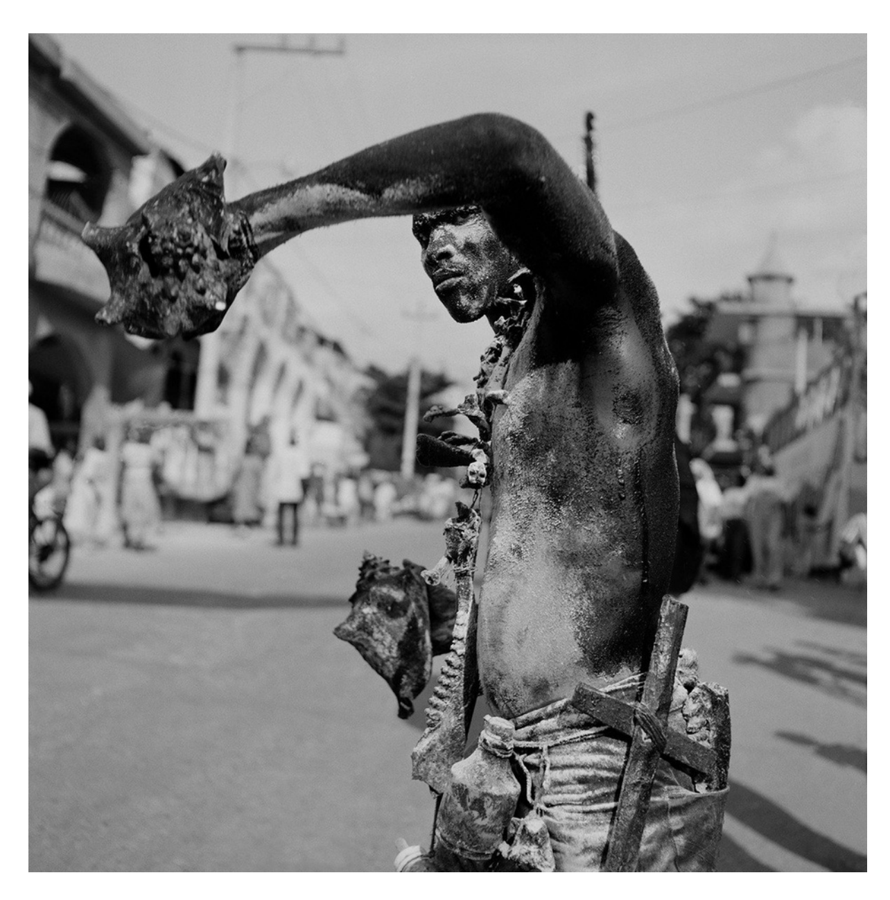
C-type Lambda prints on Fuji Crystal Archive paper from scans from black and white medium format analogue negatives

Edition of 5 plus 2 artist's proofs (ECFA2148)