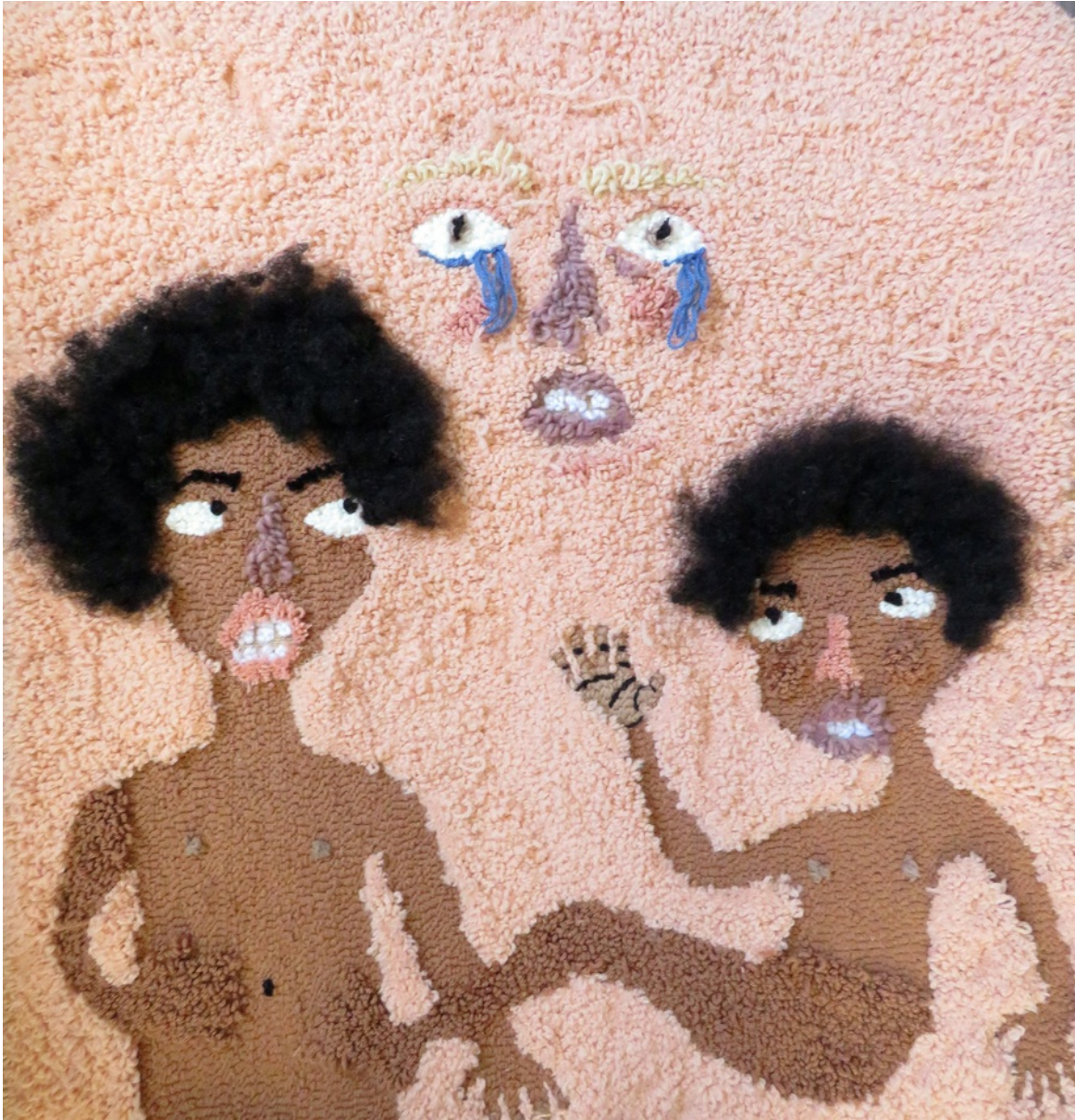
Wool, acrylic, cotton, human hair and synthetic hair on hessian 38 x 35 inches (ECFA1647)