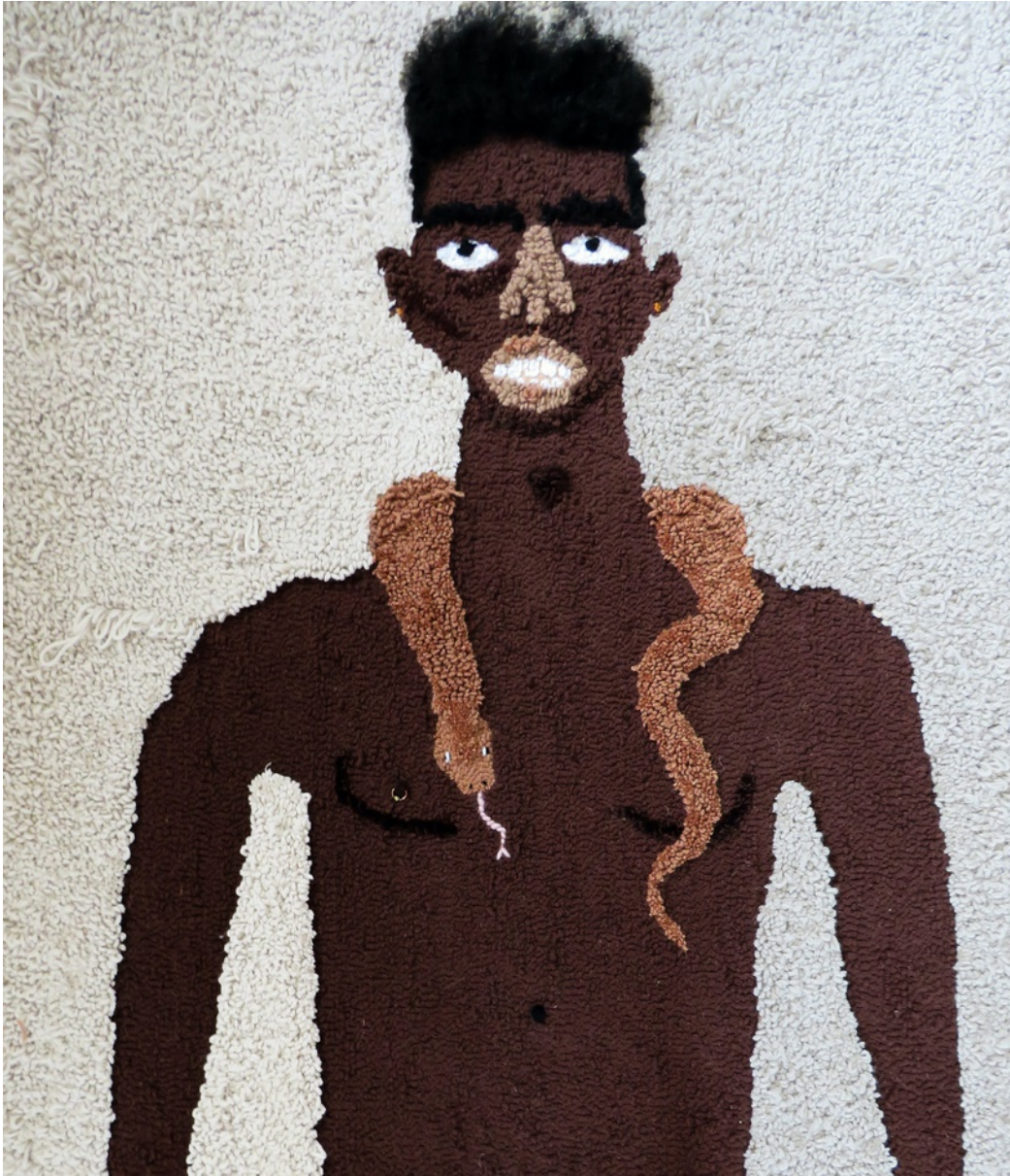
Acrylic, wool, human hair, synthetic hair and titanium on hessian 53 x 43 inches (ECFA1619)