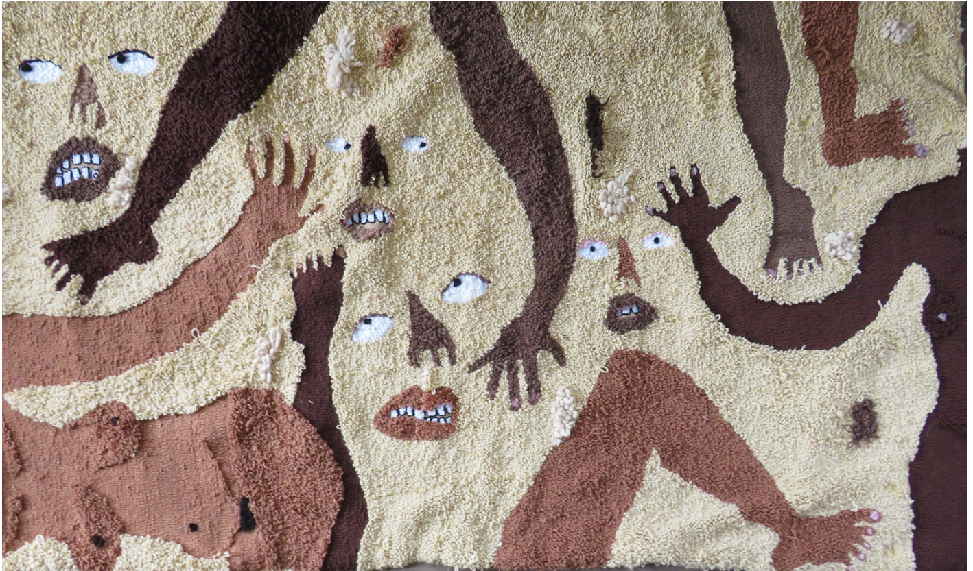
Acrylic, wool, human hair, kanekalon hair on hessian 56 x 94 inches (ECFA1648)