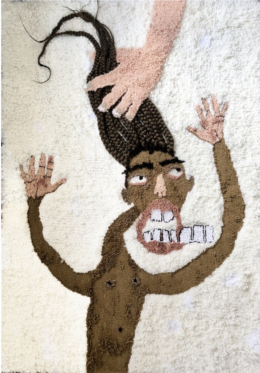
Acrylic, wool and synthetic hair on hessian 68 x 49 inches (ECFA1546)