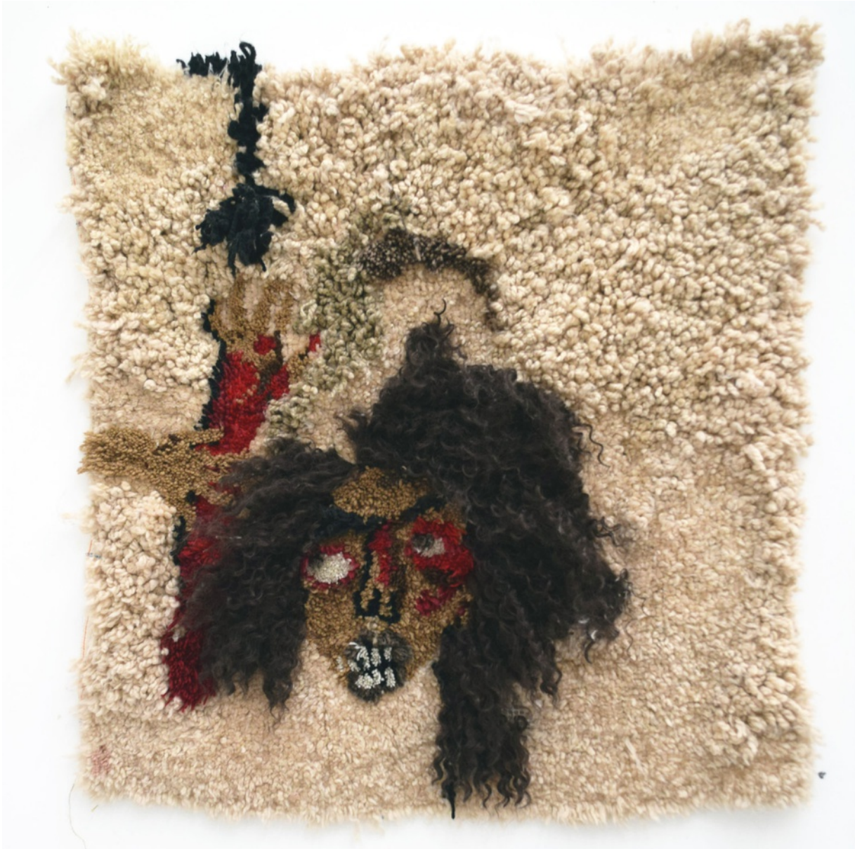
Latch hooked acrylic, wool, cotton and kanekalon hair and human hair on rug hooking canvas. 39 x 39 inches (ECFA1499)