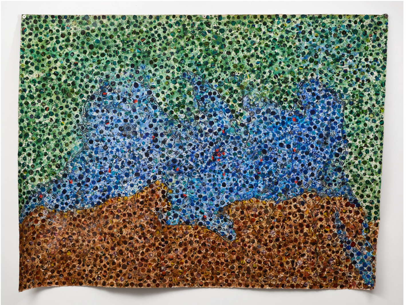
Acrylic paint, recycled fabric and stones on fabric 150 x 200 cm