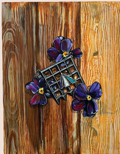
Alastair Gordon, Badge of Honour , oil and acrylic on canvas, 2026