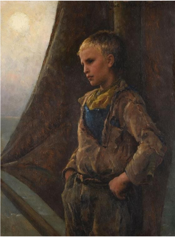
Fig. 1, Virginie Demont-Breton, Le mousse , oil on panel, 41 x 32 cm, Private Collection