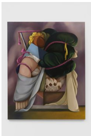
Diane Dal-Pra Everything You Built , 2020 Oil on linen 1620 x 1300mm (DDP-01)