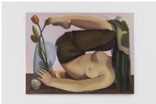
Diane Dal-Pra Una Vita Così , 2019 Oil on linen 970 x 1300mm (DDP-07)