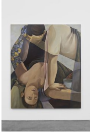
Diane Dal-Pra La Caduta , 2019 Oil on linen 1800 x 1600mm (DDP-05)

For full details and larger images, please see the end of this document.