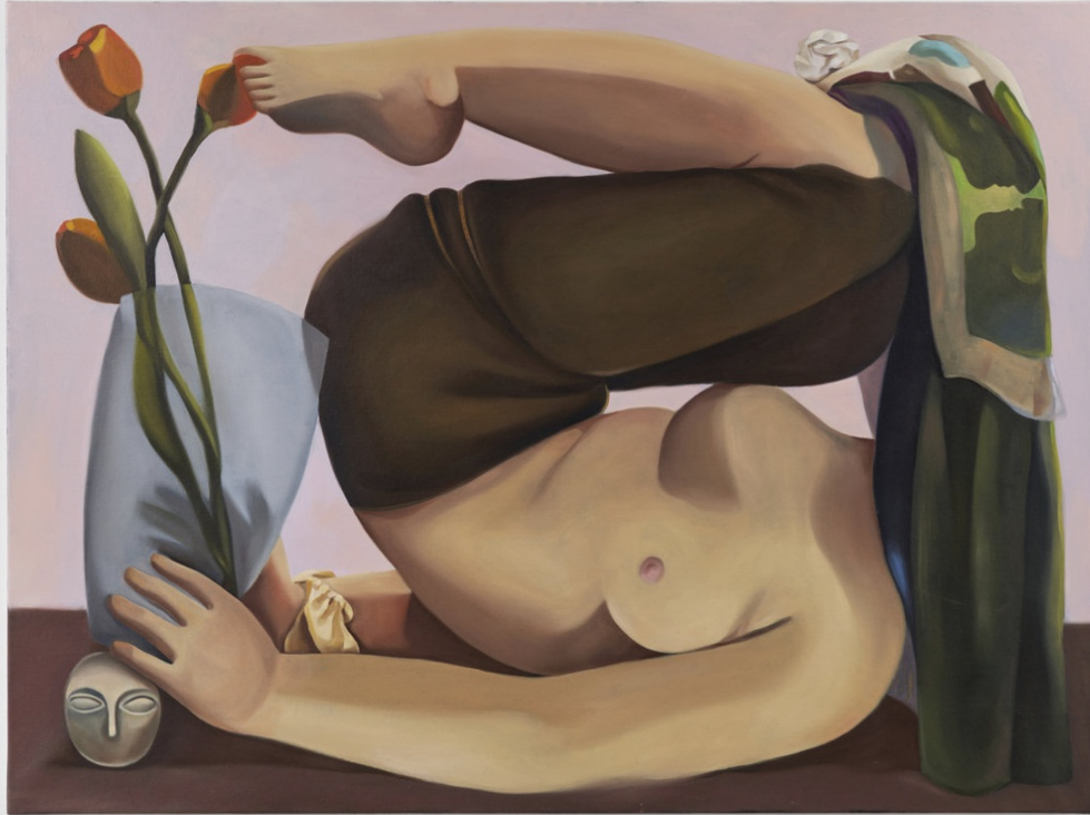
Oil on linen 970 x 1300mm (DDP-07)