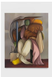
Diane Dal-Pra Very You She Said , 2020 Oil on linen 1620 x 1300mm (DDP-04)