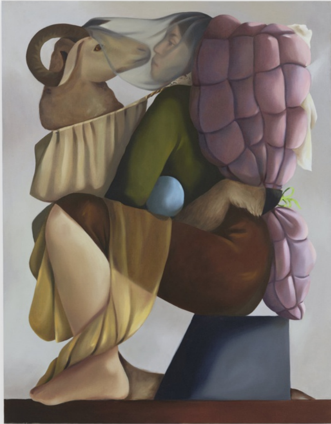
Oil on linen 1460 x 1140mm (DDP-02)