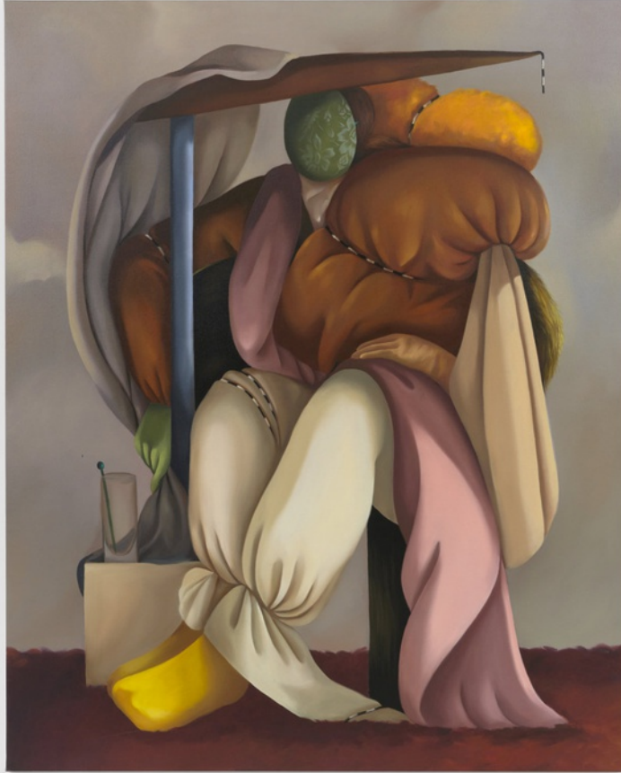
Oil on linen 1620 x 1300mm (DDP-04)