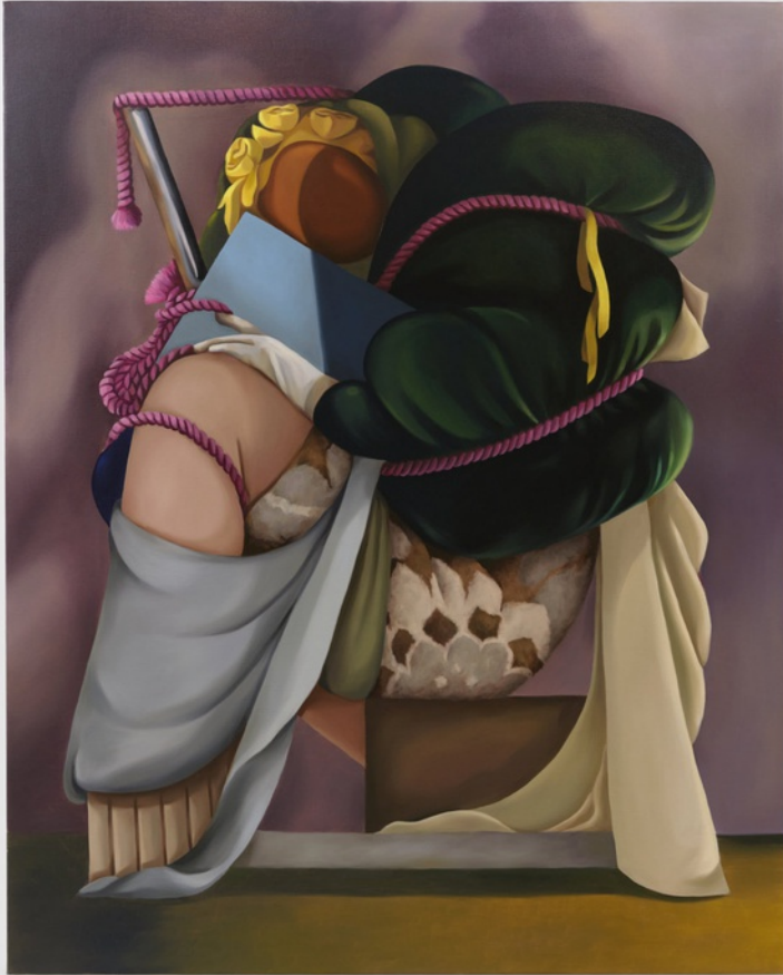
Oil on linen 1620 x 1300mm (DDP-01)

DIANE DAL-PRA Everything You Built , 2020