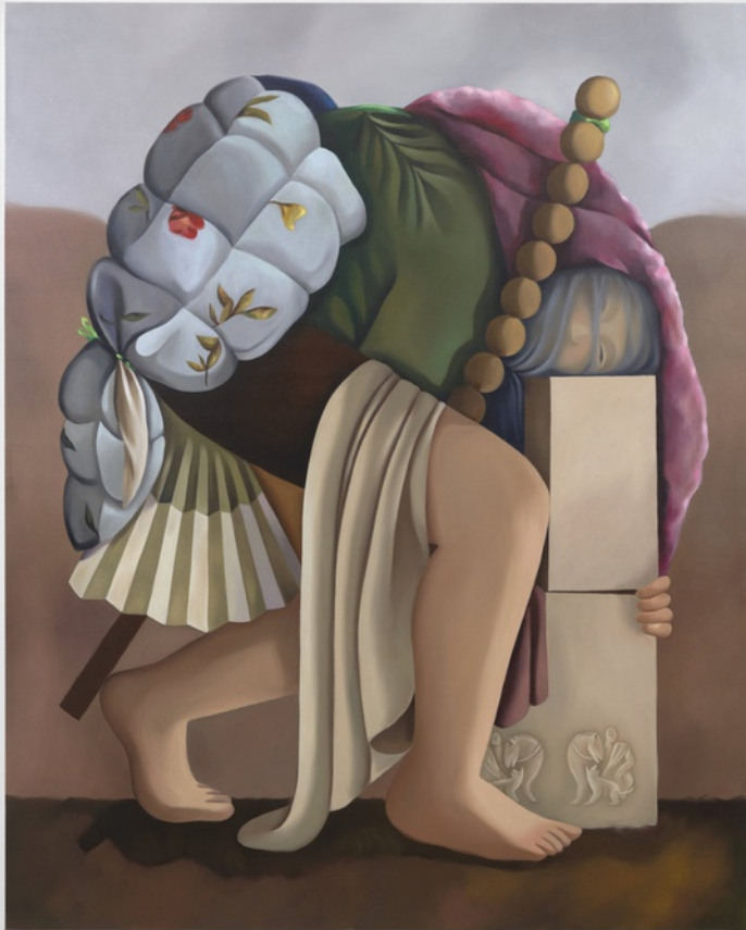
Oil on linen 1620 x 1300mm (DDP-03)

DIANE DAL-PRA Your Readable Story , 2020