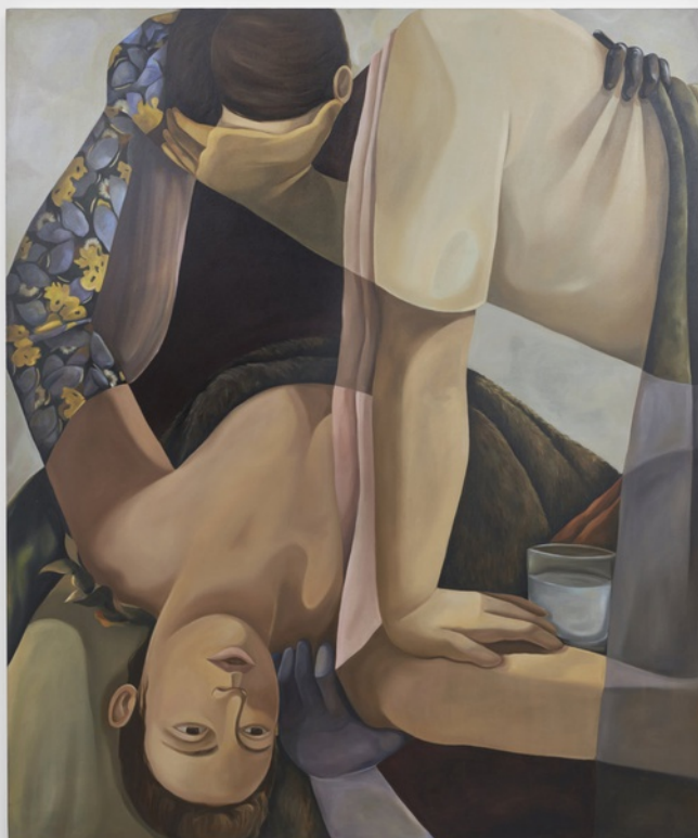
Oil on linen 1800 x 1600mm (DDP-05)