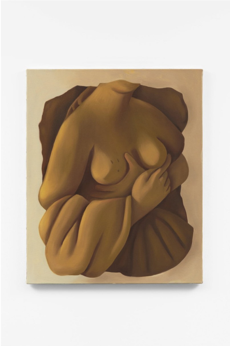
Oil on linen 610 x 500mm (DDP-06)