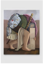
Diane Dal-Pra Your Readable Story, 2020 Oil on linen 1620 x 1300mm (DDP-03)