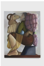
Diane Dal-Pra It Belongs To You , 2020 Oil on linen 1460 x 1140mm (DDP-02)