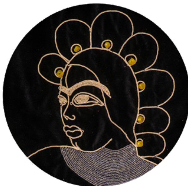
Golden thread, yellow pearls (yellow agate), silver pearls