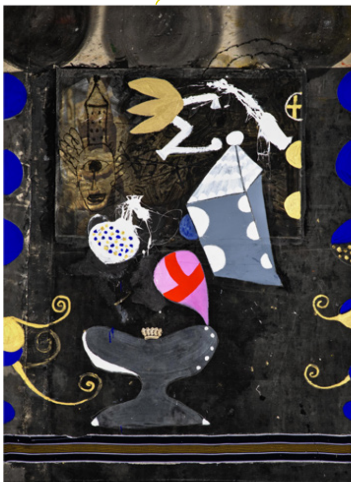
Ouattara Watts, La Dama #1 , 2019