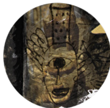
A silkscreen printing: it is the printing with a stencil of an image on a support. Here, Ouattara Watts printed the image on fabric, then glued the fabric to the canvas and drew a face on it.