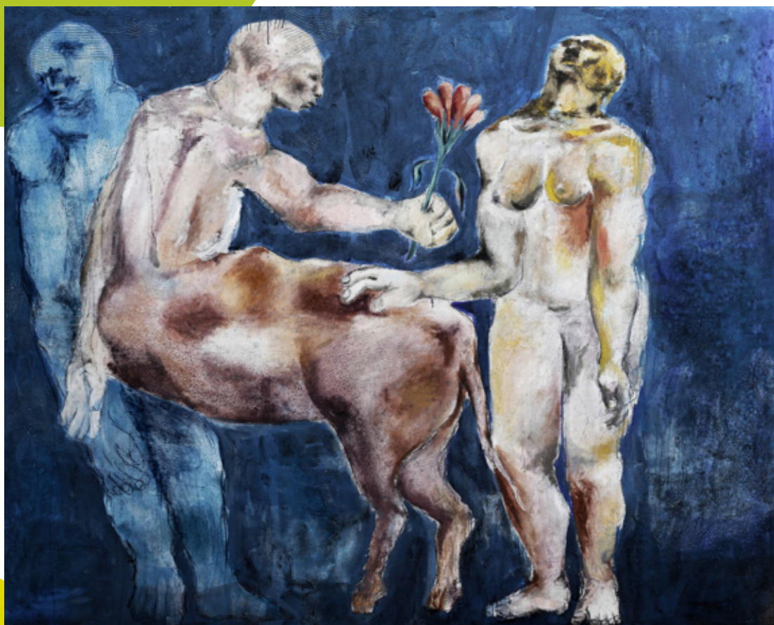
Sadikou Oukpedjo, Nouvelle mythologie #3 , 2020