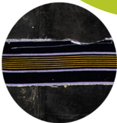
At the bottom of the canvas, a piece of Baoulé fabric, a people from Ivory Coast

For this work, Ouattara Watts used many different materials.