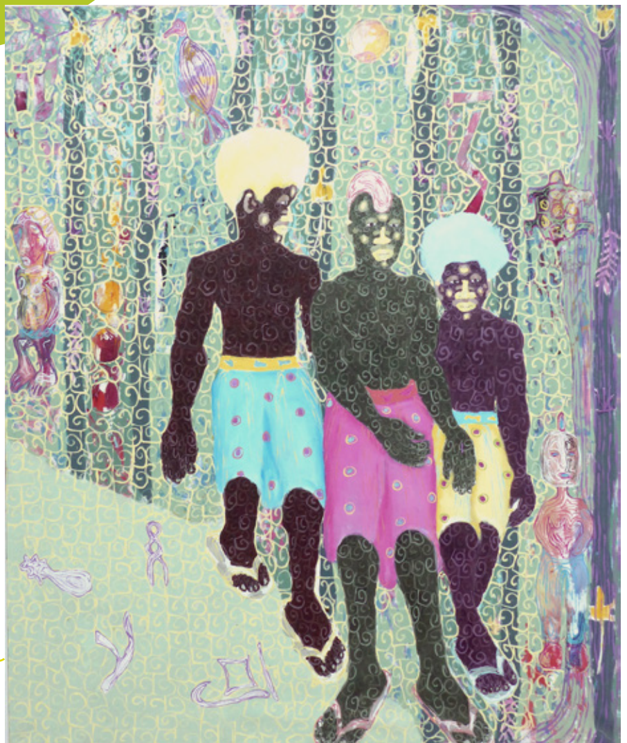
Kassou Seydou, Bou for yombe, toki yomb , 2019

In Senegal, where Kassou Seydou lives, two languages are spoken: French and Wolof. The title of the work means: 'If picking up becomes easy, bending becomes difficult'.