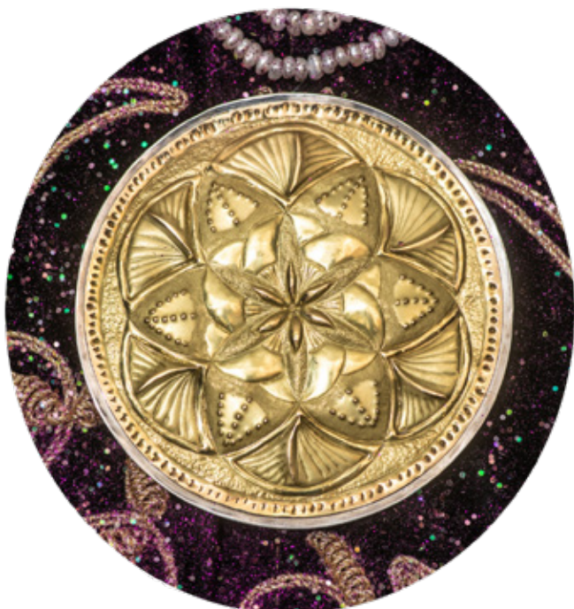
A gold medallion, sequins, transparent freshwater pearls