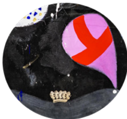
A piece of crochet that the artist cut out