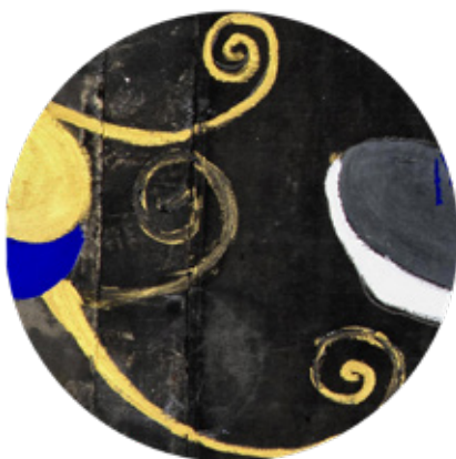
Golden paint and natural blue pigments