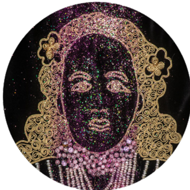
Golden thread, sequins, medium sized pink pearls and small transparent freshwater pearls