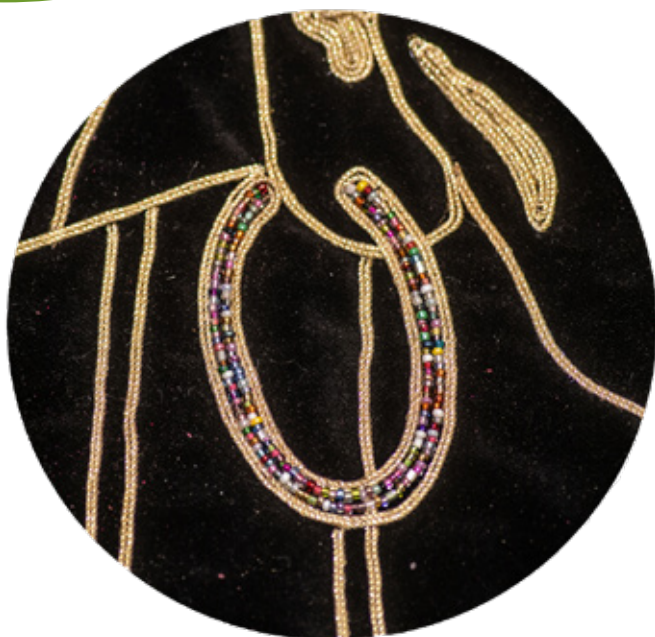
Coloured pearls, golden thread