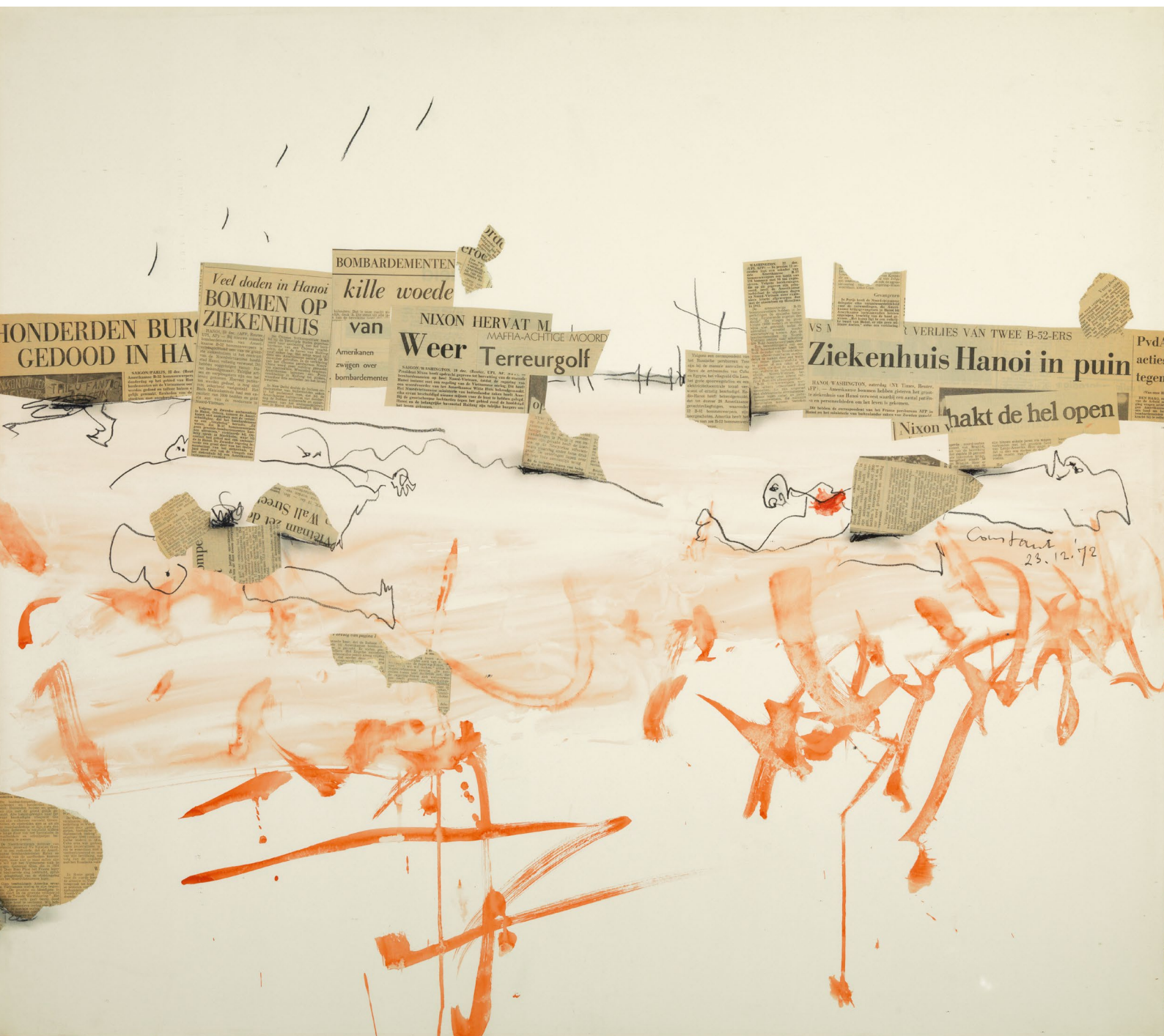
Bommen op Ziekenhuis / Bombs on Hospital, 1972 Watercolor, chalk, newspaper clippings, paper 91 x 103 cm Signed and dated "Constant 23.12.'72" center right in pencil on sanguine fond