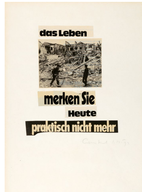
Nixon musste etwas tun / Nixon Has to Do Something, 1972 Newspaper clippings, paper 38,9 x 26,8 cm Signed and dated "Constant 4.12.'72" bottom right in pencil on white fond