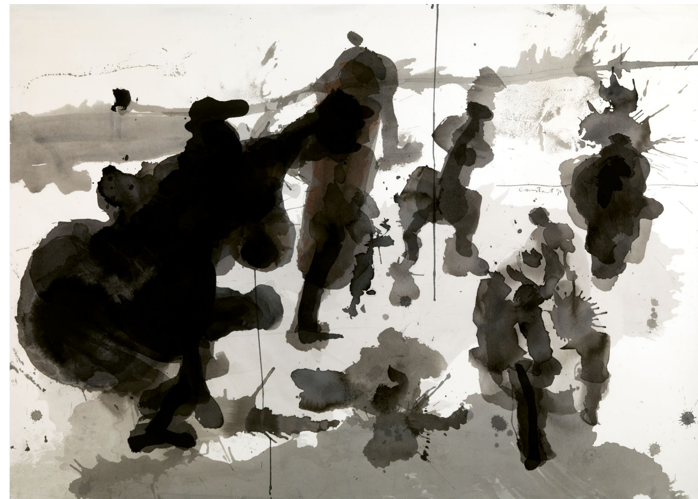
Mensen in de Sneeuw / Group Figures , 1971 Washed ink, paper 74,5 x 104 cm Signed and dated "Constant '71" right from the center in pencil on white fond