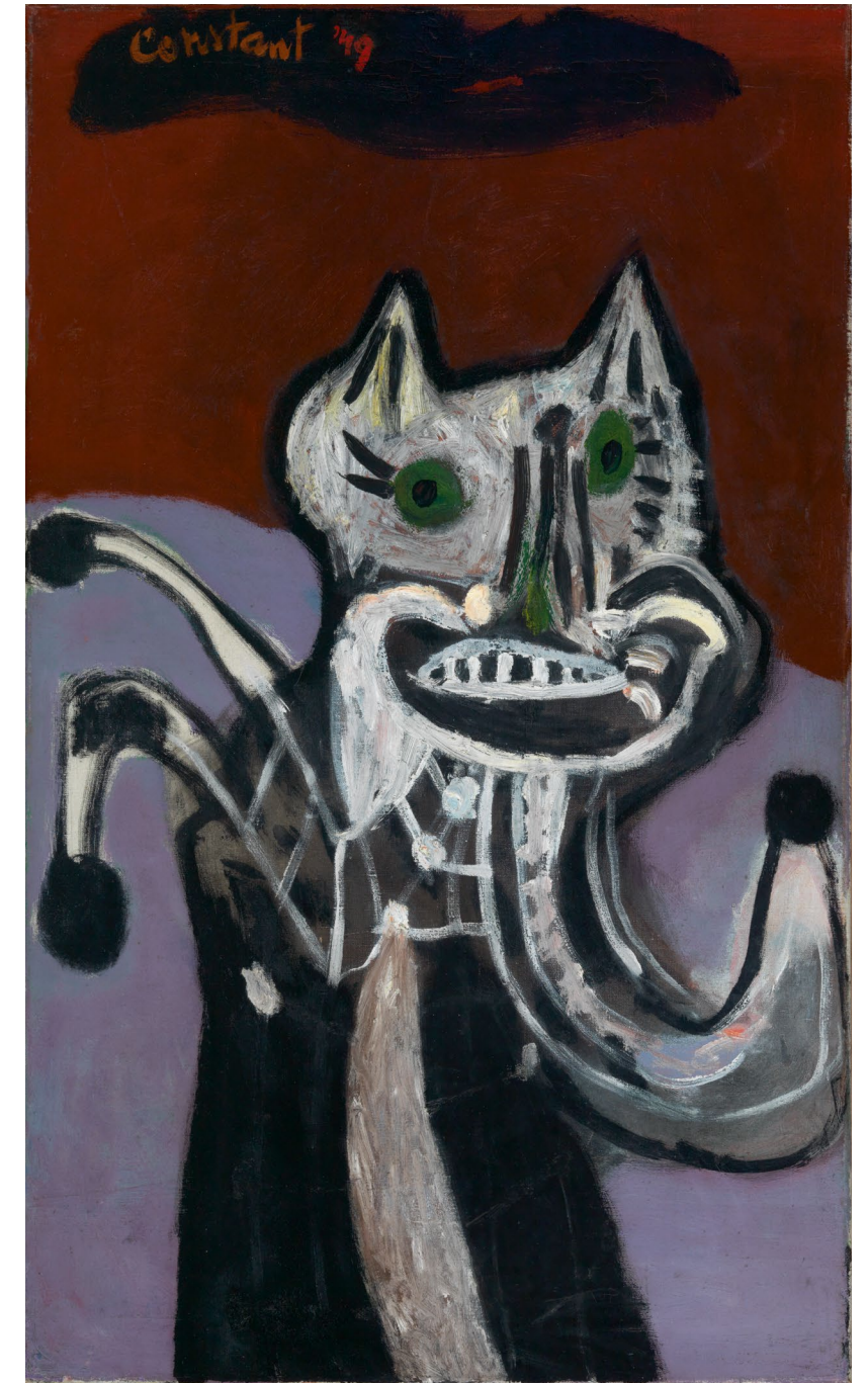
Kat / Cat , 1949 Oil paint, linen 99,7 x 60,5 cm Signed and dated "Constant '49" top left in redbrown paint on black fond