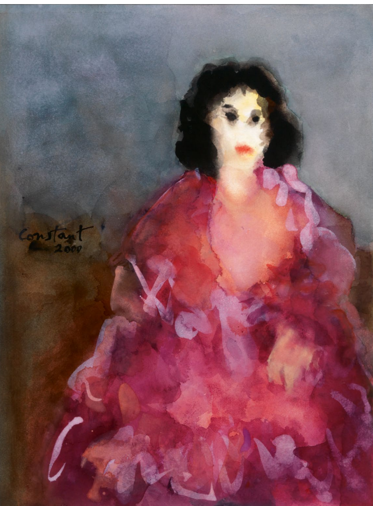
Lola de Valence , 2000 Watercolor, paper 55 x 40 cm Signed and dated "Constant 2000" center left in black watercolor