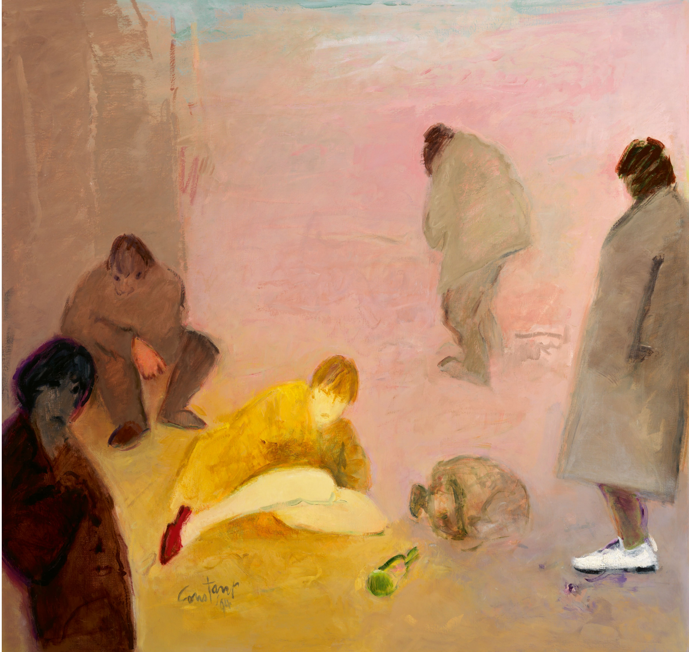
Junkies , 1994 Oil paint, linen 185 x 194 cm Signed and dated "Constant '94" bottom left in green paint on green ochre fond