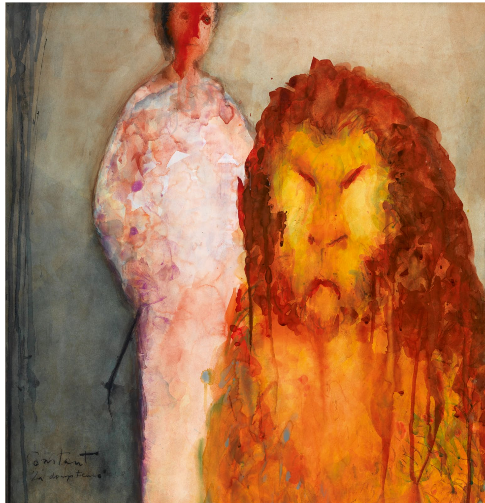
La Dompteuse / The Lion Tamer , 1981 Watercolor, paper 73 x 70 cm Signed and titled "Constant" bottom left in black ink on blue/green fond