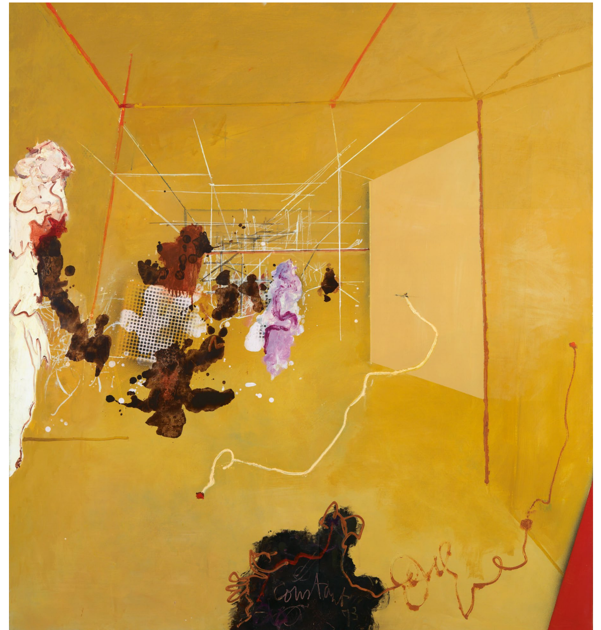
Happening, 1973 Oil paint, linen 139,8 x 130 cm Signed and dated "Constant '73" bottom center in white paint on black fond