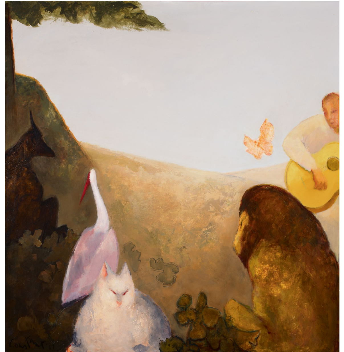
Orpheus I , 1981 Oil paint, linen 100 x 105 cm Signed and dated "Constant '81" bottom left in black paint on black/green fond