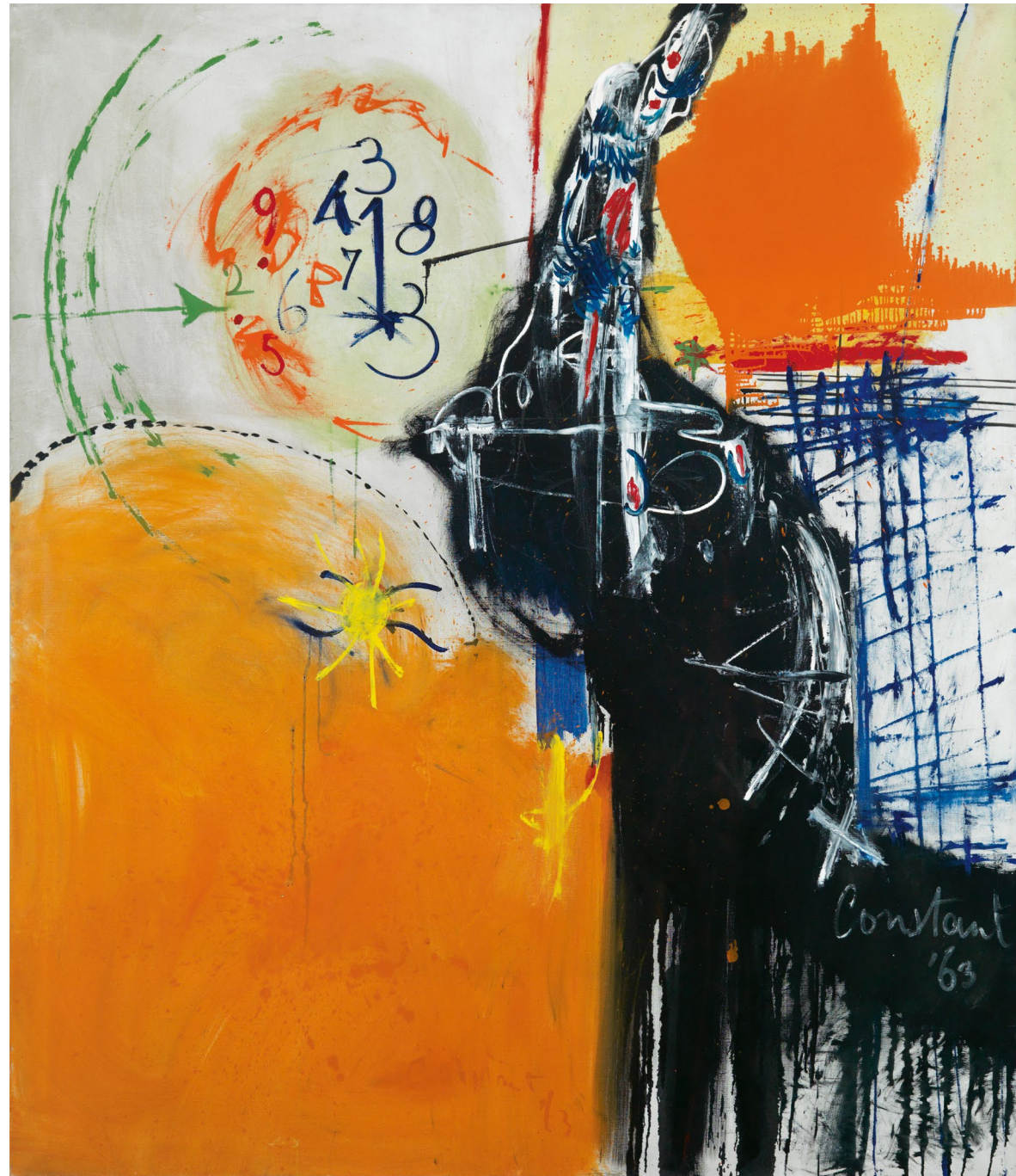
De Labyrist / The Labyrist , 1963 Oil paint, linen 185 x 162 cm Signed and dated "Constant '63" bottom right in white paint on black fond