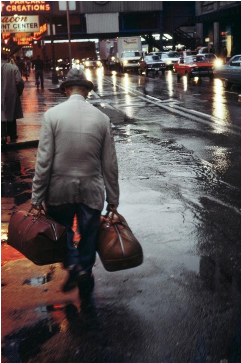
Stamped with photographer's copyright ink stamp and signed by John Maloof, dated and numbered on reverse Chromogenic print, printed later Printed on 20 x 16 inch paper From an edition of 15 (BHC3747)