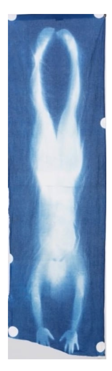
Cyanotype on cotton 233 x 66 cm (MEIS002)