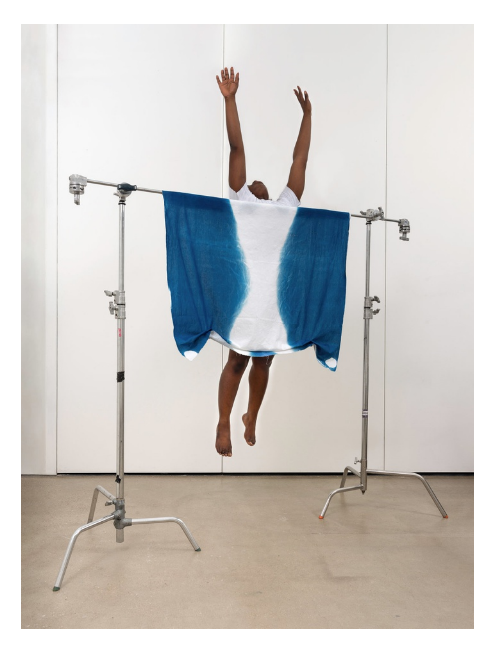
C-type print on Deep Matte, mounted, framed with museum glass 79.5 \times 59.5 \text{ cm} edition of 5 + 2 AP (MEIS006)