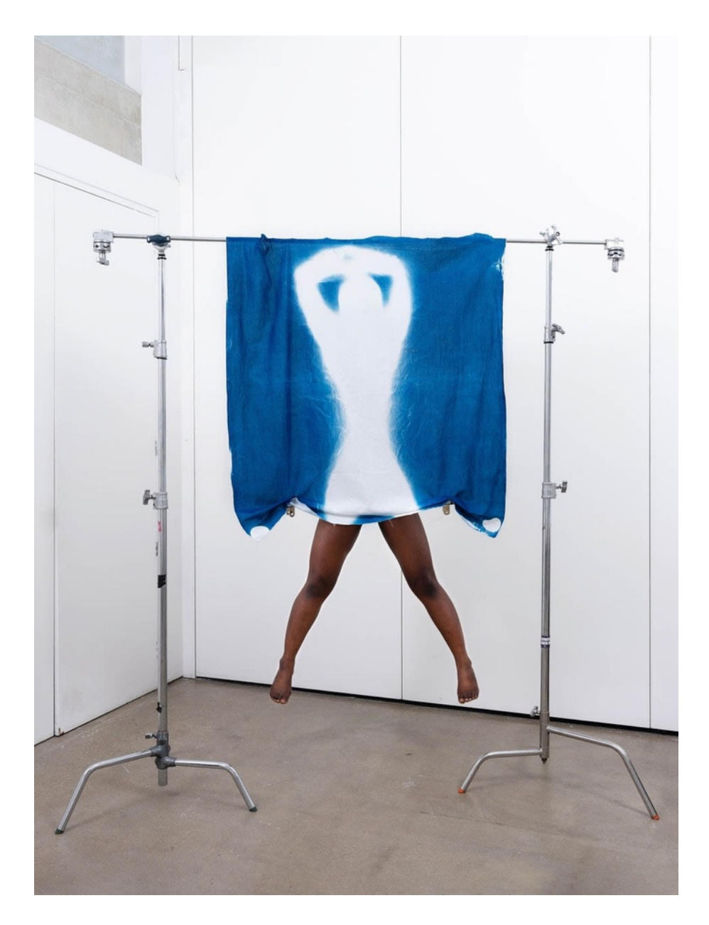
C-type print on Deep Matte, mounted, framed with museum glass 79.5 \times 59.5 \text{ cm} edition of 5 + 2 AP (MEIS003)