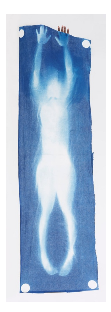
C-type print on Deep Matte, mounted, framed with museum glass, 119.5 x 42 cm edition of 5 + 2 AP (MEIS001)