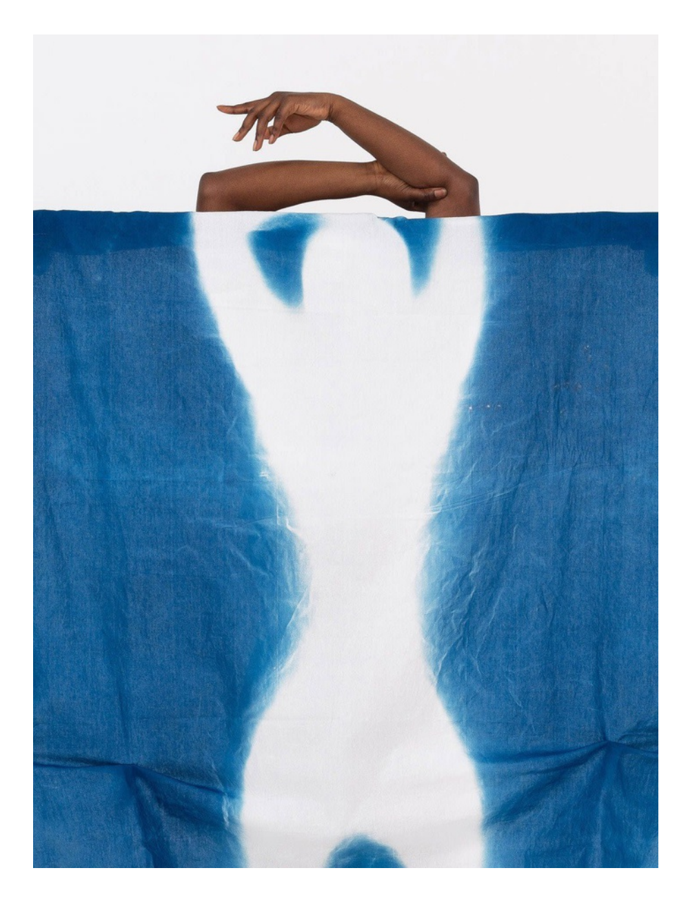
C-type print on Deep Matte, mounted, framed with museum glass 79.5 \times 59.5 \text{ cm} edition of 5 + 2 AP (MEIS005)