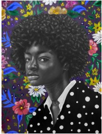
Ibim Coockey A woman in her Glory , 2022 Charcoal and Acrylic on Paper 85 x 59,5 cm (IBCO001)

For full details and larger images, please see the end of this document.