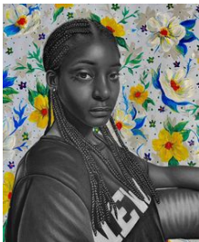
Ibim Coockey PORTRAIT OF GRACE , 2022 Charcoal and acrylic on paper 79 x 59,5 cm (IBCO003)