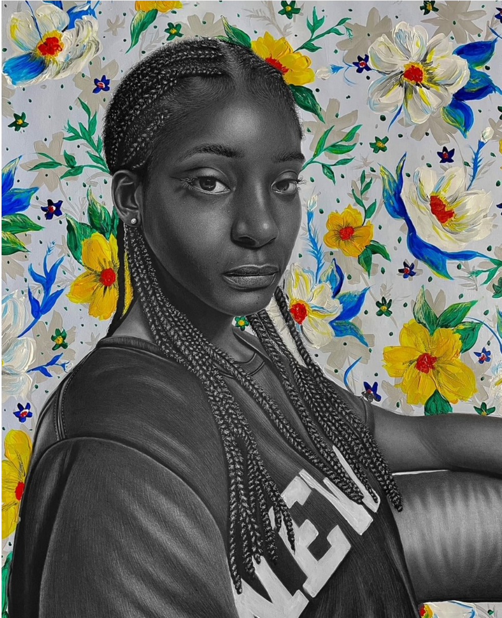
Charcoal and acrylic on paper 79 x 59,5 cm (IBCO003)