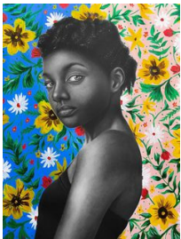
Ibim Coockey Gift , 2022 Charcoal and Acrylic on Paper 87,6 x 60 cm (IBCO002)