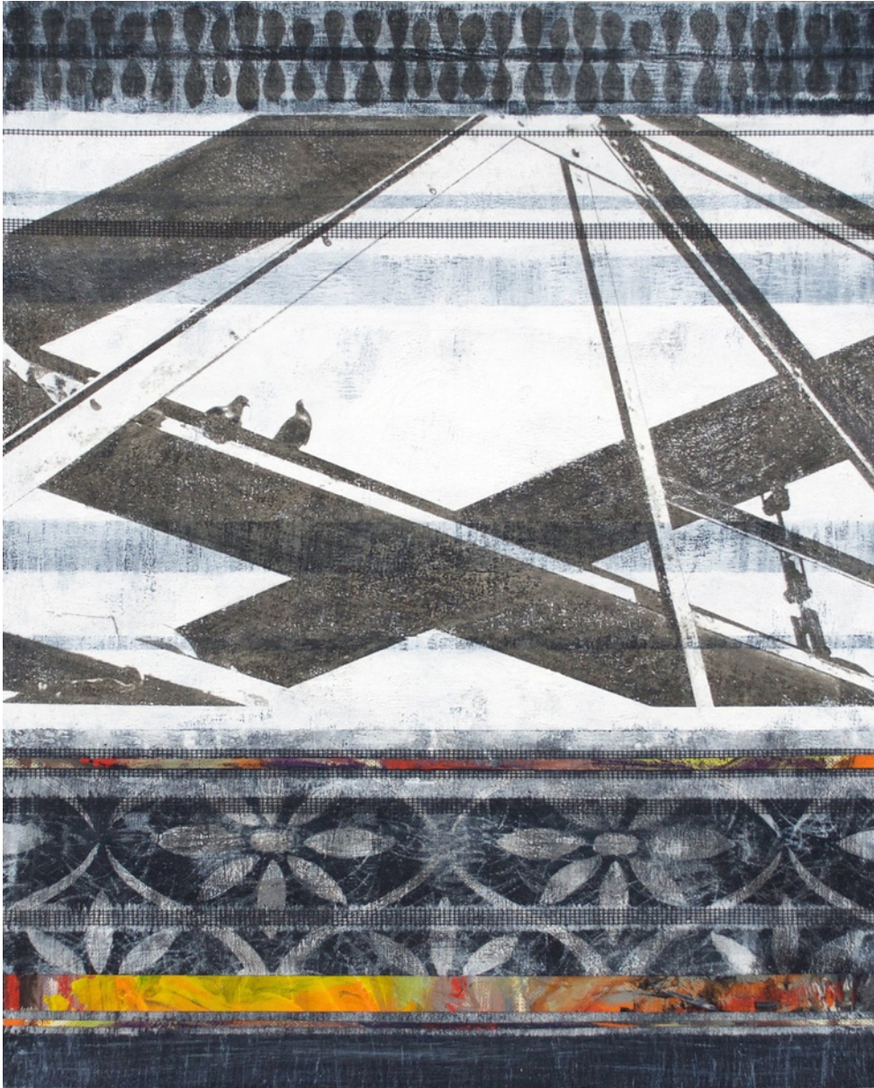
Signed on verso Mixed media, found papers, fiberglass mesh on wood panel 20 x 16 in. (HH032)