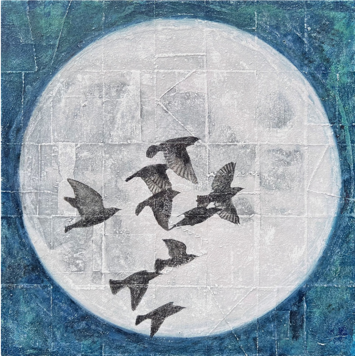
Signed on verso Mixed media, found papers and thread on wood panel 18 x 18 in. (HH129)