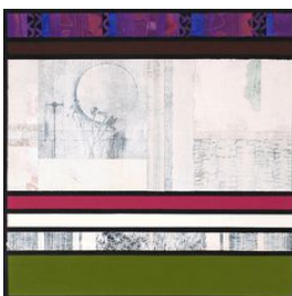
Holly Harrison Harvest Moon Signed on verso Mixed media and found papers on wood panel 16 x 16 in. (HH132)