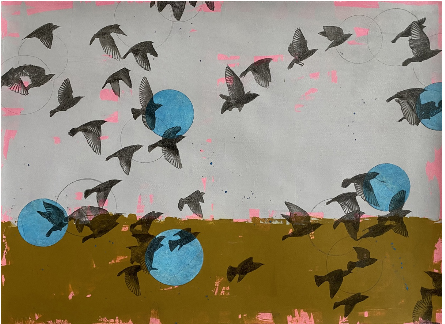
Signed on verso Mixed media on Arches paper 22 x 30 in. (HH112)