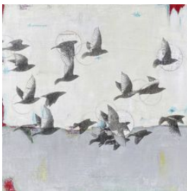
Holly Harrison Murmur (Gray and White) , 2020 Signed on verso Mixed media and found papers on wood panel 12 x 12 in. (HH104)