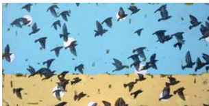
Holly Harrison Lovely Day , 2021 Signed on verso Mixed media and found papers on wood panel 36 x 72 in. (HH120)