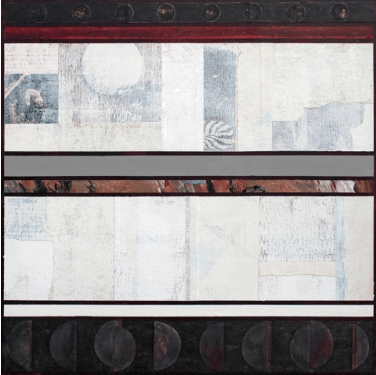
Signed on verso Mixed media and found papers on wood panel 24 x 24 in. (HH131)