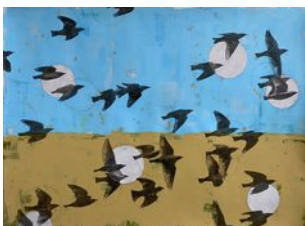
Holly Harrison Sunny Day Murmur , 2021 Signed on verso Mixed media on Arches paper 22 x 30 in. (HH118)