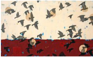
Holly Harrison Over the Red Earth , 2022 Mixed media and found papers on wood panel 36 x 60 in. (HH125)