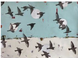
Holly Harrison Snowy Day Murmur , 2021 Signed on verso Mixed media on Arches paper, framed 22 x 30 in. Framed: 25 x 33 x 1.5 in. (HH117)