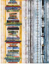
Holly Harrison Realigned , 2018 Signed on verso Mixed media, found papers, fiberglass mesh on wood panel 40 x 30 in. (HH082)