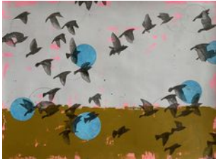
Holly Harrison Murmur (Pink and Ochre) , 2021 Signed on verso Mixed media on Arches paper 22 x 30 in. (HH112)