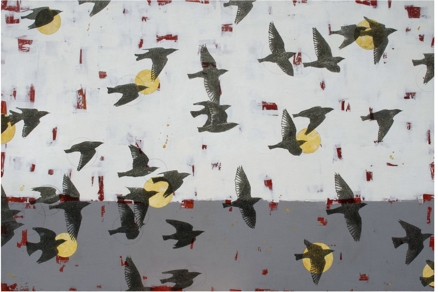
Signed on verso Mixed media and found papers on wood panel 40 x 60 in. (HH121)