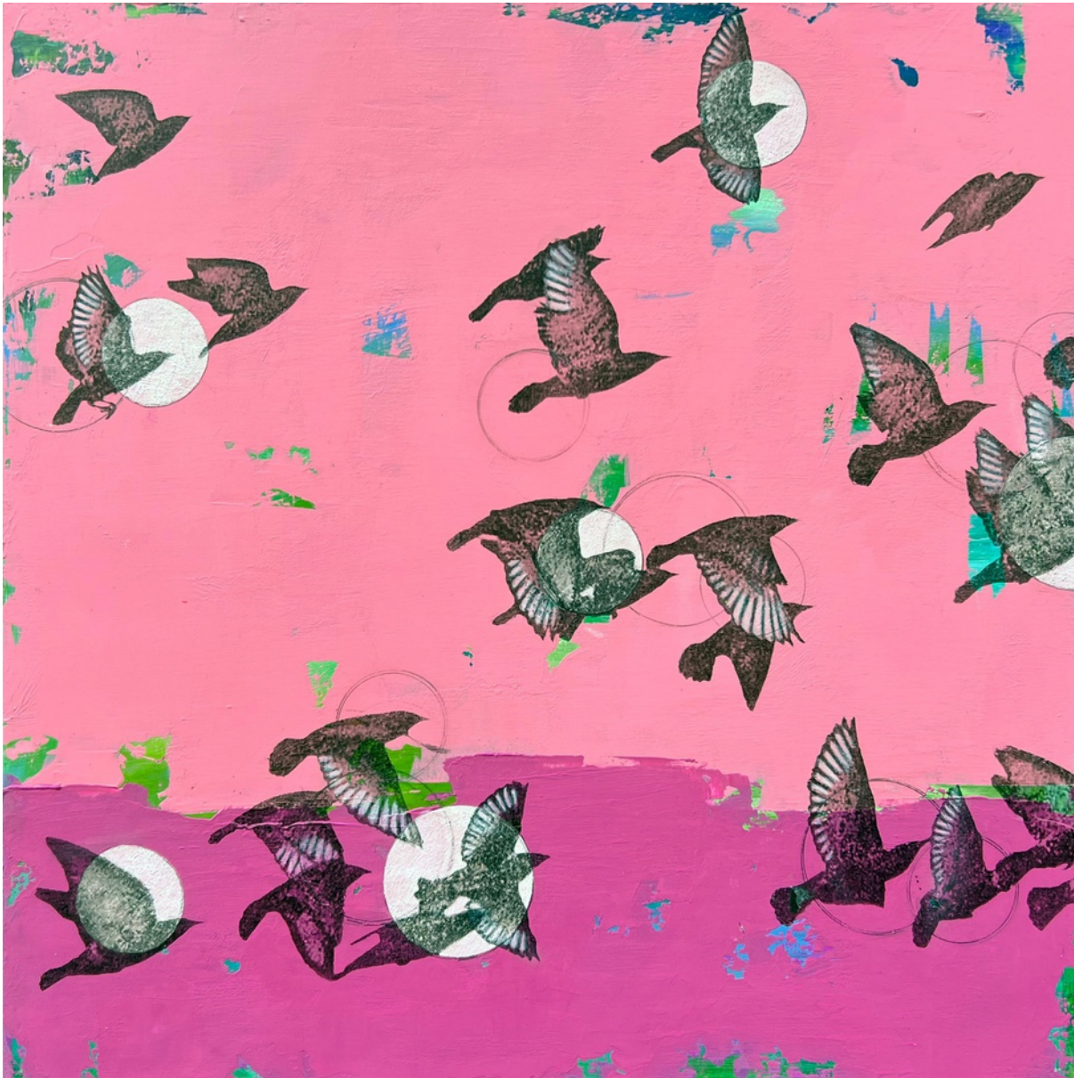
Signed on verso Mixed media and found papers on wood panel 16 x 16 in. (HH130)