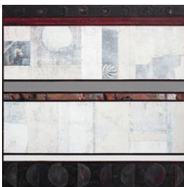
Holly Harrison Moon Shadow Signed on verso Mixed media and found papers on wood panel 24 x 24 in. (HH131)