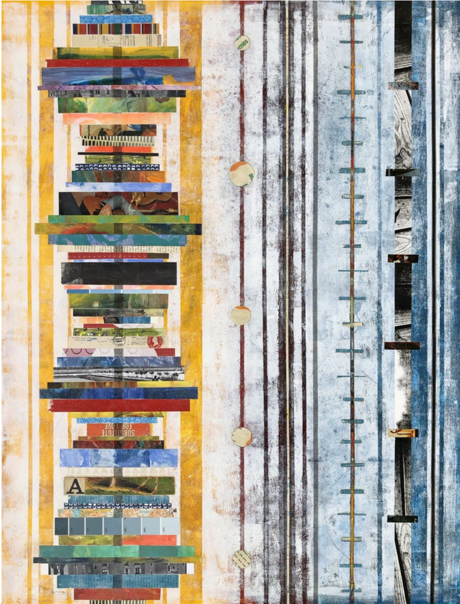
Signed on verso Mixed media, found papers, fiberglass mesh on wood panel 40 x 30 in. (HH082)