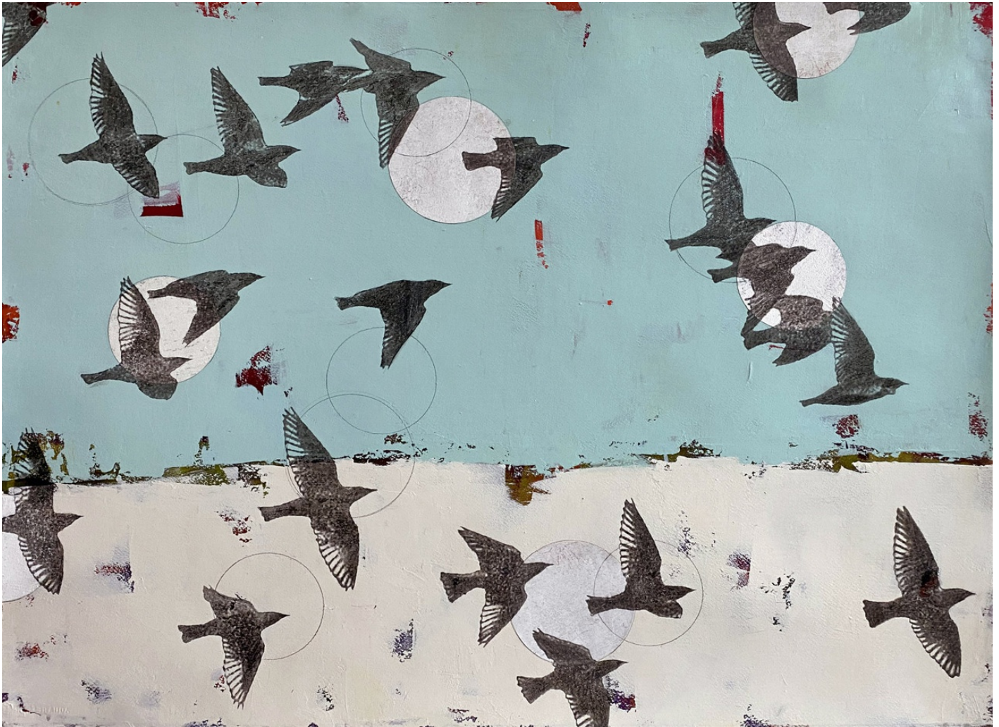
Signed on verso Mixed media on Arches paper, framed 22 x 30 in. Framed: 25 x 33 x 1.5 in. (HH117)