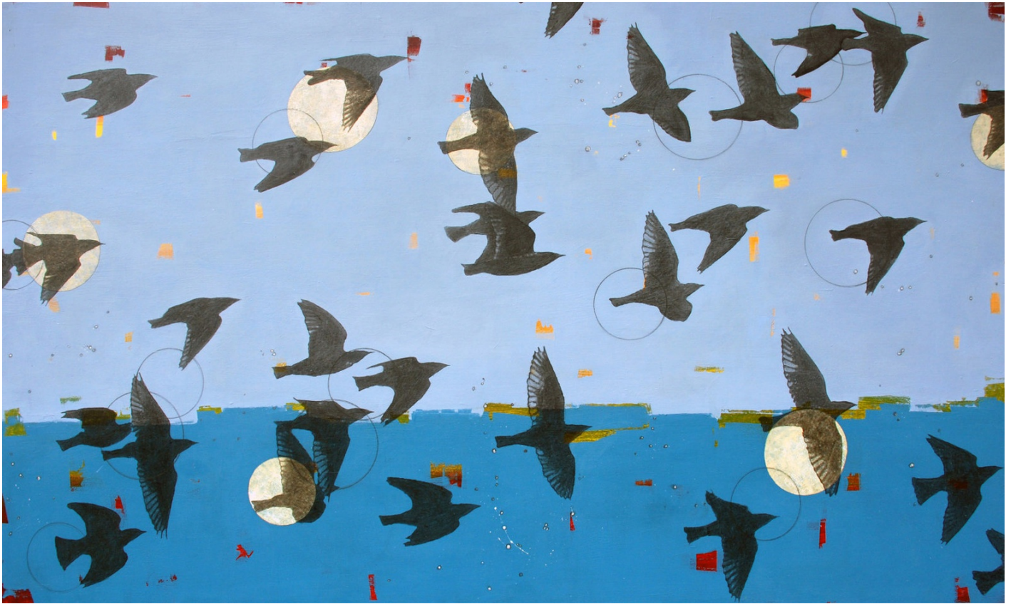
Mixed media and found papers on wood panel 36 x 60 in. (HH126)