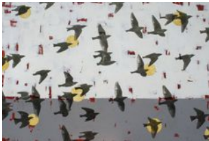
Holly Harrison The Theater of Air , 2021 Signed on verso Mixed media and found papers on wood panel 40 x 60 in. (HH121)