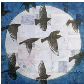
Holly Harrison Paper Moon , 2018 Signed on verso Mixed media, found papers, thread, fiberglass mesh on wood panel 18 x 18 in. (HH081)