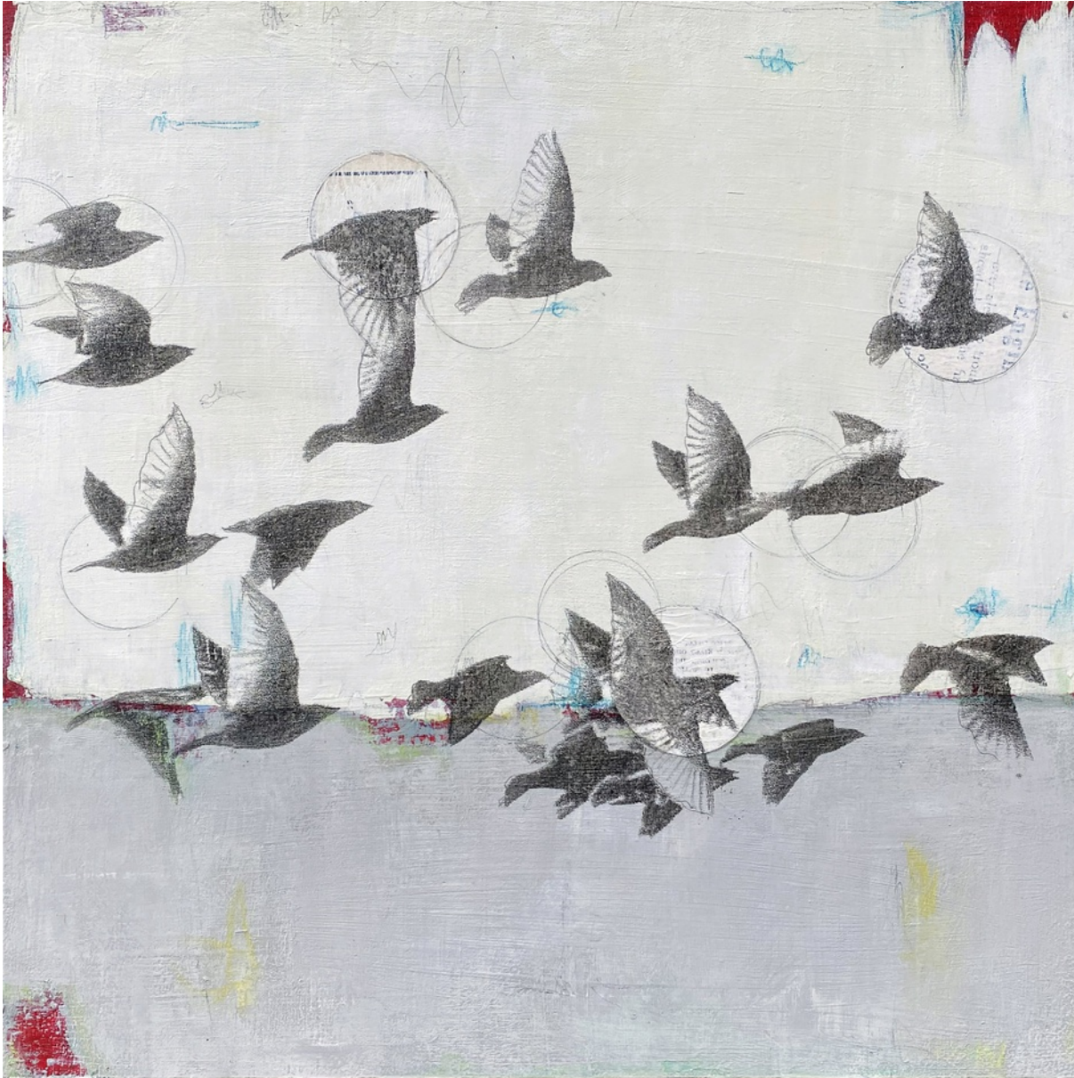
Signed on verso Mixed media and found papers on wood panel 12 x 12 in. (HH104)