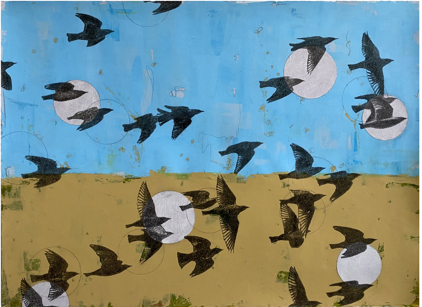
Signed on verso Mixed media on Arches paper 22 x 30 in. (HH118)