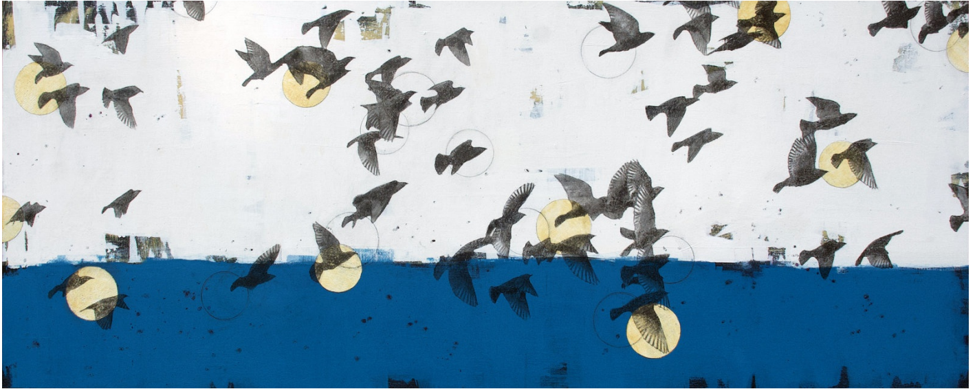
Signed on verso Mixed media and found papers on wood panel 16 x 40 in. (HH123)