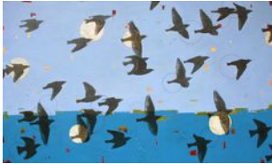
Holly Harrison True Blue , 2022 Mixed media and found papers on wood panel 36 x 60 in. (HH126)