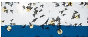
Holly Harrison Sea of Love , 2021 Signed on verso Mixed media and found papers on wood panel 16 x 40 in. (HH123)