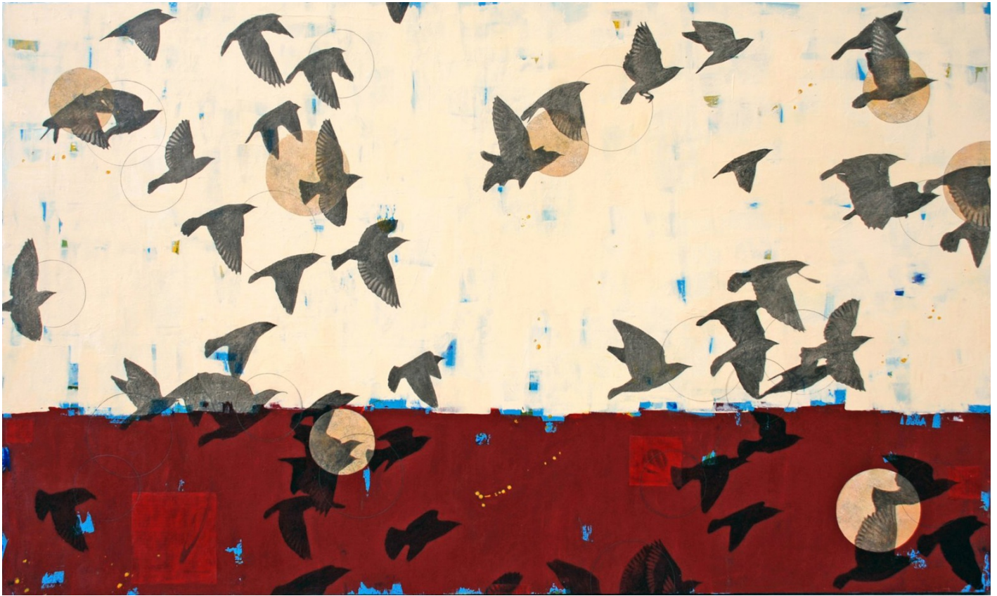
Mixed media and found papers on wood panel 36 x 60 in. (HH125)