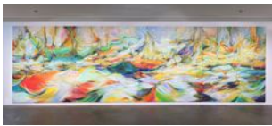
Natalia Wróbel We Are All Made of Light , 2018 Signed on verso Oil on canvas 96 x 320 in. (NW112)

For full details and larger images, please see the end of this document.