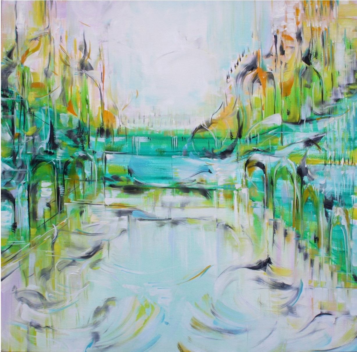
Signed on verso Oil on canvas 30 x 30 in. (NW111)