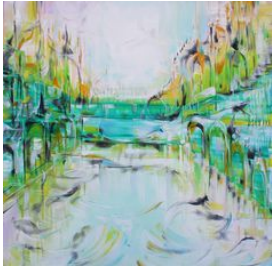
Natalia Wróbel Sky to Ground, 2017 Signed on verso Oil on canvas 30 x 30 in. (NW111)