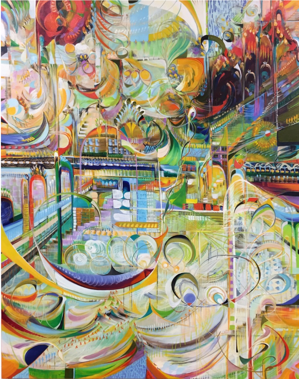
Signed on verso Oil on canvas 60 x 48 in. (NW110)