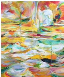
Natalia Wróbel Ancient Steppes , 2018 Signed on verso Oil on canvas 72 x 60 in. (NW109)