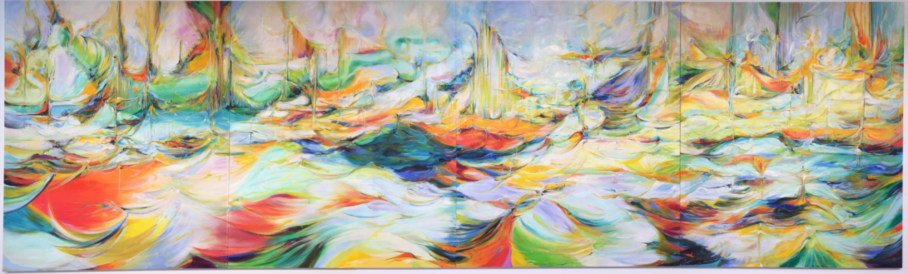
Signed on verso Oil on canvas 96 x 320 in. (NW112)