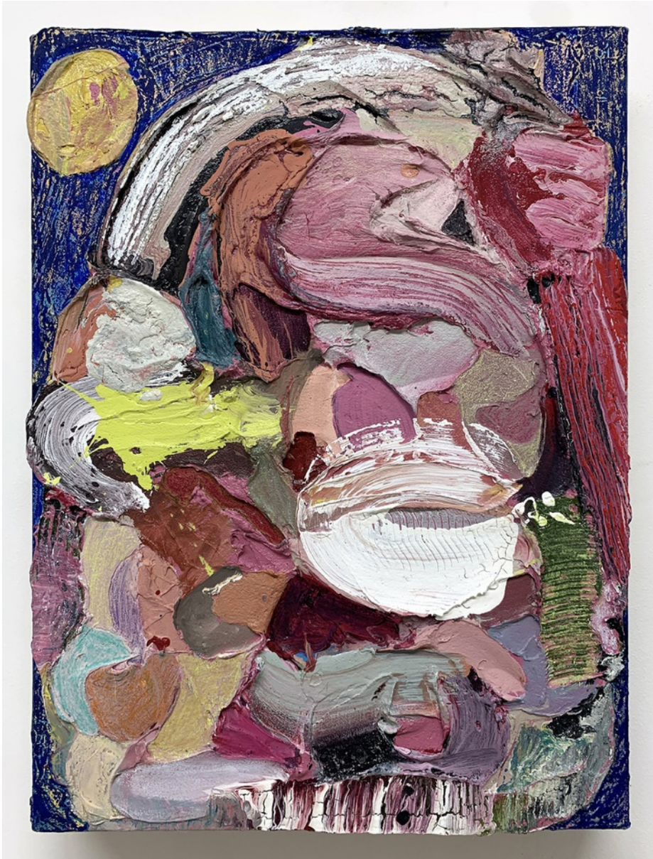
Acrylic, oil, enamel, pastel on canvas 22 x 16 in. (NH001)