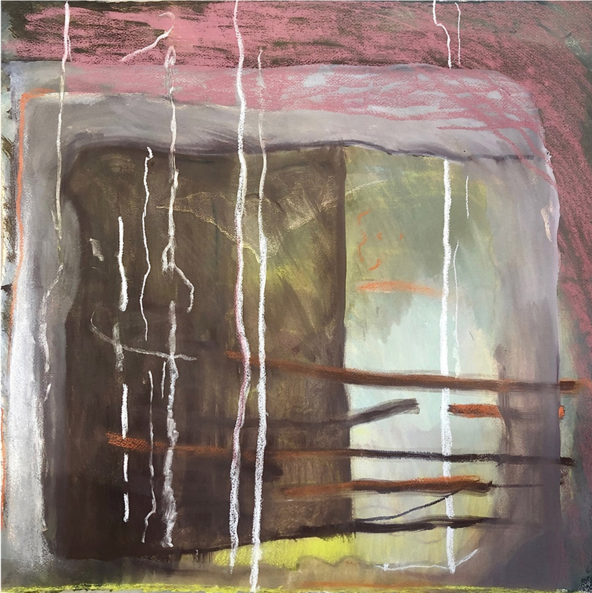
Acrylic and pastel on paper 23 x 22.5 in. (MPK001)