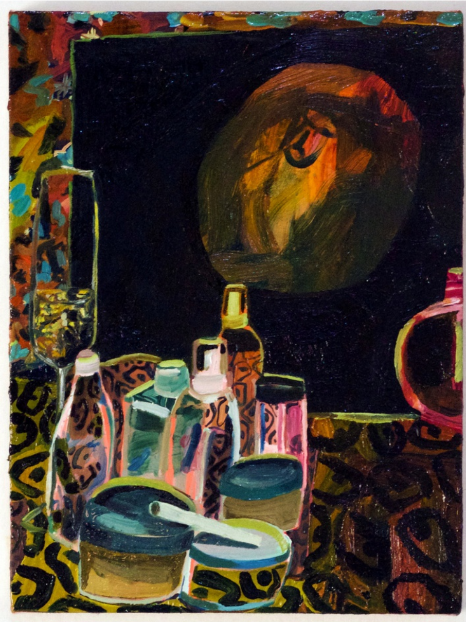
Oil on canvas 16 x 12 in. (KP001)