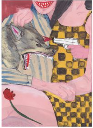
David Heo Exerting Agency, 2020 Construction paper, charcoal, crayon, colored pencil, acrylic gouache and painted paper cutouts on paper 12 x 9 in. (DHEO001)