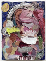
Nicolas Holiber Staring at the Sun, 2020 Acrylic, oil, enamel, pastel on canvas 22 x 16 in. (NH001)