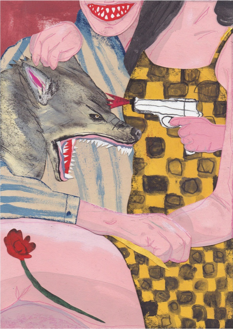
Construction paper, charcoal, crayon, colored pencil, acrylic gouache and painted paper cutouts on paper 12 x 9 in. (DHEO001)