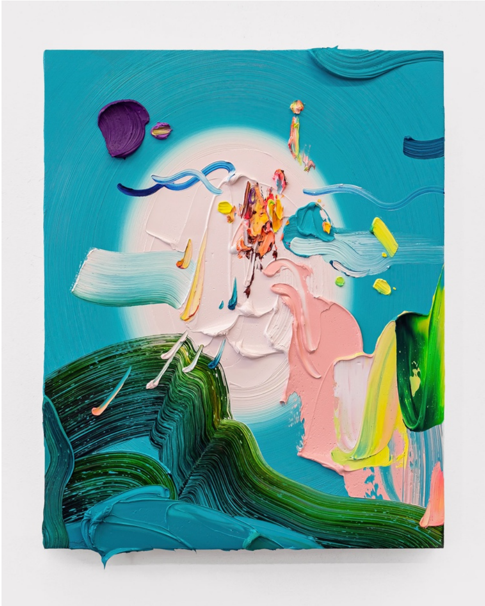
Oil on panel 20 x 16 in. (EL001)