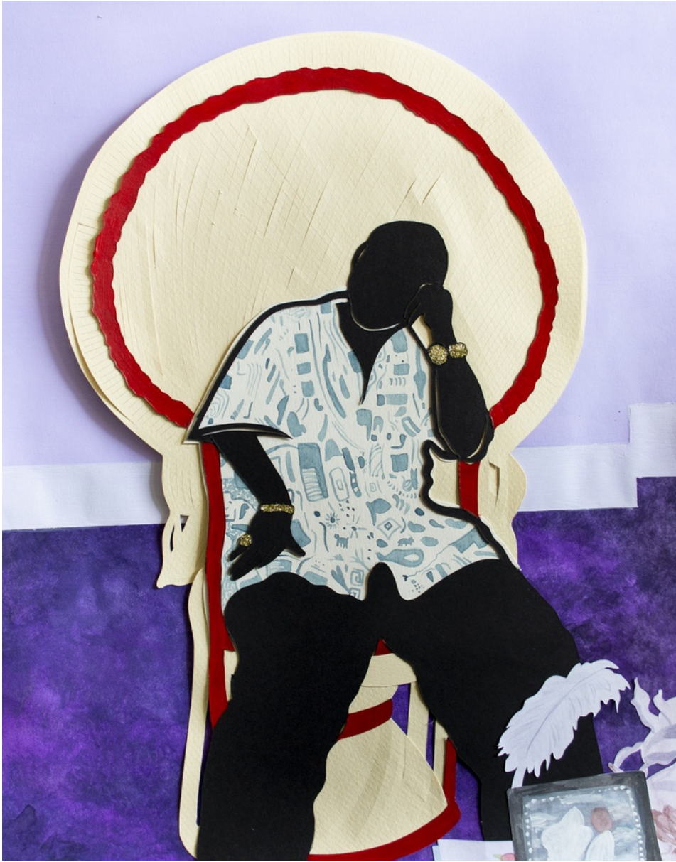
Papercuts, Gouache, Watercolor, Glitter 14 x 11 in. (ODB001)