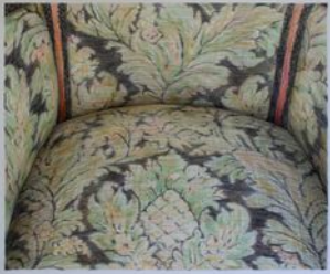
Ada Goldfeld Quarantine Chair, 2020 Colored pencil on paper 14 x 17 in. (AG001)