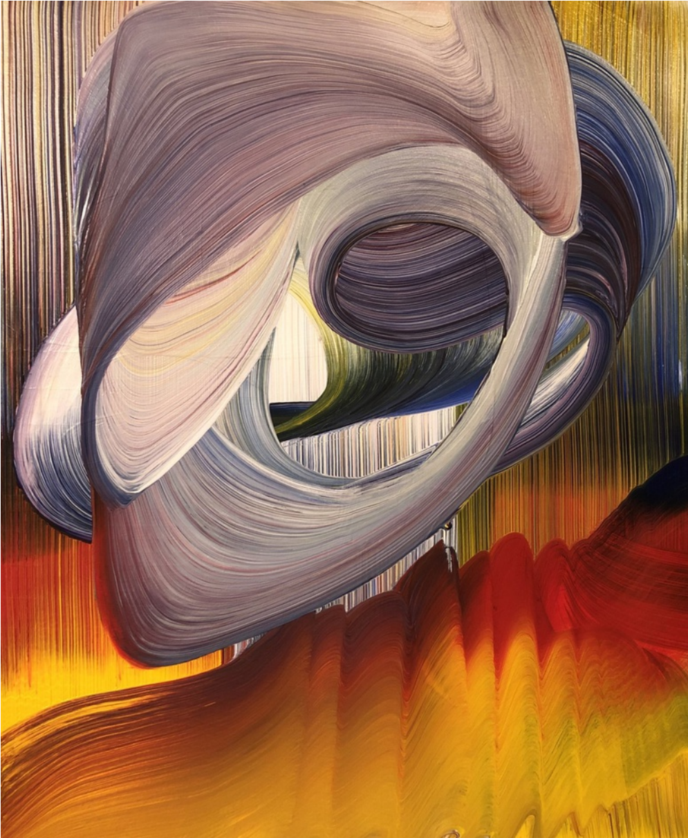
Acrylic and flashe on canvas 26.5 x 22 in. (JOJ006)