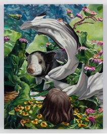
Sean Downey No Place That Does Not See You, 2020 Oil on panel 14 x 11 in. (SD001)