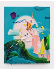
Erin Loree Tropics, 2020 Oil on panel 20 x 16 in. (EL001)