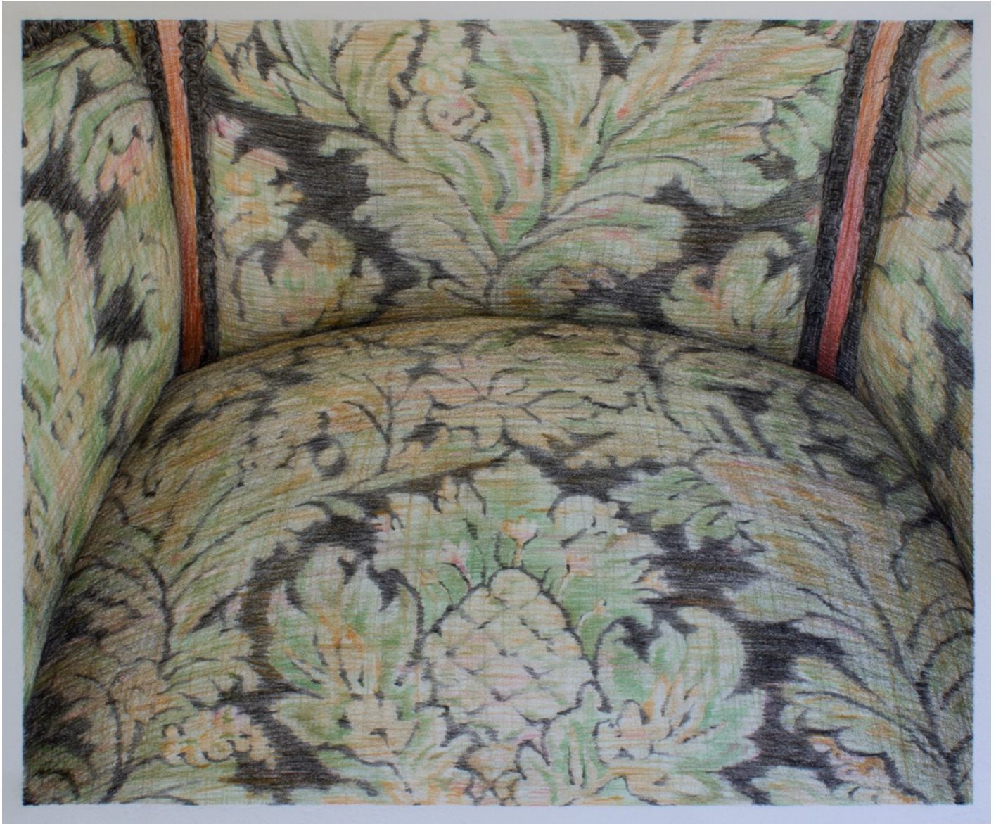
Colored pencil on paper 14 x 17 in. (AG001)