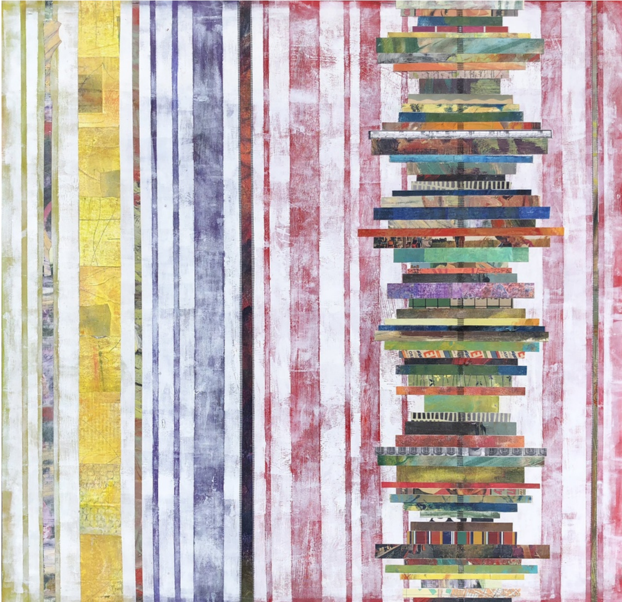
Signed on verso Mixed media, found papers, fiberglass mesh on wood panel 30 x 30 in. (HH077)