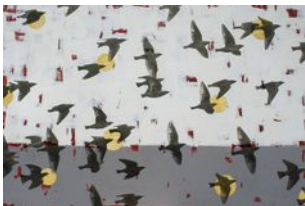
Holly Harrison The Theater of Air , 2021 Signed on verso Mixed media and found papers on wood panel 40 x 60 in. (HH121)