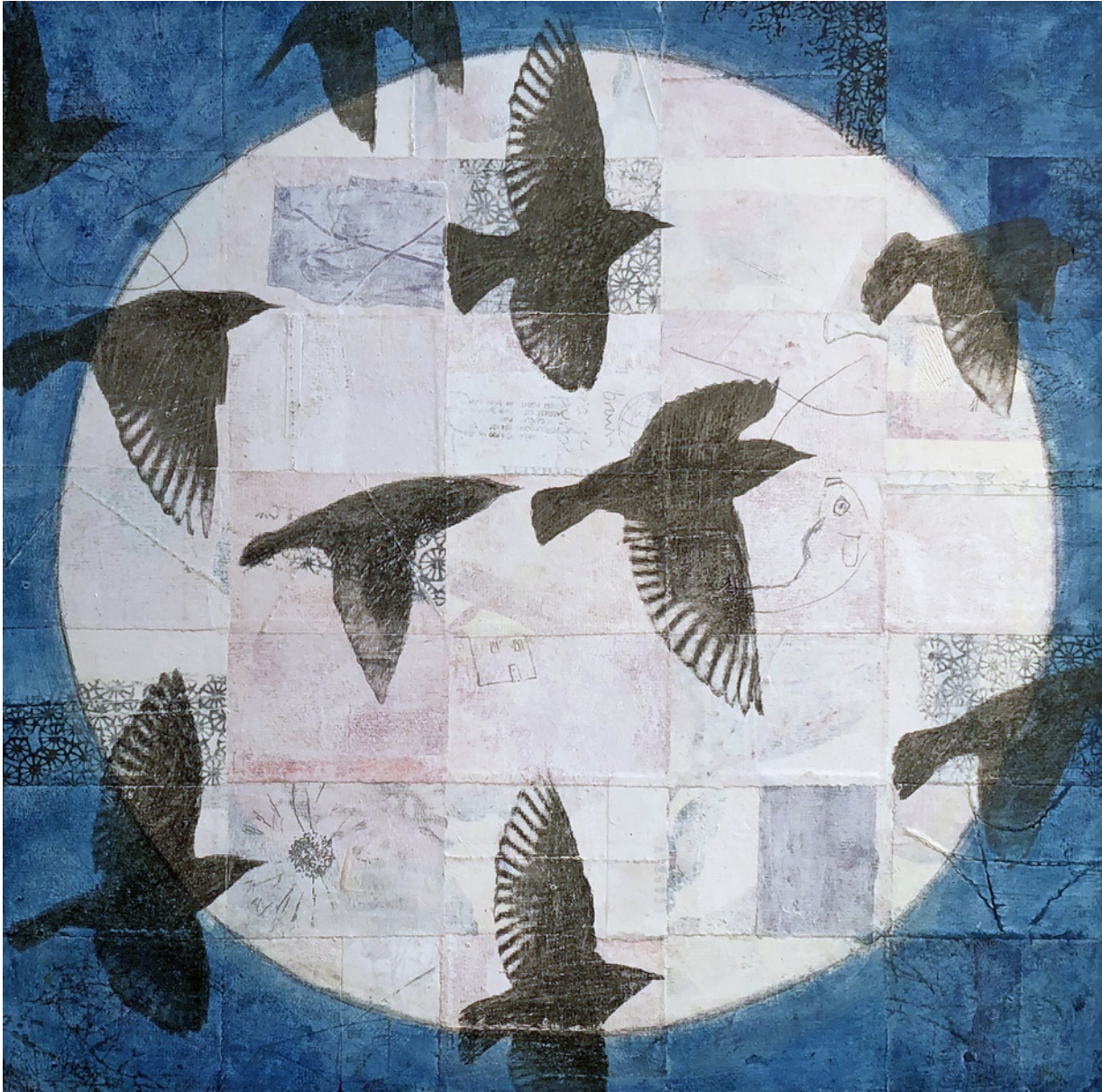
Signed on verso Mixed media, found papers, thread, fiberglass mesh on wood panel 18 x 18 in. (HH081)