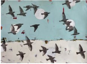
Holly Harrison Snowy Day Murmur , 2021 Signed on verso Mixed media on Arches paper, framed 22 x 30 in. Framed: 25 x 33 x 1.5 in. (HH117)