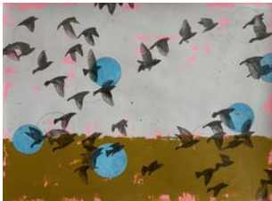
Holly Harrison Murmur (Pink and Ochre) , 2021 Signed on verso Mixed media on Arches paper 22 x 30 in. (HH112)