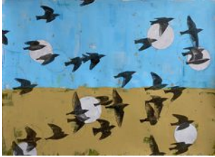
Holly Harrison Sunny Day Murmur , 2021 Signed on verso Mixed media on Arches paper 22 x 30 in. (HH118)