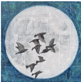
Holly Harrison Luna , 2023 Signed on verso Mixed media, found papers and thread on wood panel 18 x 18 in. (HH129)