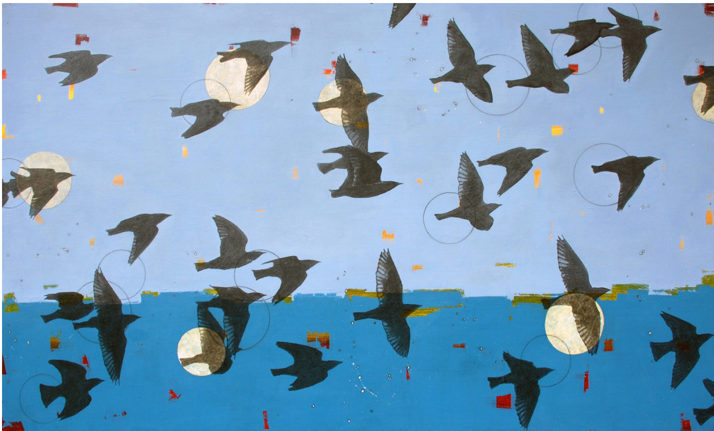
Mixed media and found papers on wood panel 36 x 60 in. (HH126)