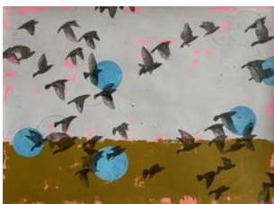
Holly Harrison Murmur (Pink and Ochre) , 2021 Signed on verso Mixed media on Arches paper 22 x 30 in. (HH112)