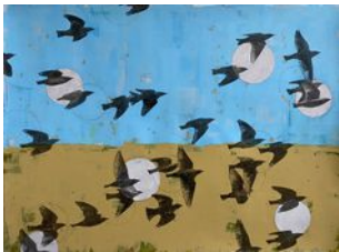
Holly Harrison Sunny Day Murmur , 2021 Signed on verso Mixed media on Arches paper 22 x 30 in. (HH118)