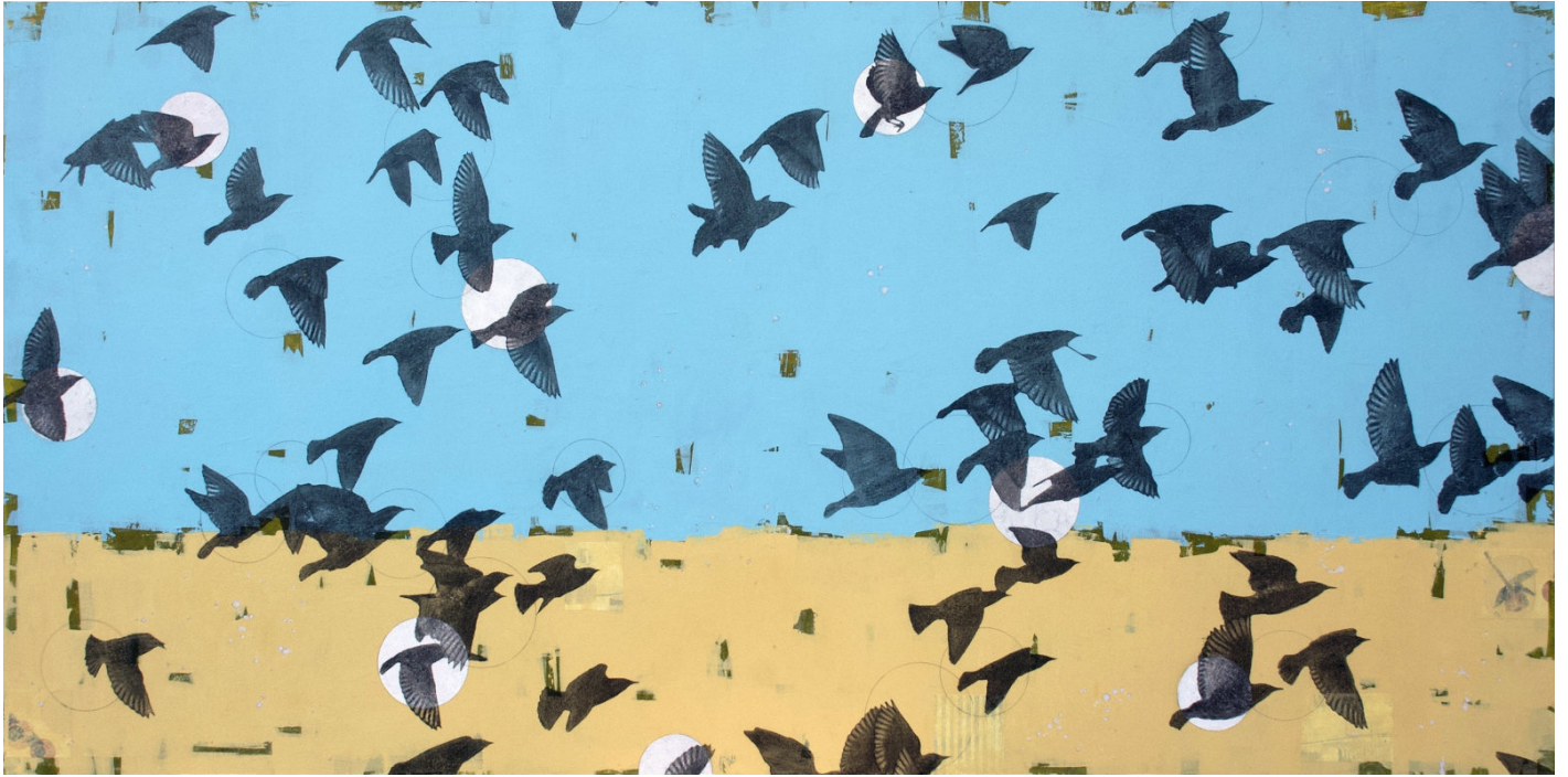
Signed on verso Mixed media and found papers on wood panel 36 x 72 in. (HH120)