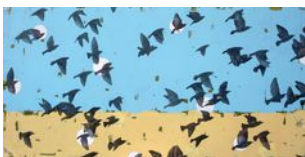
Holly Harrison Lovely Day , 2021 Signed on verso Mixed media and found papers on wood panel 36 x 72 in. (HH120)