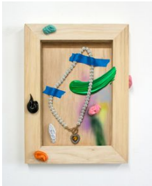
Katelyn Ledford Necklace, Paint, and Gum, 2024 Signed on verso Acrylic, oil, and foam on panel 12 x 9 in. (FFKL035)