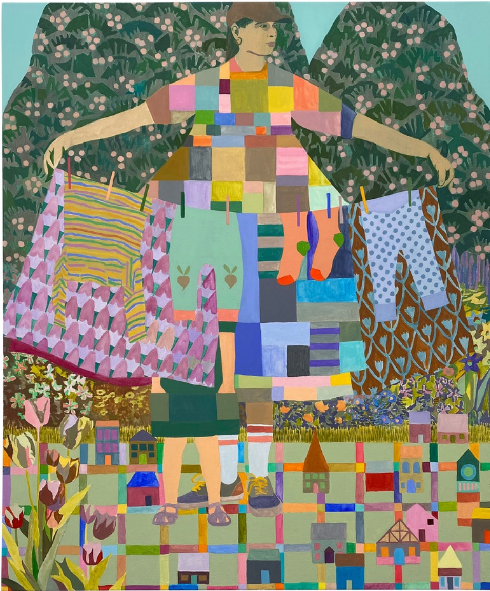
Acrylic and flashe on canvas 36 x 30 in. (EKS009)