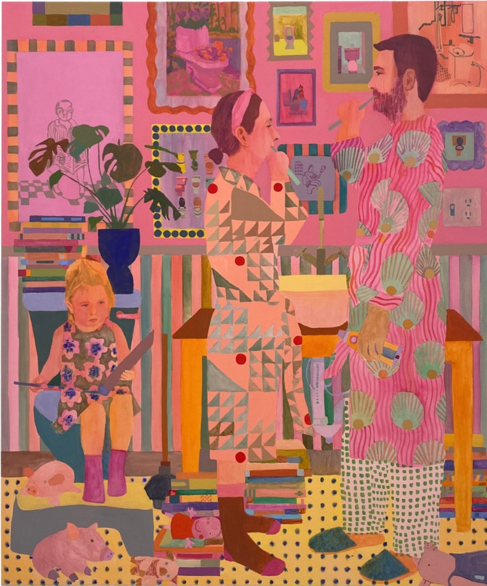
Signed on verso Acrylic and flashe on canvas 36 x 30 in. (EKS007)