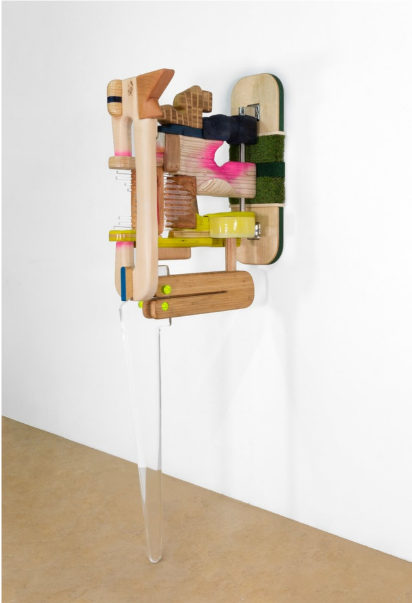
Wood, plywood, bamboo, glazed ceramic, paint, dye, stainless steel grab bar, turf, plexiglass, acrylic rod, hardware, varnish 61 x 16 x 25 in. (CDL014)