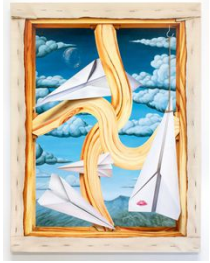
Katelyn Ledford Fleeting, 2023 Signed on verso Acrylic, oil, bristol paper, gouache, modeling paste and rope on canvas 40 x 30 in. (FFKL032)