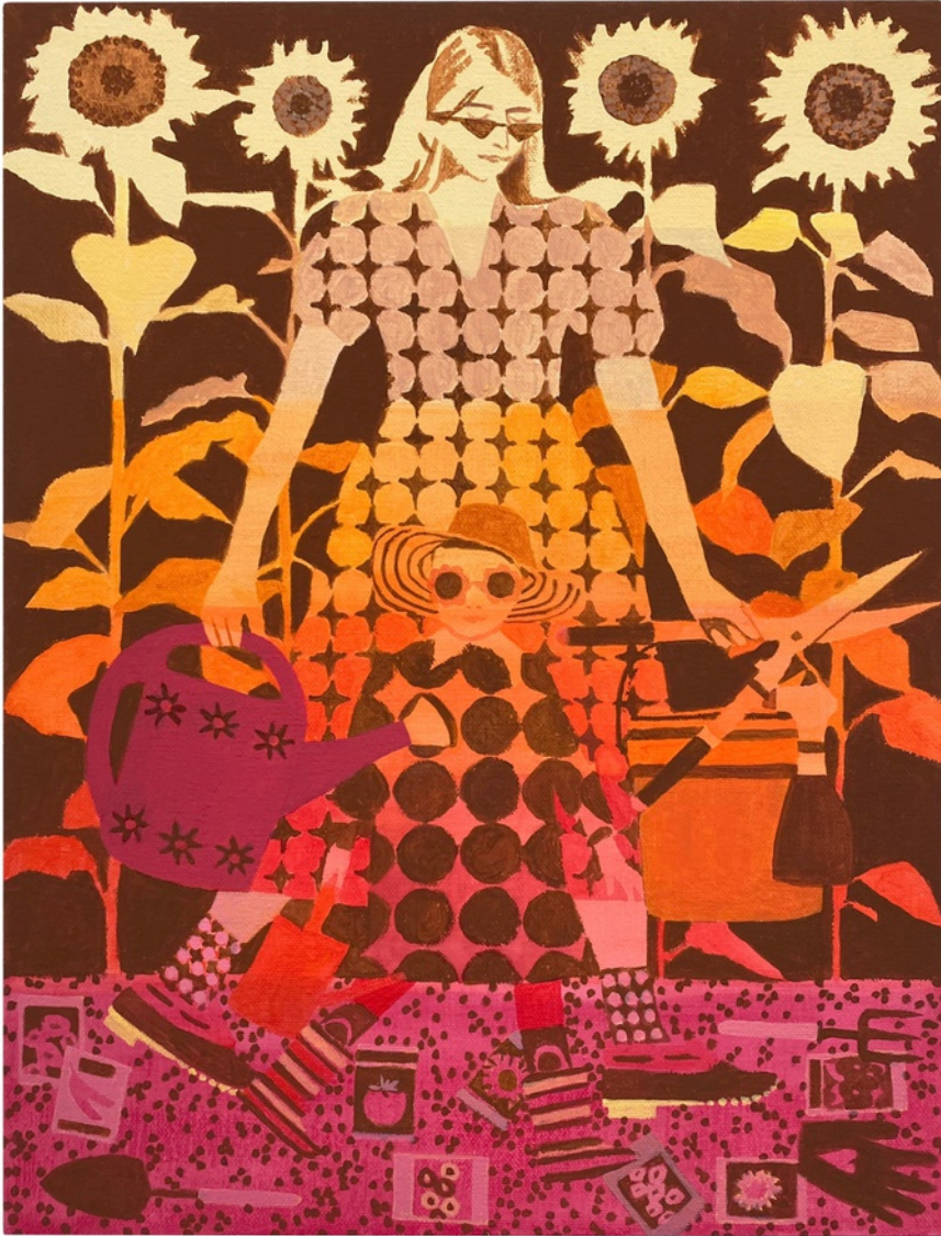
Acrylic and flashe on canvas stretched on wood panel 16 x 12 in. (EKS011)

ELIZABETH KING STANTON Nursery School, 2024