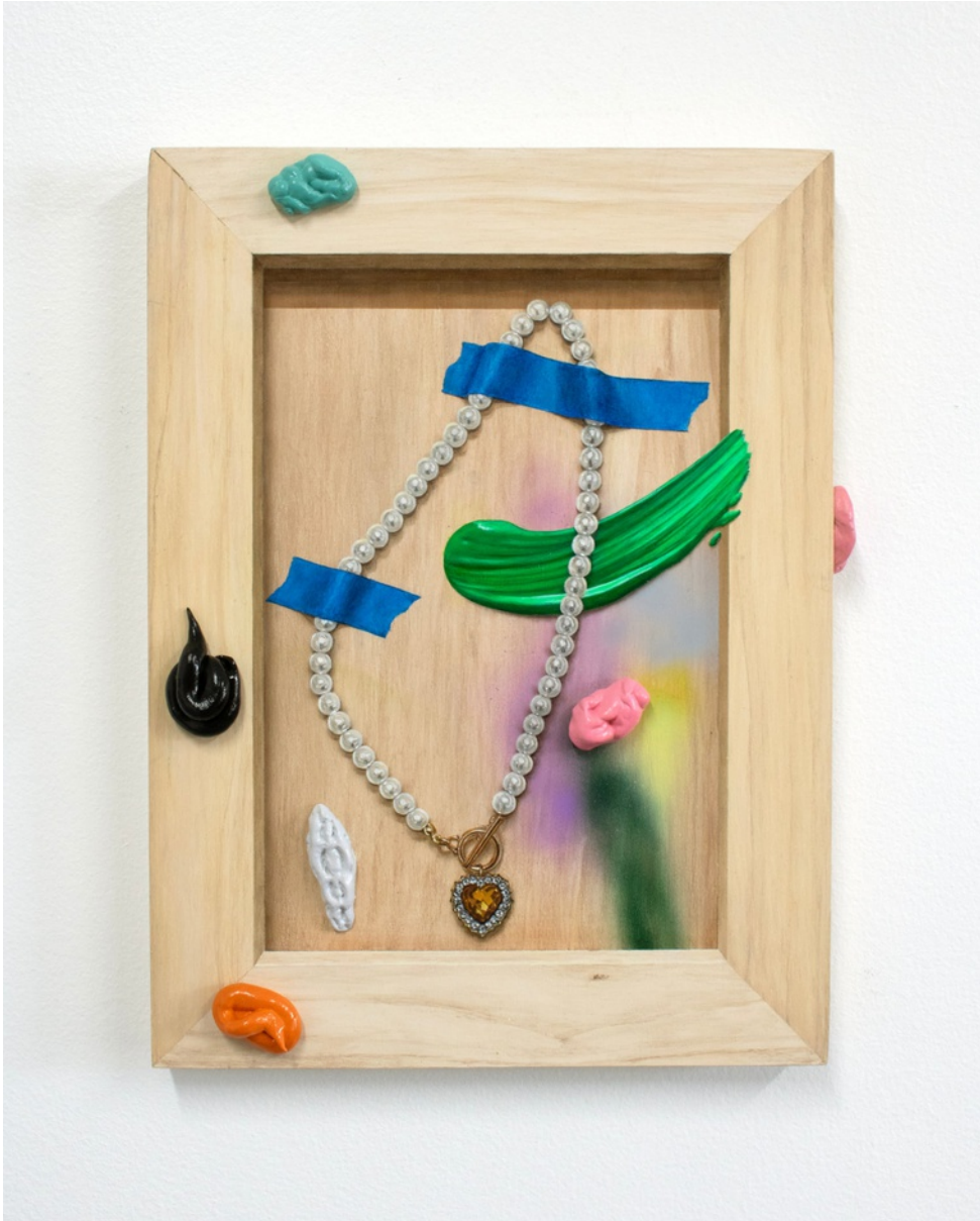
Signed on verso Acrylic, oil, and foam on panel 12 x 9 in. (FFKL035)