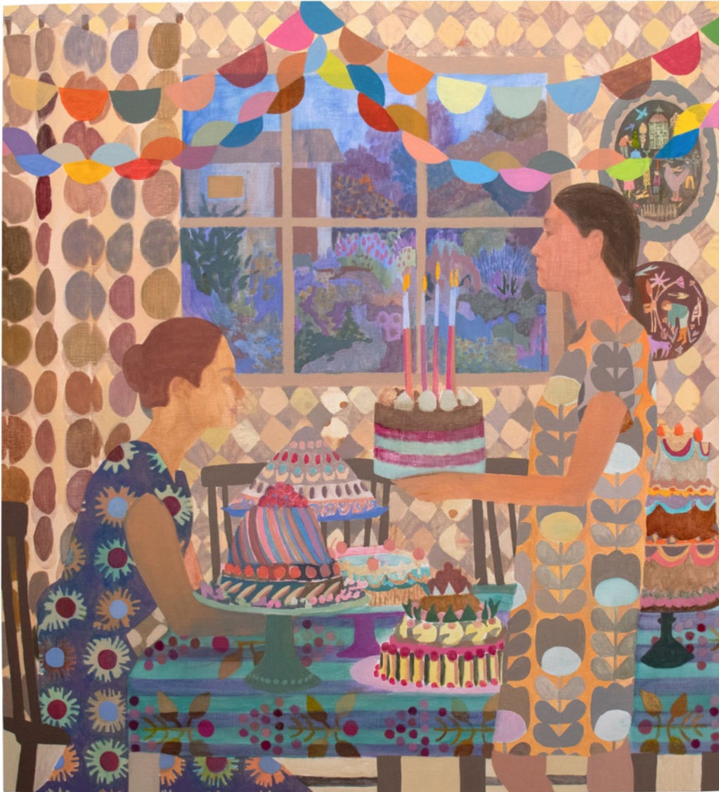
Acrylic and flashe on canvas 39 x 36 in. (EKS006)