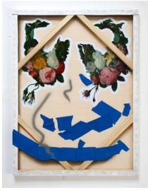
Katelyn Ledford Replicate, Repeat, 2023 Signed on verso 48 x 36 in. (FFKL034)