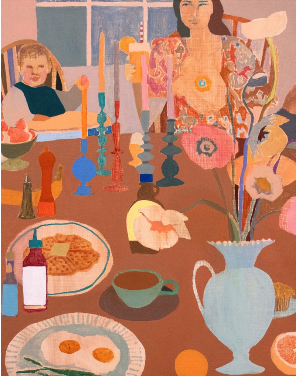
Signed on verso Acrylic and flashe on wood panel 14 x 11 in. (EKS001)