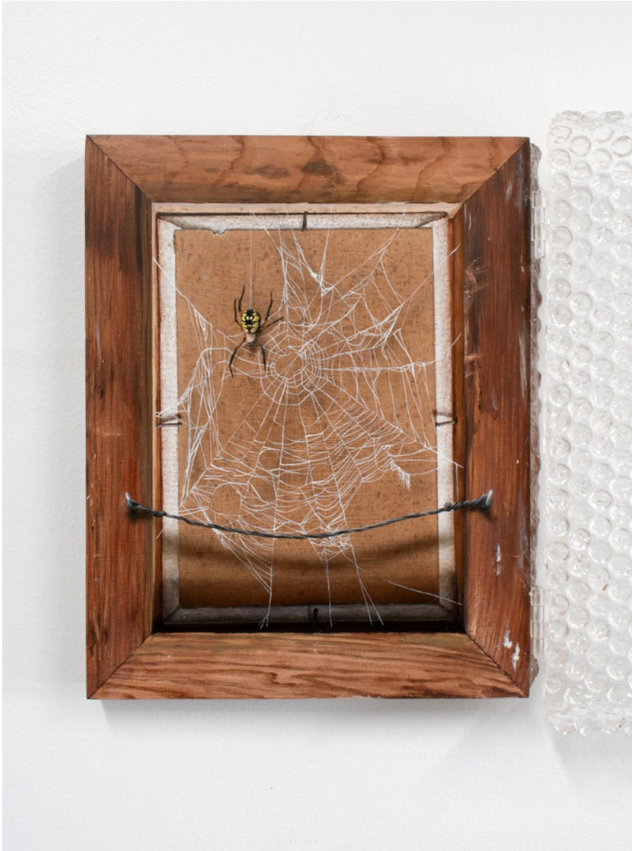
Signed on verso Acrylic, resin, and plastic on panel 10 x 8 in. (FFKL036)