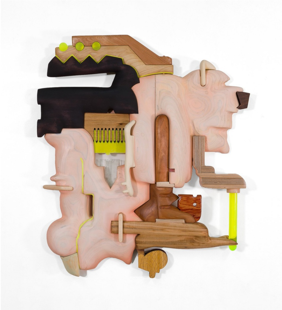
Wood, plywood, plexiglass, acrylic rod, paint, dye, varnish 31 x 26 x 4 in. (CDL016)