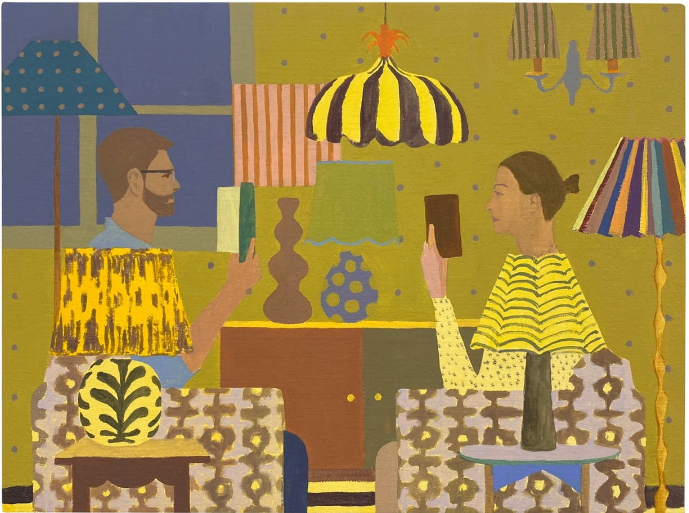
Signed on verso Acrylic and flashe on canvas stretched on wood panel 12 x 16 in. (EKS013)