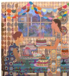
Elizabeth King Stanton How Much Cake Is Too Much Cake, 2024 Acrylic and flashe on canvas 39 x 36 in. (EKS006)