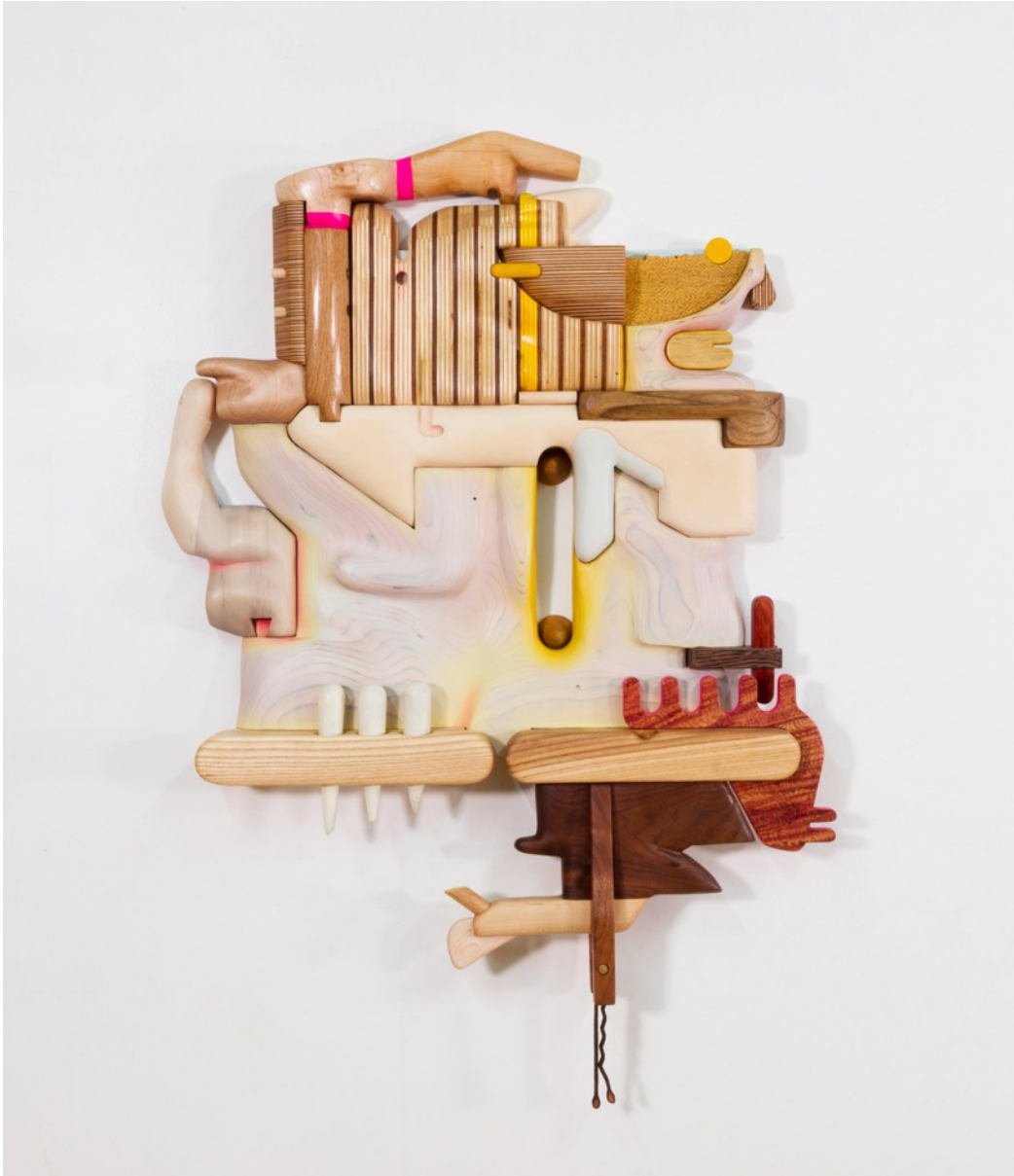
Wood, plywood, paint, dye, ceramic, hardware, varnish 33 x 25 x 3.5 in. (CDL015)