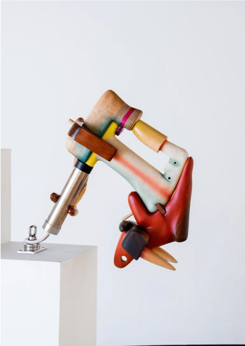
Wood, plywood, glazed ceramic, paint, dye, varnish, stainless steel fishing rod mount 24 x 13 x 20 in. (CDL013)