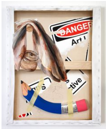
Katelyn Ledford Subjective Objective, 2023 Signed on verso Acrylic, oil, foam, silver lead, and glass micro bubbles on canvas 28 x 22 in. (FFKL031)