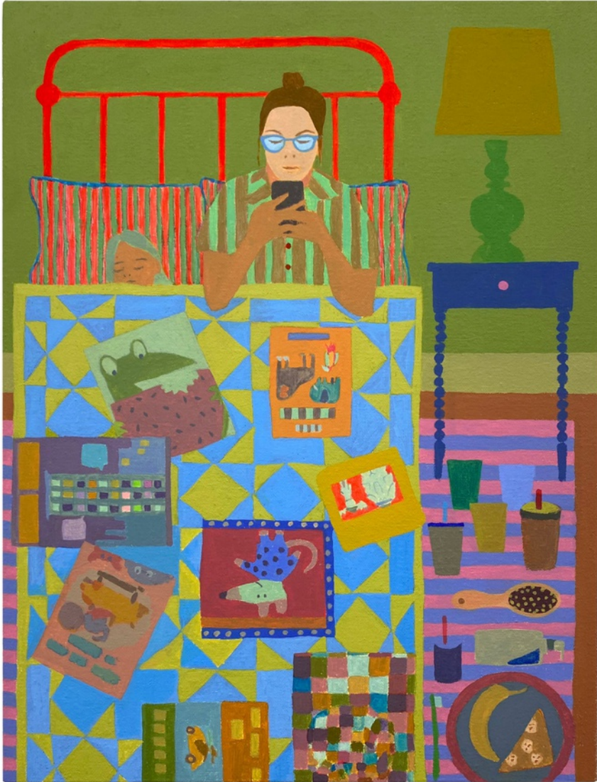
Acrylic and flashe on canvas stretched on wood panel 16 x 12 in. (EKS012)