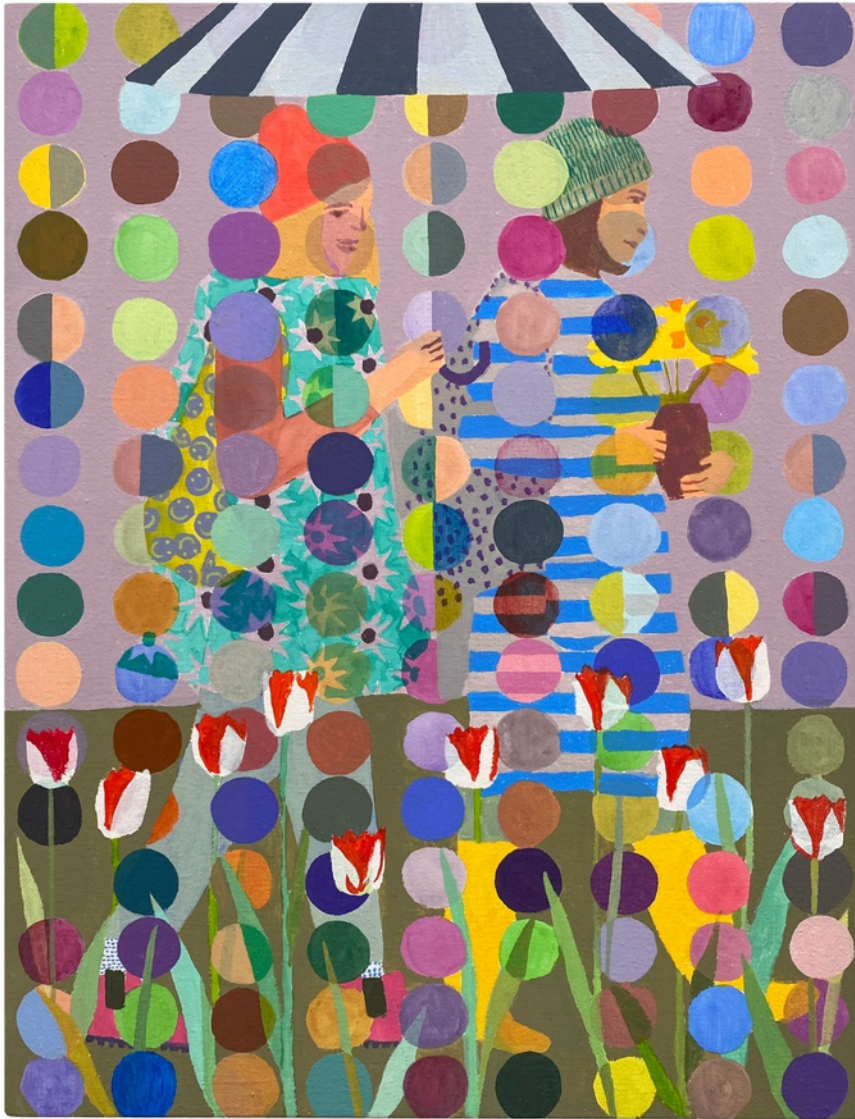
Acrylic and flashe on canvas stretched on wood panel 16 x 12 in. (EKS010)